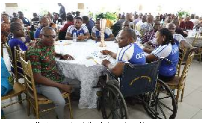
Participants at the Interactive Session