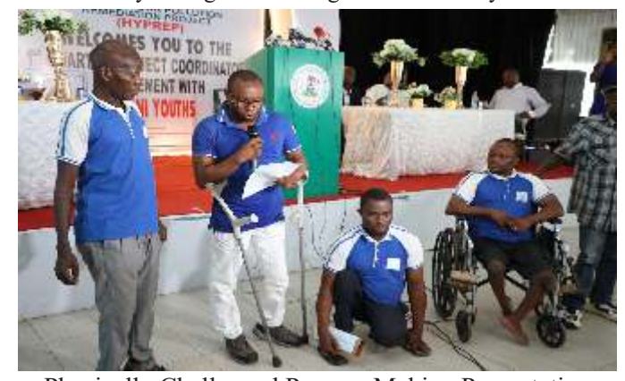
Physically Challenged Persons Making Presentation at the Interactive Session