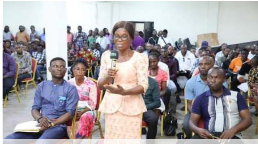
Cross Section of HYPREP Contractors and their Staff at the Safety Meeting

in his remarks described the meeting as an opportunity to share experiences and ideas for improving safety on HYPREP sites. He enjoined contractors to always hold pep talks on safety during toolbox meetings, identify unsafe acts and keep daily records of vital signs.