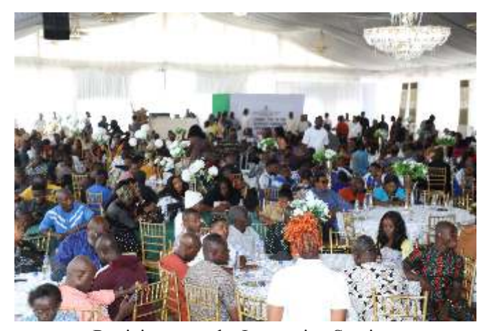
Participants at the Interactive Session