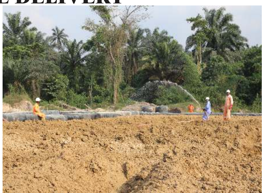
Treatment of Contaminated Soil in Progress

"We are doing public health projects and livelihood projects in line with the objectives of HYPREP. If you look at the gazette that set up HYPREP, the objectives are very clear. The first one is to remediate the contaminated lands and wetlands in Ogoni land including mangrove restoration. The second one is to restore livelihoods of the people and create alternative livelihood opportunities for the Ogoni people. We are responsible for public health study of Ogoniland to strengthen the public health system in Ogoniland. We are also responsible for ensuring security and promoting peacebuilding in the area. Another objective is to