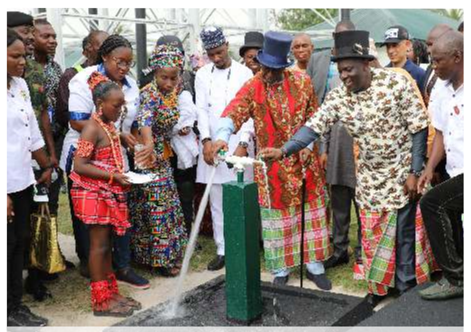
Commissioned Water Project at Terabo, Gokana LGA

it drinkable? Those parameters that we use to measure the potability of the water have been well defined by the World Health Organization, as well as by the European Union and nationally, by the Federal government gazette Number 46, 2011 which is titled National Environmental Surface and Groundwater Quality Evaluation."