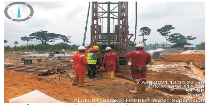
Completed Borehole at Barako Lot 4