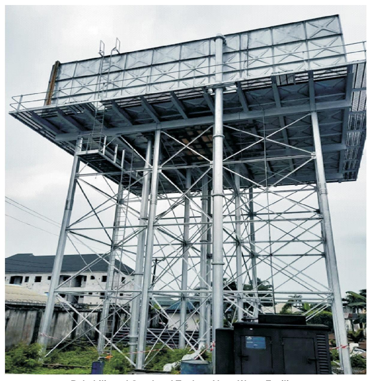
Rehabilitated Overhead Tank at Alesa Water Facility

The activities on sites continued as planned. The contractors, within the period, completed the following activities: rehabilitation of the overhead tank, ground tank, aeration tank, two 350kva generator, ozone treatment system, backwash pump, boreholes, service quarter, transformer, and otherfacilities.