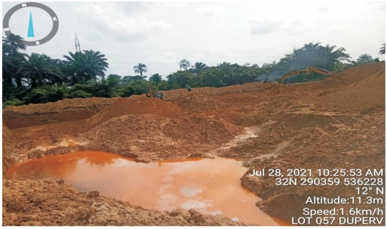
Plate 1.2: Excavation and serial transferring of impacted soil in progress at Lot 057 (New Elelenwa Manifold, Akpajo, Eleme L.G.A). (Remediation Contractor= INTEGRATED CHEMICAL WORKS LTD).