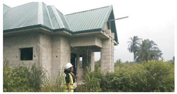
Gokana Area Office