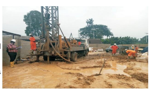
Drilling of Borehole at Ebubu Site

The Contractor has fully mobilised to site and has completed the fencing of Ebubu Headwork, site clearance of Ogale Headwork and has commenced bore hole drilling at Ebubu.