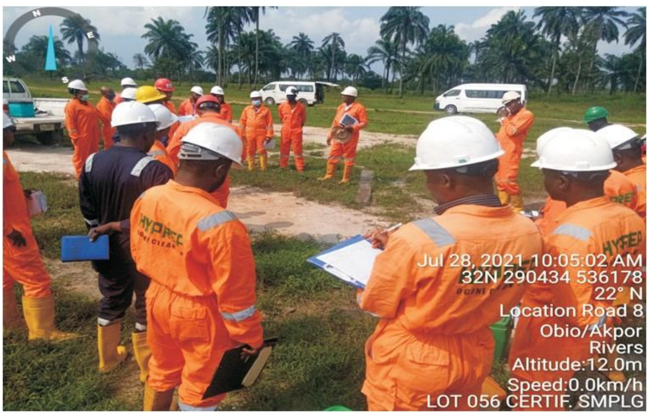
Plate 1.4: Pre-activity briefing (Tool Box Meeting) during the NOSDRA Close-out/Certification Sampling visit to Lot 056 at New Elelenwa Manifold area, Akpajo in Eleme L.G.A).

throughout the last week of July. These were Lots in Batch 2 and included Lot 024 and 026 at B.Dere / Gio in Gokana / Tai L.G.A, Lot 030 at Aabue Korokoro Flow Station in Tai L.G.A, Lot 042 at Korokoro Well 4 in Tai L.G.A as well as Lot 045 at Aleto (Ngofa) in Eleme L.G.A. The affected Lots were re-scheduled to be visited in August 2021.