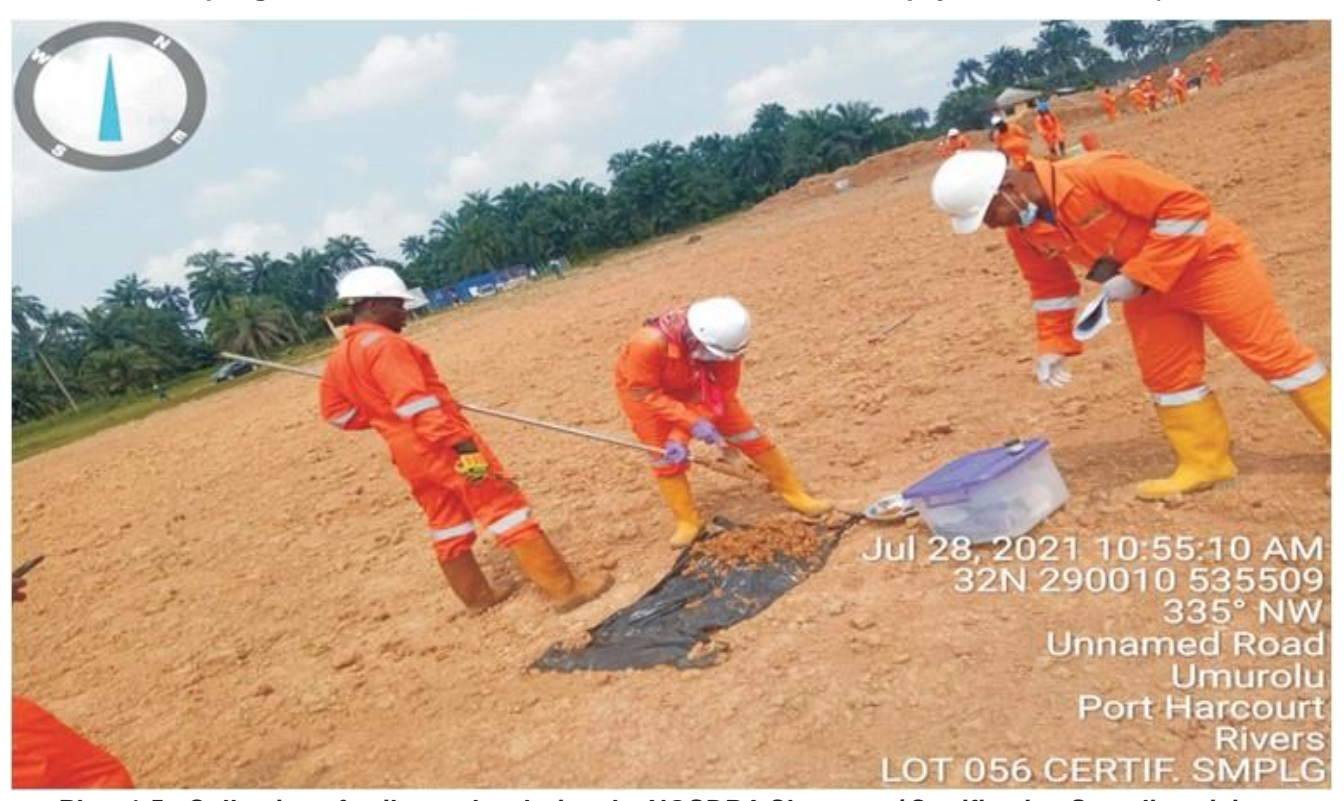
Plate 1.5: Collection of soil samples during the NOSDRA Close-out / Certification Sampling visit to Lot 056 at New Elelenwa Manifold area, Akpajo in Eleme L.G.A). In the background are heaps of soil at neighbouring Lot 057 where excavation and treatment of impacted soil are still on-going. Lot 056 Contractor: AWA ENGINEERING COMPANY LTD.