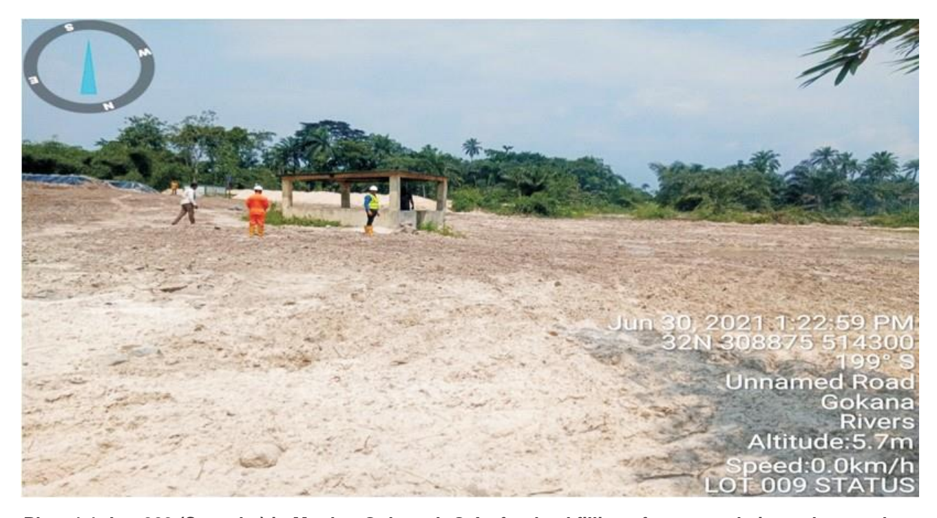
Plate 1.1: Lot 009 (Saanako) in Mogho, Gokana L.G.A after backfilling of excavated pits and general site levelling. (Contractor: ODUN ENVIRONMENTAL LTD).