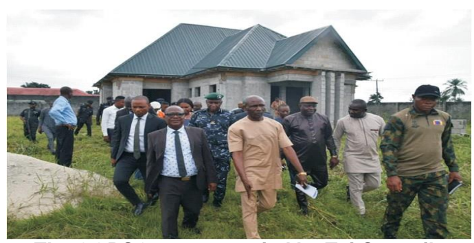
The OOPCO, accompanied by Tai Council Chairman on an inspection tour of the Area Office in Tai Council Secretariat

The Contractor, Newline West Africa has completed the erection of the super structure and installation of the roof covers, and structure of the office building. Looking ahead to finishing works including plastering, installation of plumbing, electrical fitting and the office doors andwindows.