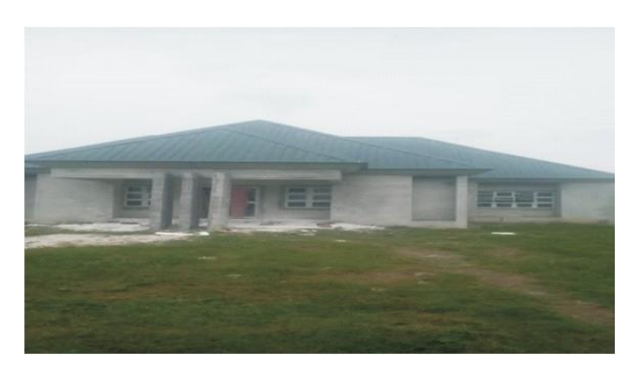
Khana Area Office

The Contractor, Secura Investment Limited has completed the execution of the Super structures, roofing, fittings of doors, windows and electrical piping, plastering. Currently, work is in progress, the installation of the POP ceilings is complete, electrical installation is also complete, and the installation of the plumbing is at 50% completion, tiling is about tocommence.