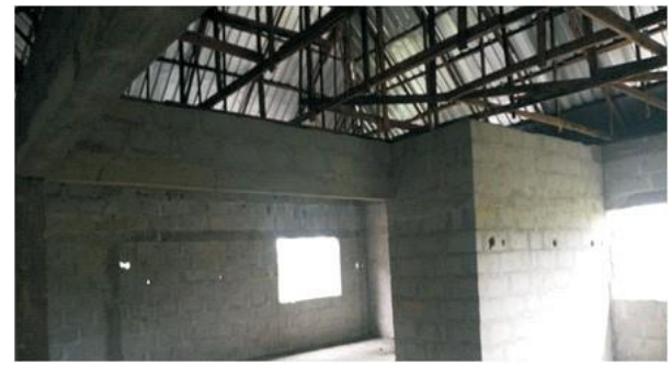
External and Internal Works at Gokana Area Office

The Contractor, Centennial Development Ltd has completed the erection of the super structure and installation of the roof covers and structure of the office building. Looking ahead to finishing works including plastering, installation of plumbing, electrical fitting and the office doors andwindows.