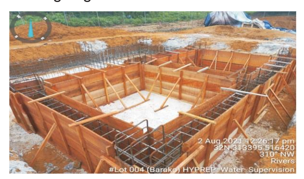
Construction of Foundation for Overhead Tank at Barako Lot 4

The Contractor had completed the Geophysical surveys and clearing of site at Barako. They have also completed their borehole drilling. Overhead tank construction and staff quarter are ongoing.