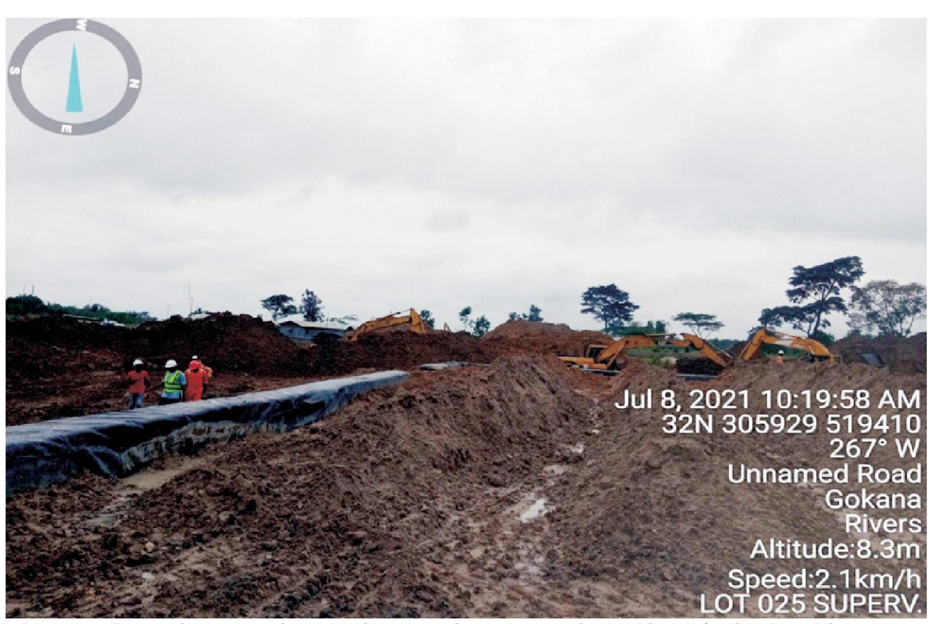
Plate 1.3: Excavation contaminated soil undergoing treatment in the Biocell (solid phase bioreactor cell) at Lot 025 (B. Dere / Gio, Gokana / Tai L.G.A). Remediation Contractor = SUBADOM GLOBAL RESOURCES LTD.