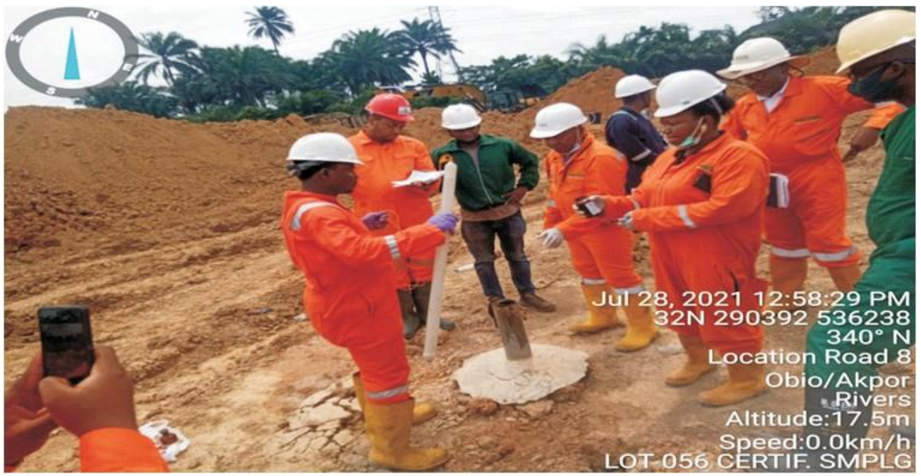
Plate 1.6: Collection of groundwater samples from remediation defensive / monitoring wells during the NOSDRA Close-out / Certification Sampling visit to Lot 056 at New Elelenwa Manifold area, Akpajo in Eleme L.G.A). Contractor: AWA ENGINEERING COMPANY LTD.