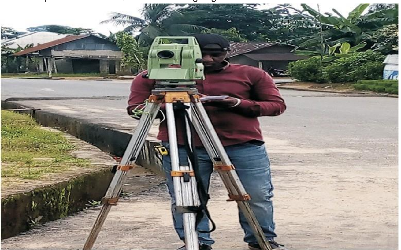
Survey for Flow Network Analysis at Korokoro

The Contractor has completed the Geophysical surveys and clearing of site in preparation to commence the Site construction activities. He has completed the fencing of Korokoro site. Construction of staff quarter is ongoing at both Korokoro and Nonwa. Borehole drilling has been completed at Korokoro, while work is ongoing at Nonwa.