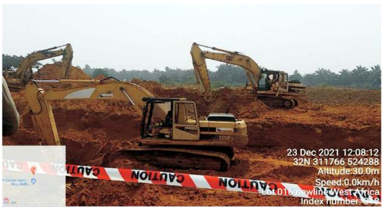
Plate 1.1: Excavation of impacted soil in progress at Lot 016, Buemene Korokoro Well 05, Tai L.G.A. (Contractor: NEWLINE WEST AFRICA LTD)