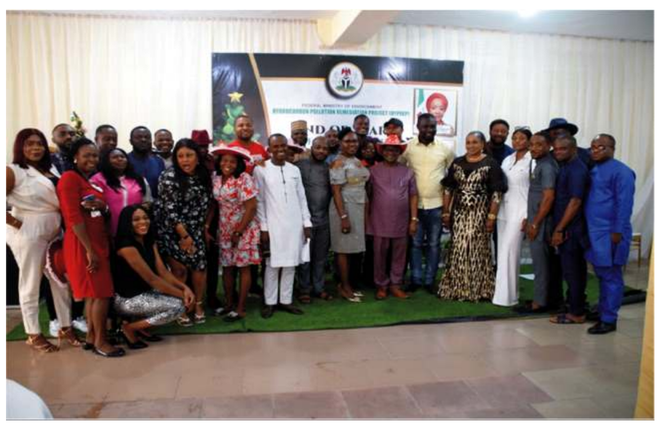
Group photograph of Management and Staff