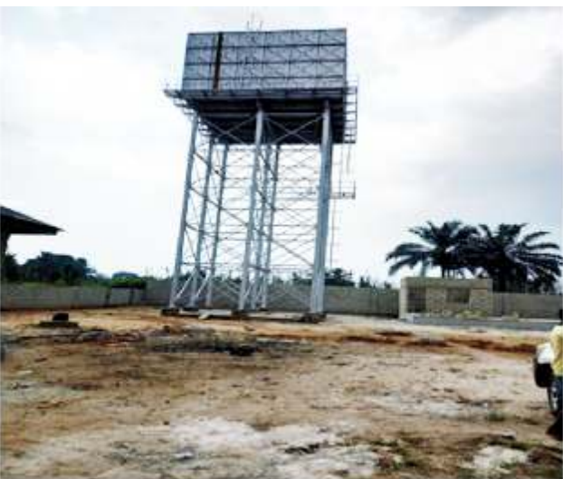
Constructed and installed Overhead and Ground Tanks at Barako