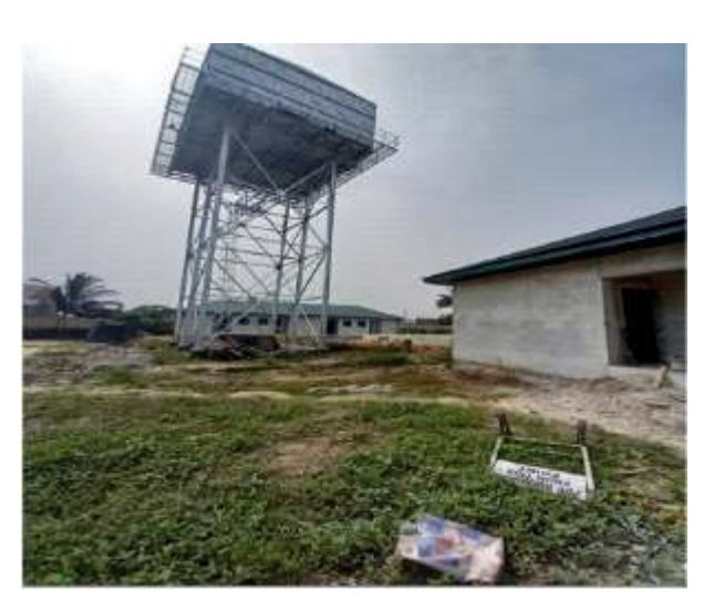
Rehabilitated Ogale Booster Station