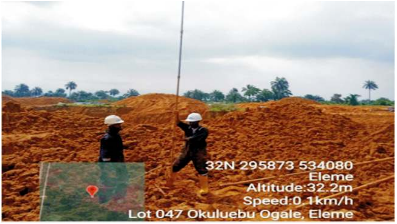
Plate 1.6: Collection of soil samples by manual slim hole augering during NOSDRA Close-out / Certification Sampling at Lot 047 -Okuluebu 2 (SPDC Ajeokpori Well Head 003), Ogale, Eleme L.G.A.

(Remediation Contractor: LAPIDEO MULTI SERVICES LTD)