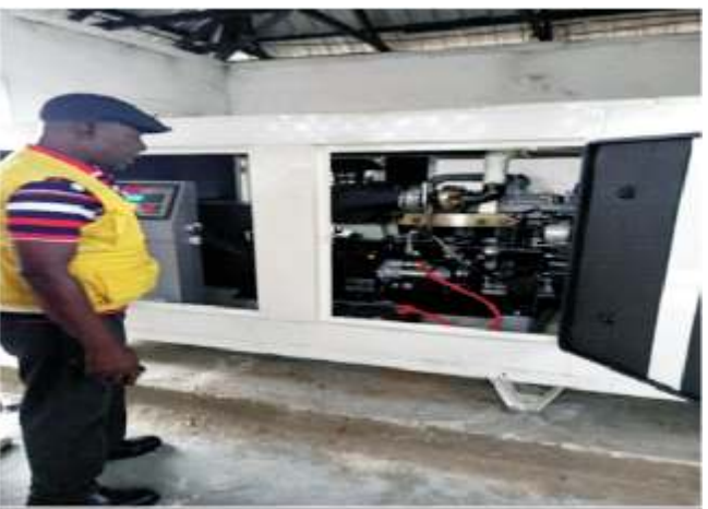
Installed 80KVA Generator at Agbonchia