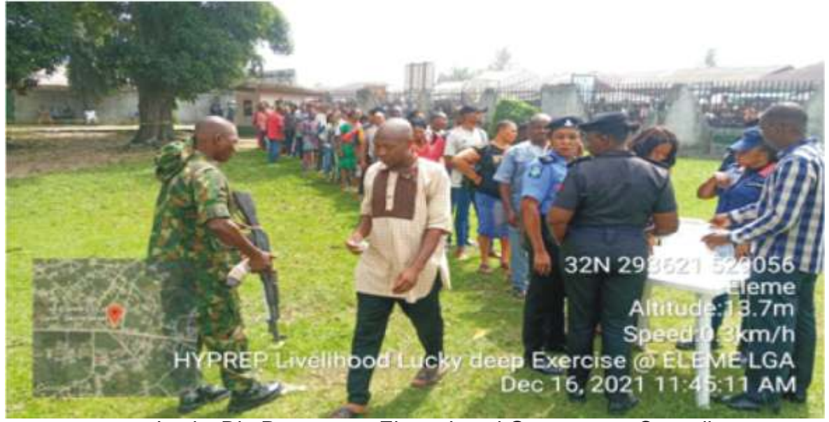
Lucky Dip Process at Eleme Local Government Council