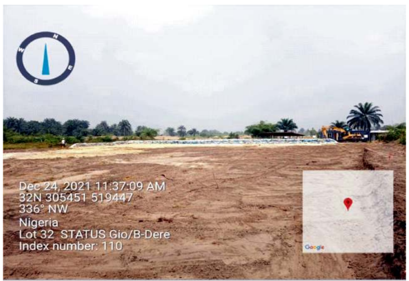
Plate 1.3: Construction of engineered biocell in progress at Lot 032 B.Dere / Gio, Gokana / Tai L.G.A. Remediation Contractor - MOSITO ENVIRON CONSTRUCT LTD