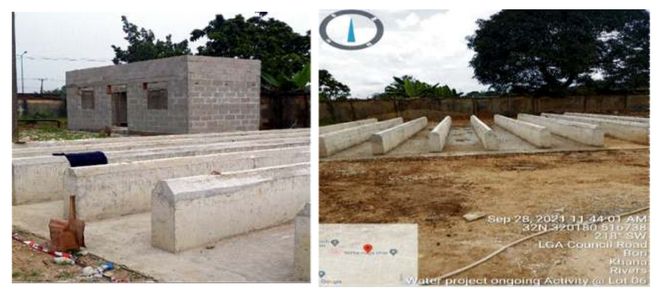
Ongoing construction of pump house and Ground Tank Foundation at Bori