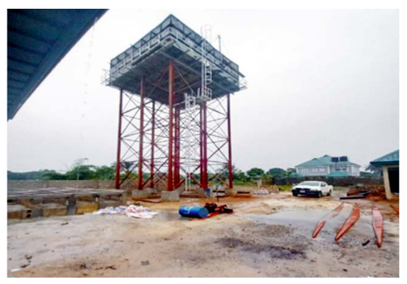
Overhead Tank at Nonwa