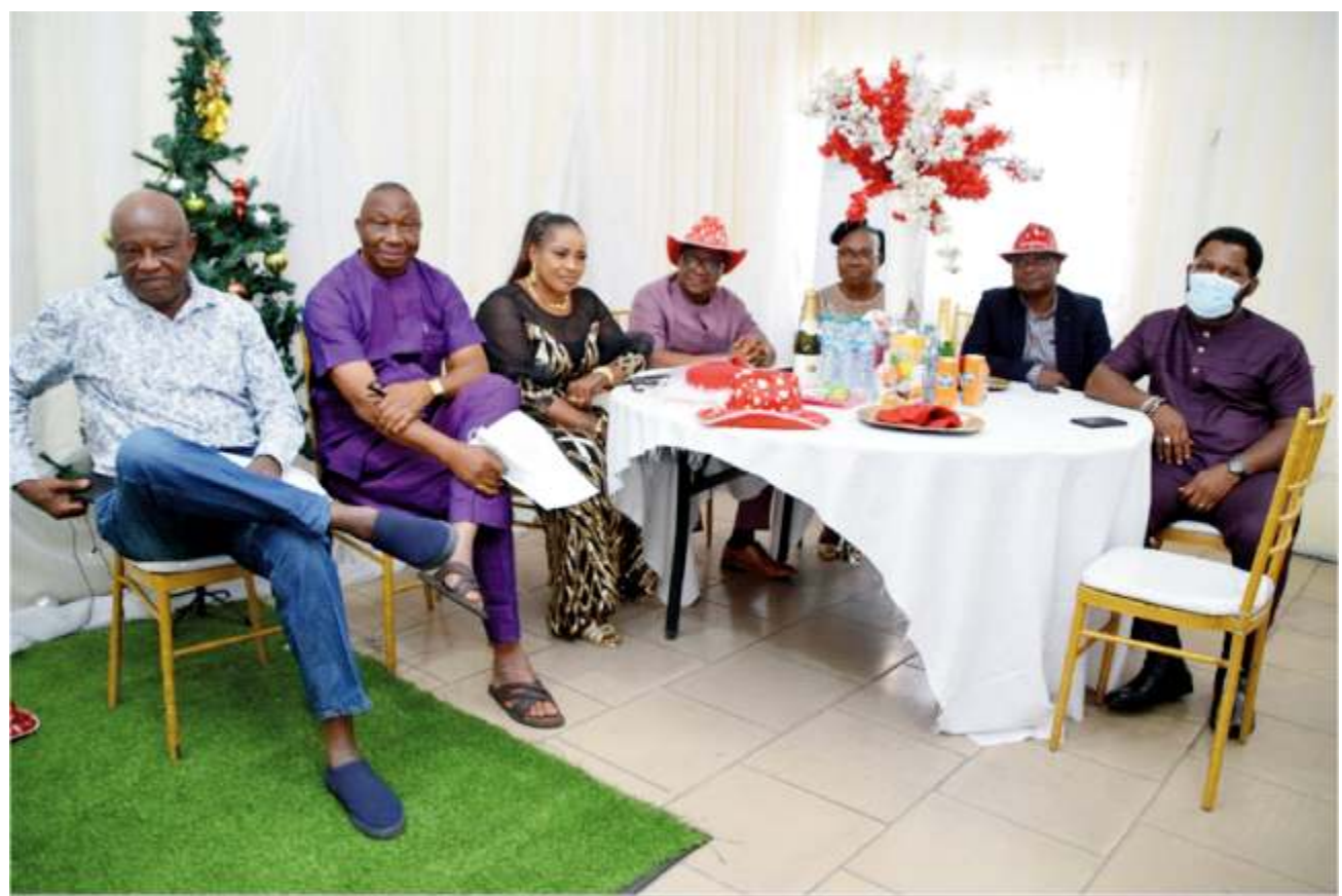
Management Staff with SPDC Rep

The party was fully attended by Management and Staff of HYPREP.