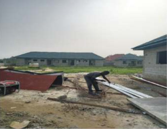
Staff Quarters construction works at Korokoro and Nonwa sites ongoing