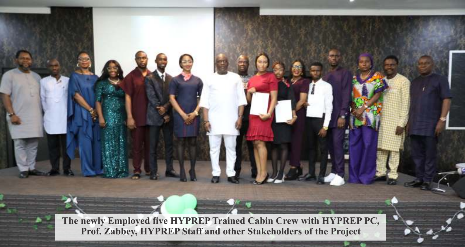
The newly Employed five HYPREP Trained Cabin Crew with HYPREP PC, Prof. Zabbey, HYPREP Staff and other Stakeholders of the Project

connect with people to make passengers feel safe, comfortable, and valued. A cabin crew member is an ambassador of hospitality, representing not just the airline but also the warmth and hospitality of the Ogoni people.”