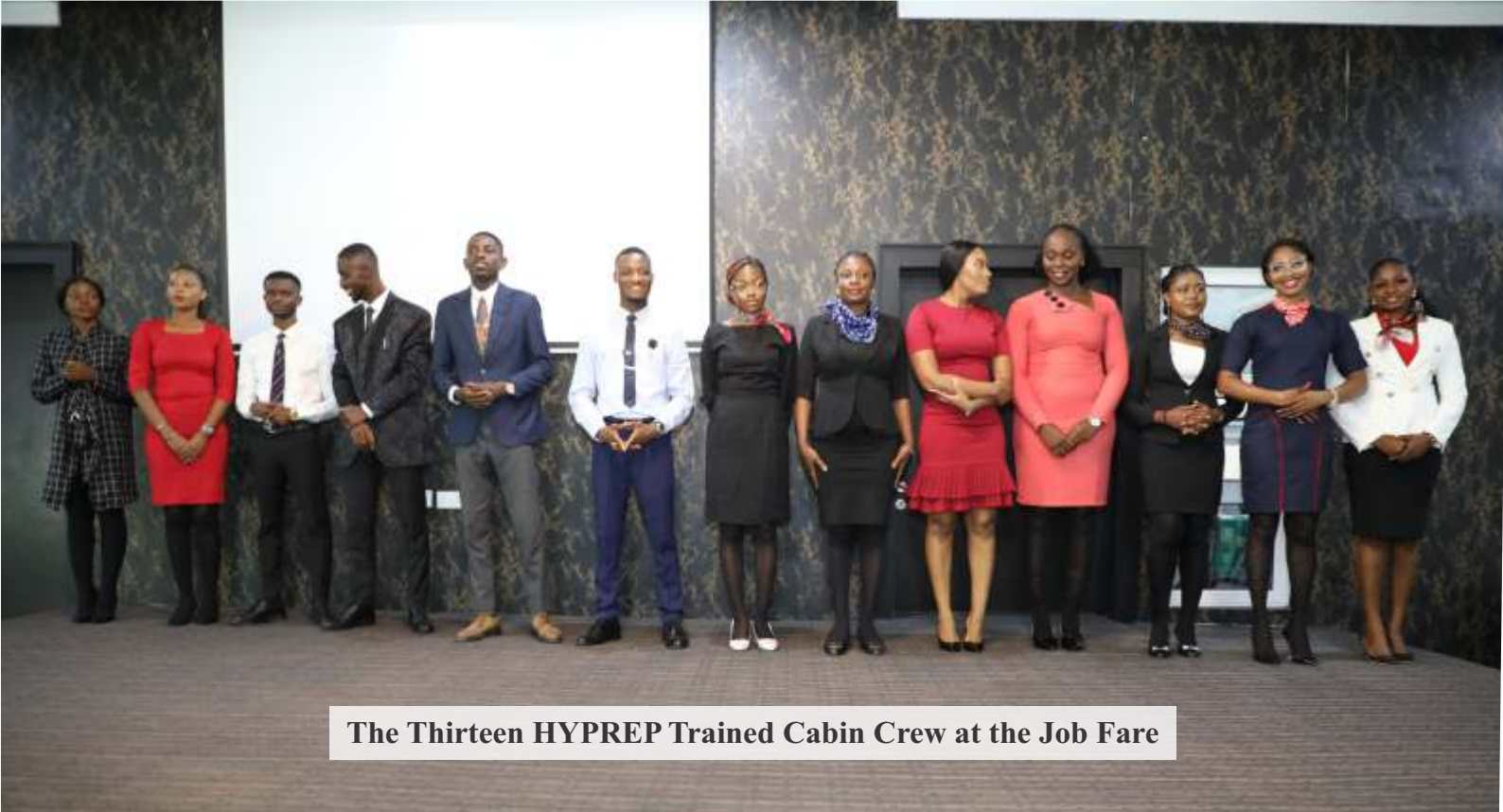
The Thirteen HYPREP Trained Cabin Crew at the Job Fare

actualizing some of the recommendations in the UNEP Report and urged the Project to continue to pursue its programme in line with its mandate.