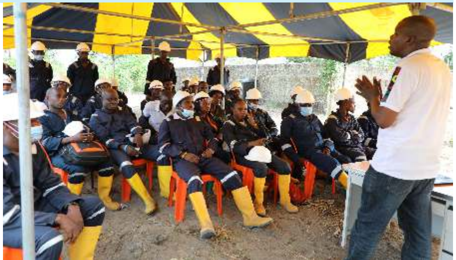
Community Workers during their HSE Induction

“HSE is all about our well-being. It is about the protection of the environment, and carrying out our