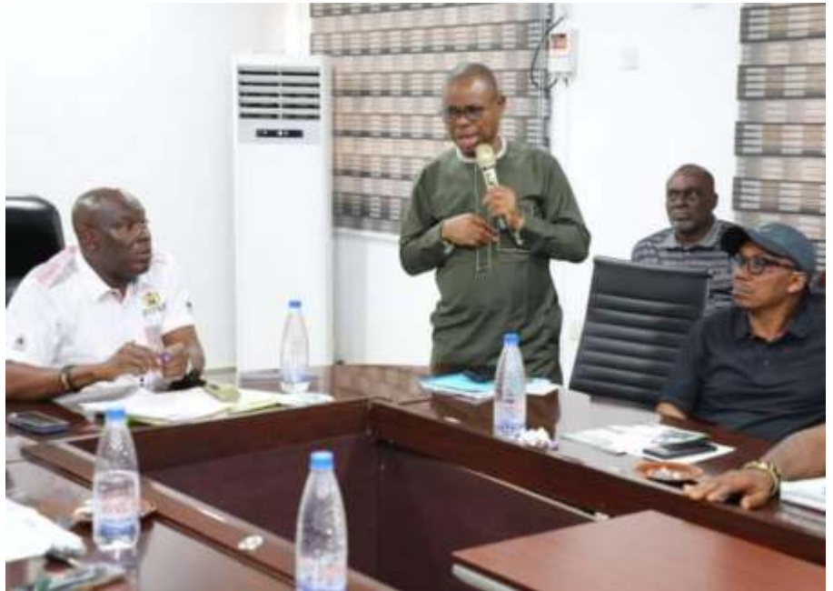
Members of Bomu Community during their Visit to HYPREP Project Coordination Office