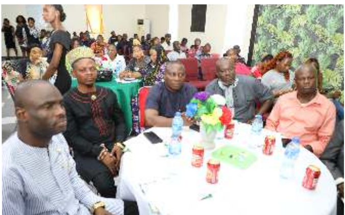
Cross Section of Guests at the HYPREP/Dana Air Job Fare