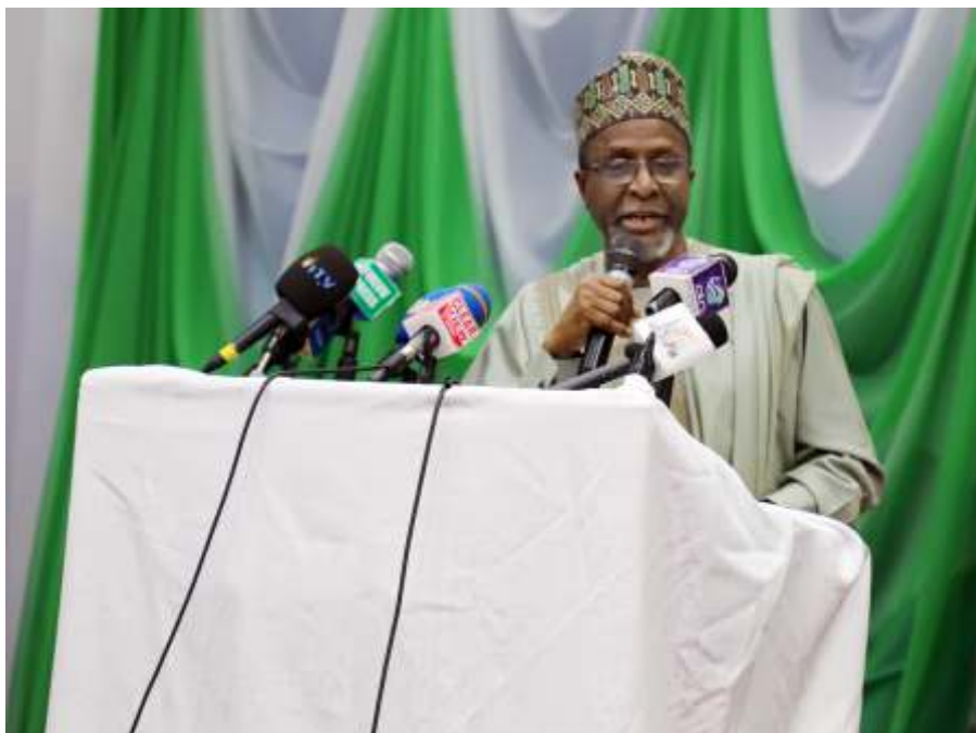
Environment Minister, Balarabe Lawal Addressing Participants at the 17th meeting of the National Council on Environment

The Honourable Minister stated that deliberate policies and regulations must be put in place to safeguard whatever achievements and effort made in environmental conservation