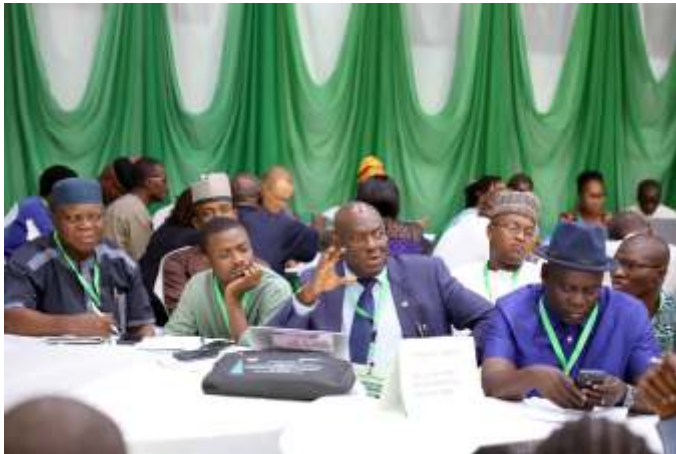
Participants at the 17th National Council on Environment