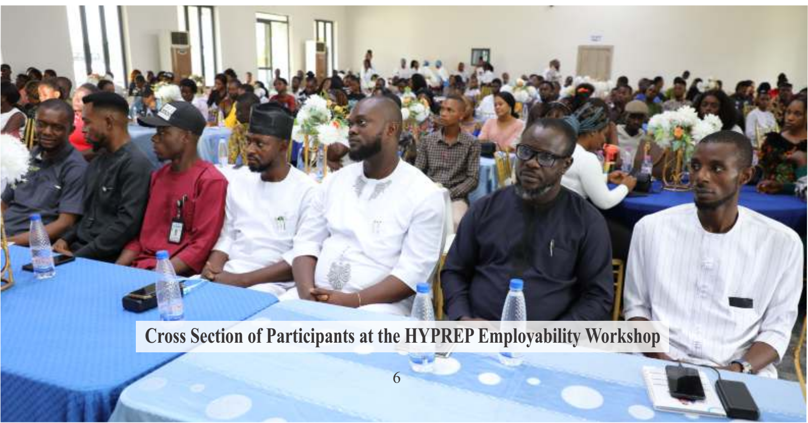
Cross Section of Participants at the HYPREP Employability Workshop

Odon regretted that students in tertiary institutions instead of using the opportunities around them to build their capacity, were busy pursuing needless and irrelevant things on social media, instead of using the same social media to intentionally drive their career initiatives.