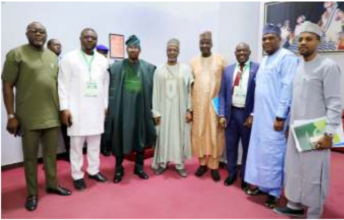
Honorable Minister, Environment, Balarabe Lawal with Key Officials at the 17th National Council on Environment