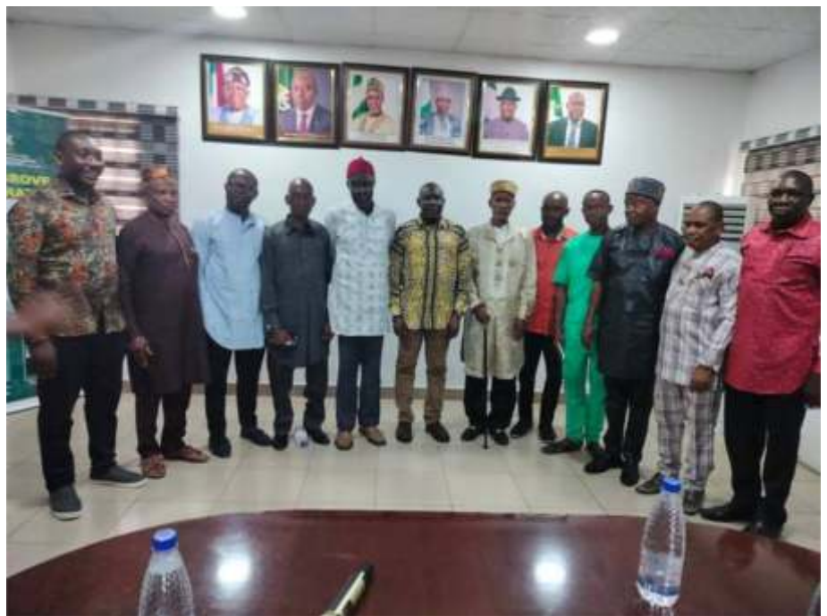
Members of Bodo Community during their Visit to HYPREP Project Coordination Office

(ZRC) which are the conflict resolution mechanisms of the Project, are saddled with the responsibility of intervening in community crisis as it relates to HYPREP'S contracts, urging them to explore civil means to resolving conflicts.