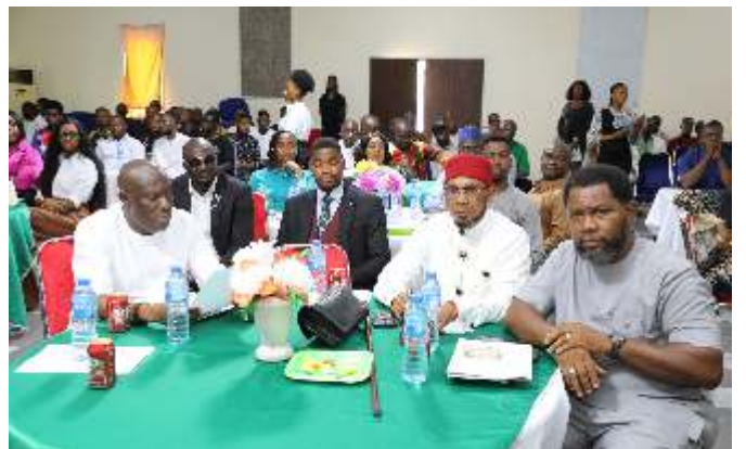
Cross Section of Guests at the HYPREP/Dana Air Job Fare