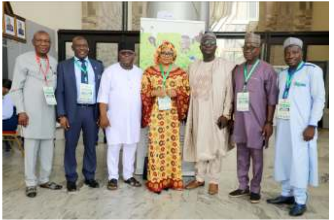
Participants at the 17th National Council on Environment