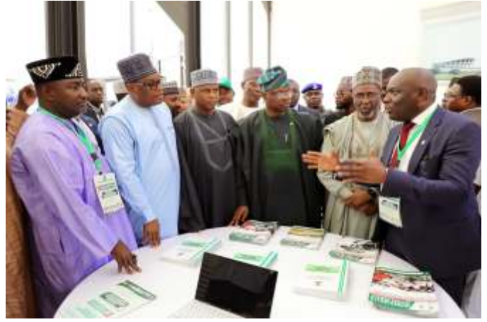
Prof. Zabbey Briefs Honorable Minister, Environment, Balarabe Lawal and other Officials at HYPREP Stand During the 17th National Council on Environment