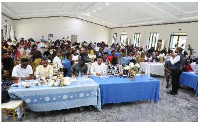
Cross Section of Participants at the HYPREP Employability Workshop