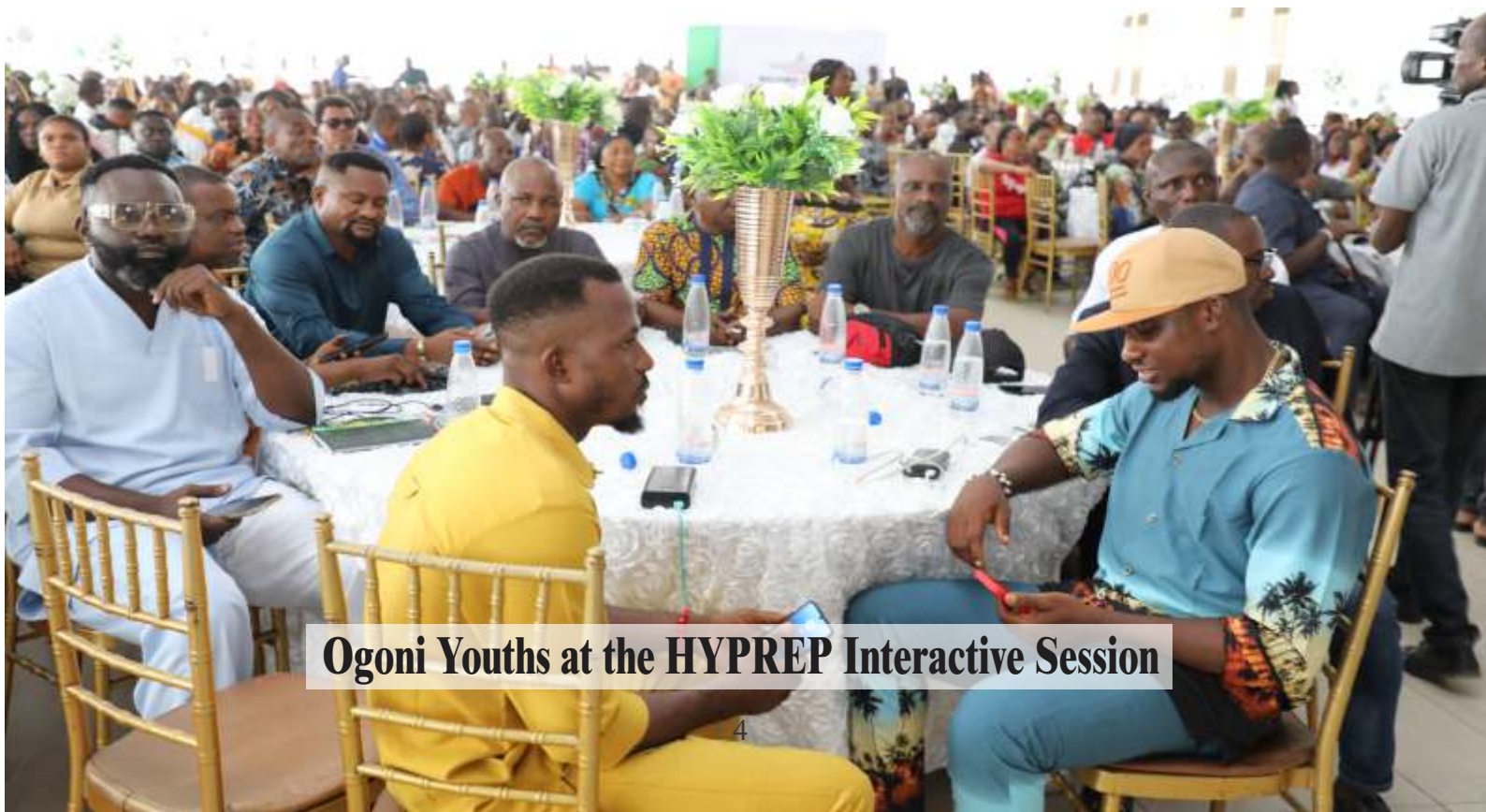
Ogoni Youths at the HYPREP Interactive Session

The Ogoni youths in attendance utilized the interactive session to air their views as well as ask pertinent questions regarding the activities of the project. They demanded to know