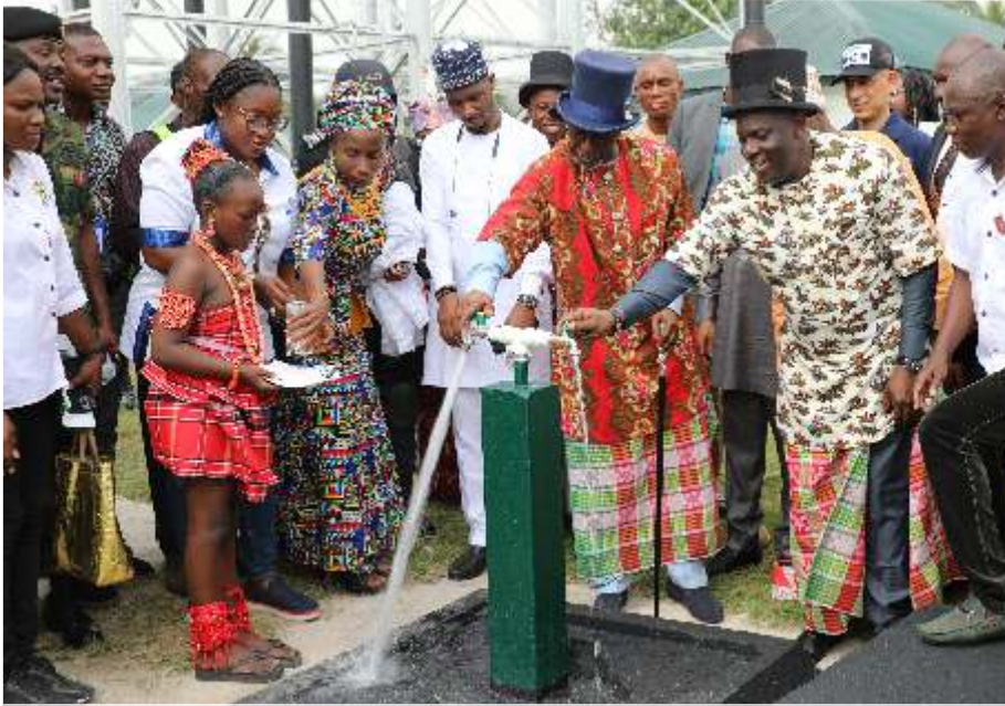
Commissioned Water Project at Terabo, Gokana LGA