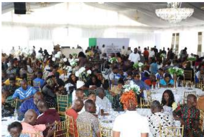
Participants at the Interactive Session