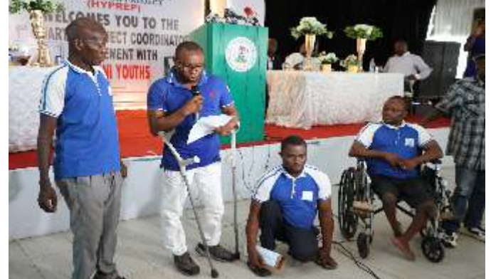
Physically Challenged Persons Making Presentation at the Interactive Session