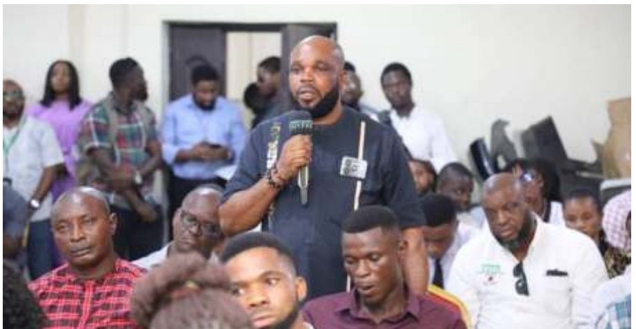
Cross Section of HYPREP Contractors and their Staff at the Safety Meeting