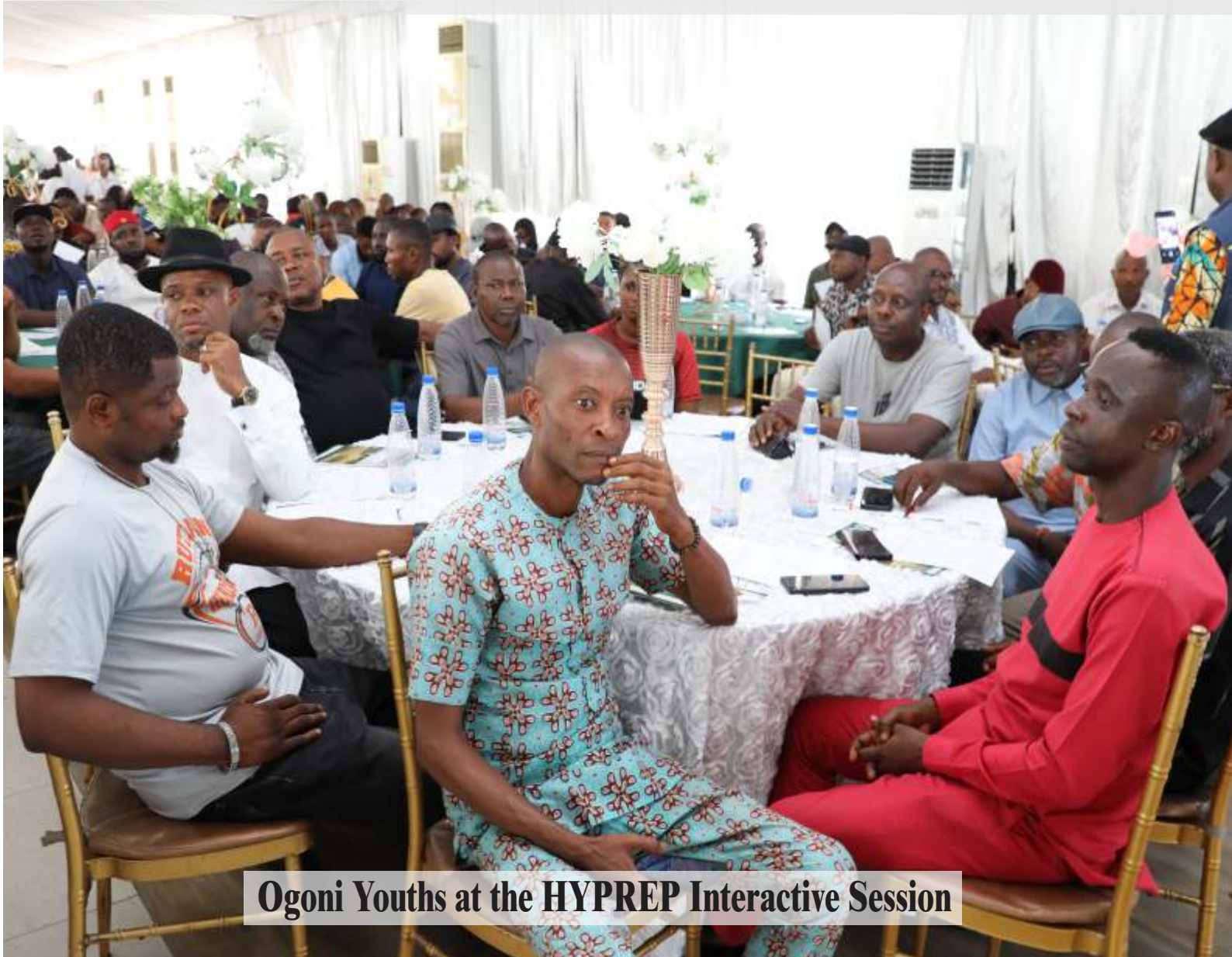
Ogoni Youths at the HYPREP Interactive Session