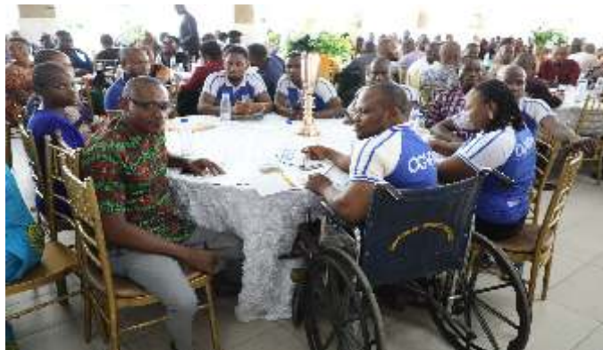
Participants at the Interactive Session