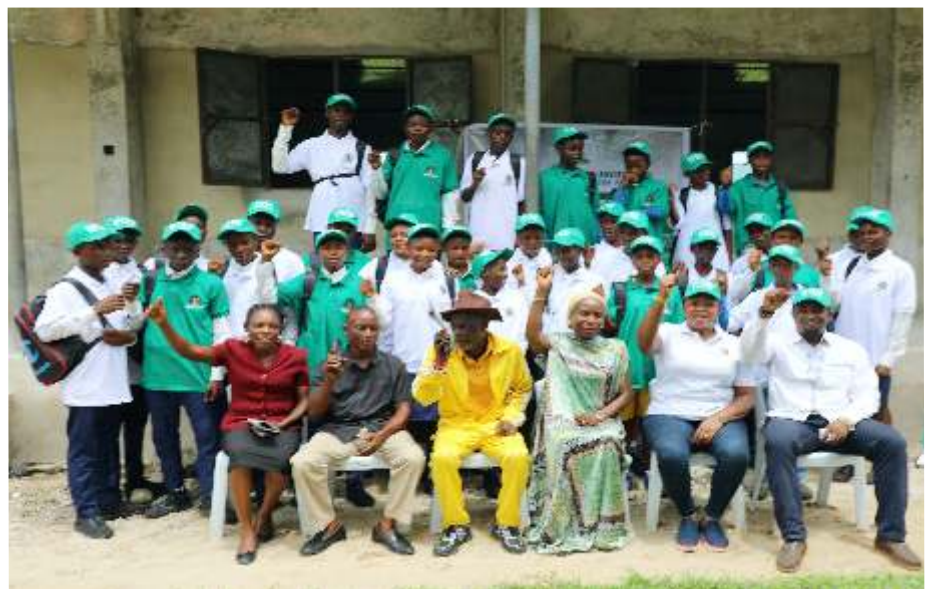
HYPREP Officials with the Principal and Students of CSS Bomu

"You will be having staff from the thematic working areas in HYPREP coming to speak to you on what HYPREP is doing in Ogoniland. A very key project is about to start in your community, we call it shoreline cleanup. If you've been to your waterfronts, you'll notice that some work has already started. We've also