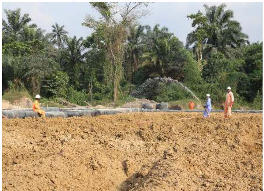
Treatment of Contaminated Soil in Progress

"We are doing public health projects and livelihood projects in line with the objectives of HYPREP. If you look at the gazette that set up HYPREP, the objectives are very clear. The first one is to remediate the contaminated lands and wetlands in Ogoni land including mangrove restoration. The second one is to restore livelihoods of the people and create alternative livelihood opportunities for the Ogoni people. We are responsible for public health study of Ogoniland to strengthen the public health system in Ogoniland. We are also responsible for ensuring security and promoting peacebuilding in the area. Another objective is to