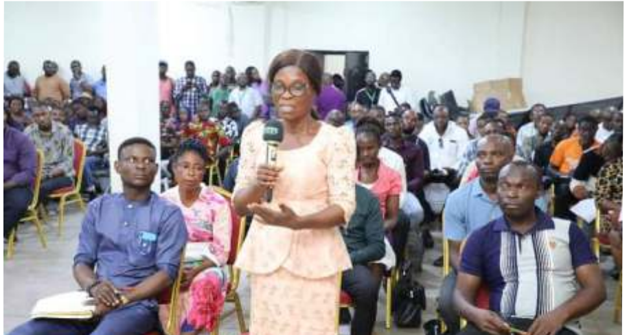
Cross Section of HYPREP Contractors and their Staff at the Safety Meeting