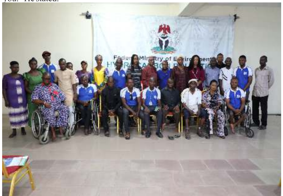
Members of Ogoni Association of Persons Living with Disabilities Celebrate their Day in HYPREP

“The President will attest that we have always interfaced with your group through him. We have been discussing more skill areas in which you would be comfortable in being trained. As the Project Coordinator directed, we would be looking at two to three special skill areas next year that you want to be trained in. In designing livelihood programmes, we tend to take a bottom-to-top approach. HYPREP does not sit in the office to plan programmes for the Ogoni people. We always interface with them and agree on programmes that will be relevant and appropriate to them. We are having this programme today to figure out areas where you want to be trained and also to figure out how you