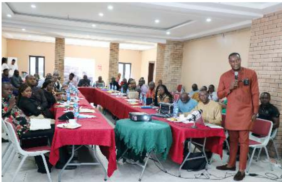
Participants at the Project Review Meeting

“I want to appreciate HYPREP for scheduling this meeting once again and for inviting all of us to partake in it and share our own views on what is going on. I want to first of all apologize on behalf of the Manager, Ogoni Restoration Project, who was also invited to be here. He is not able to make it because of some clashes. He's currently in a meeting with the Country Chair of SPDC and he has asked me to apologize to the meeting and also to share once more that SPDC is very much committed to the HYPREP project, to the Ogoni cleanup and also to remind everyone that we stand firmly to support HYPREP.”