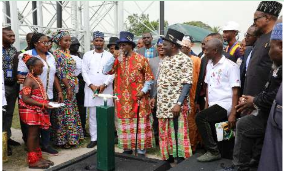
Hon. Minister of Environment, Balarabe Lawal Drinks from the Tap at Terabo Water Station

The Hydrocarbon Pollution Remediation Project (HYPREP) is building a one hundred bed Specialist Hospital in Ogoniland and at the same