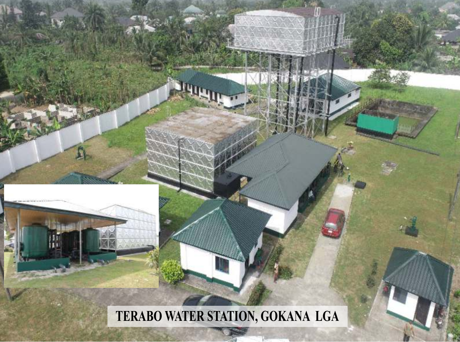
TERABO WATER STATION, GOKANA LGA