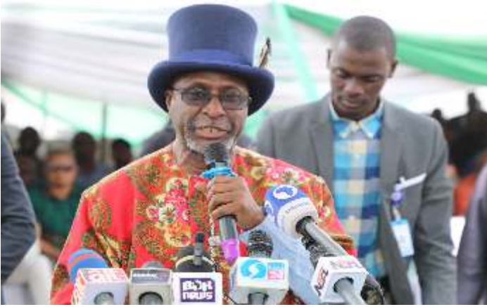
Hon. Minister of Environment, Balarabe Lawal at the Commissioning of Terabo Water Station