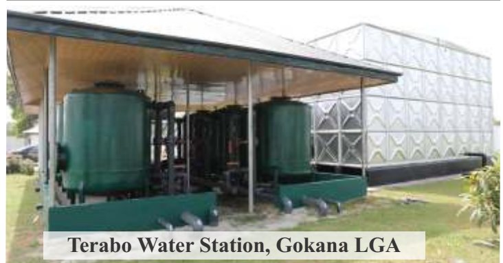
Terabo Water Station, Gokana LGA