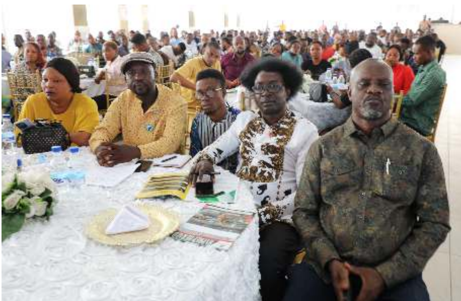
Ogoni Youths at an Interactive Session with HYPREP

“As we speak, we are training 5,000 youths and women in 20 different skill areas and that training is going on well, and the feedback we are getting from the field is very encouraging. We are committed to ensuring that the