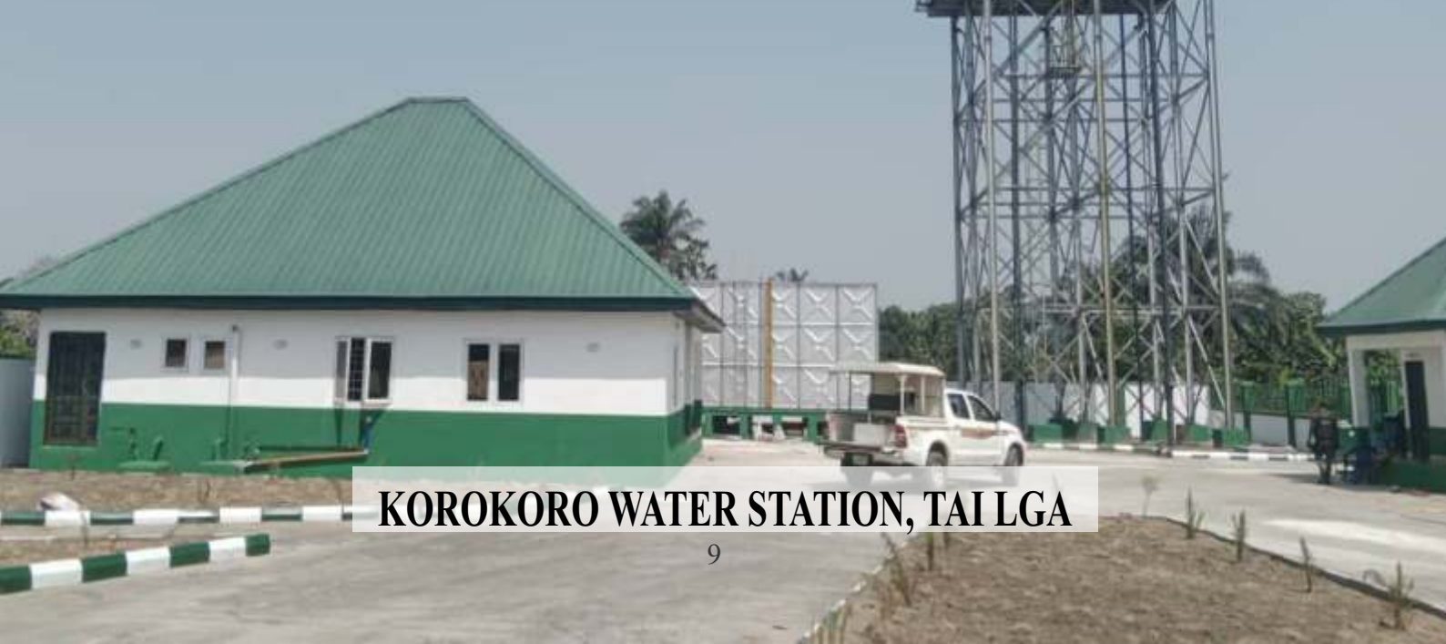
KOROKORO WATER STATION, TAILGA