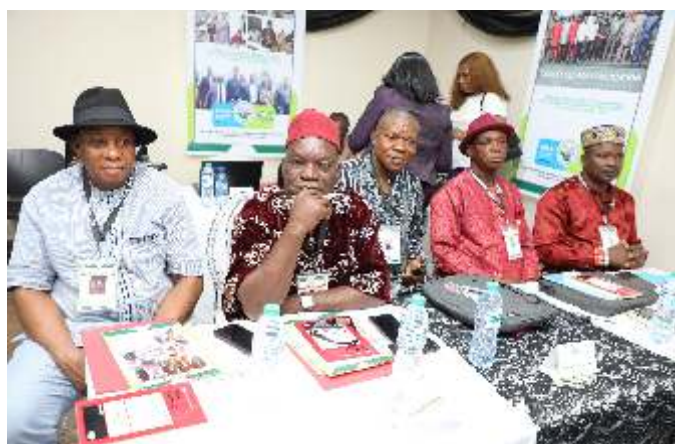
Cross Section of CRAC/ZRC Members