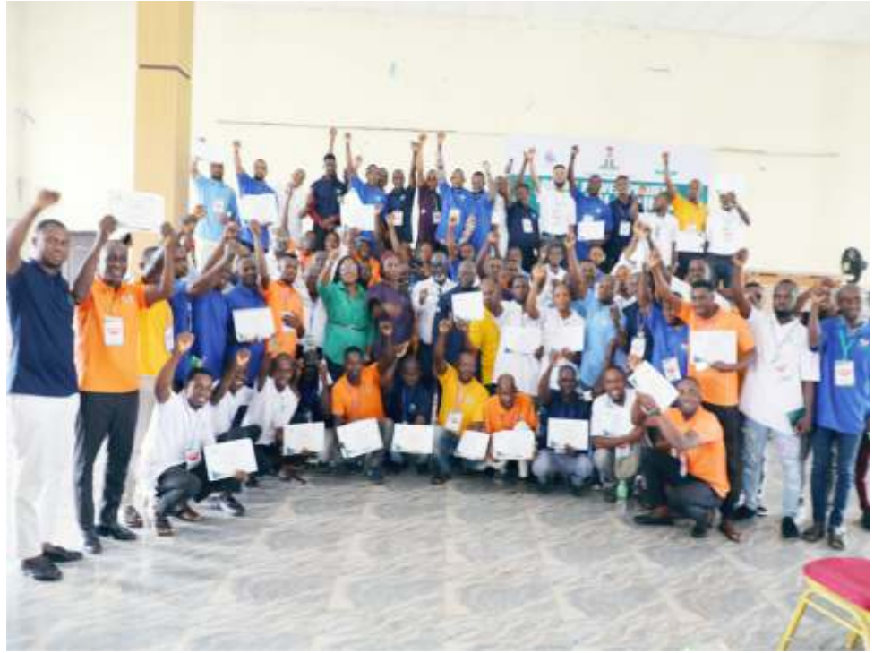
Trained Technicians for the Ogoni Power Project

Former President Muhammadu Buhari had in April 2023 flagged off the construction of the Ogoni Power Project which is to serve as a sustainability pack for the potable Water Schemes that HYPREP is constructing in Ogoniland and the other livelihood programmes of the Project. The Power Project is to also stimulate socio-economic development of Ogoniland. The other two mega projects flagged off on the same day by the former President were the Ogoni Specialist Hospital and the Centre of Excellence for Environmental Restoration – a recommendation of the United Nations Environment Programme (UNEP) in its 2011 report on the environmental assessment of Ogoniland.