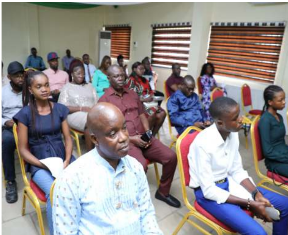
Contractors at the kickoff Meeting

“This is a very important part of the HYPREP project in Ogoniland to improve livelihood for the youths so that we can reduce criminality and reduce issues and problems in society. This is a good start, and it is going to continue and if we can look at how we started in 2017, there have been increasing number of youths that are being trained in our