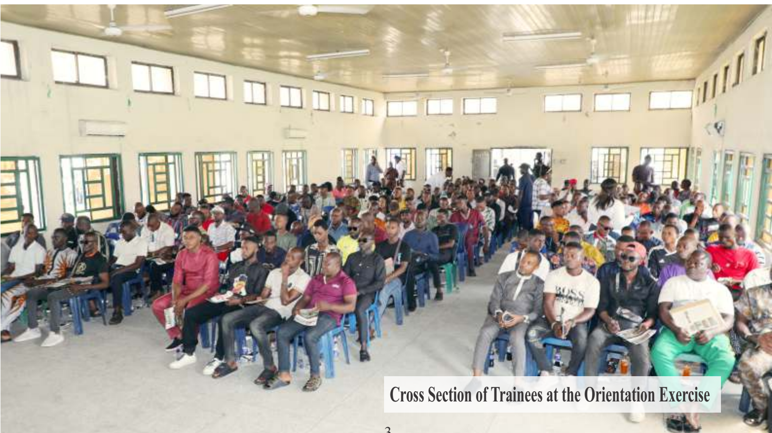
Cross Section of Trainees at the Orientation Exercise

“However, there are other programmes going on concurrently in Ogoni. We are building the Center of Excellence, we are building the Ogoni Specialist Hospital, we are also building the Buan Cottage Hospital. There are also other projects on remediation going on. We have the remediation, and shoreline cleanup, these are projects that engage youths and women in Ogoniland. So, everybody will not do the same thing at the same time. The essence of training you in different skill sets is to empower you to become