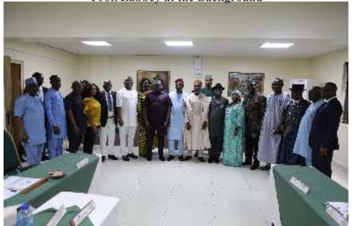
Members of GC/BOT of HYPREP