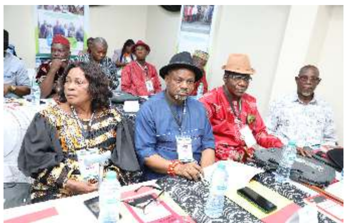
Cross Section of CRAC/ZRC Members