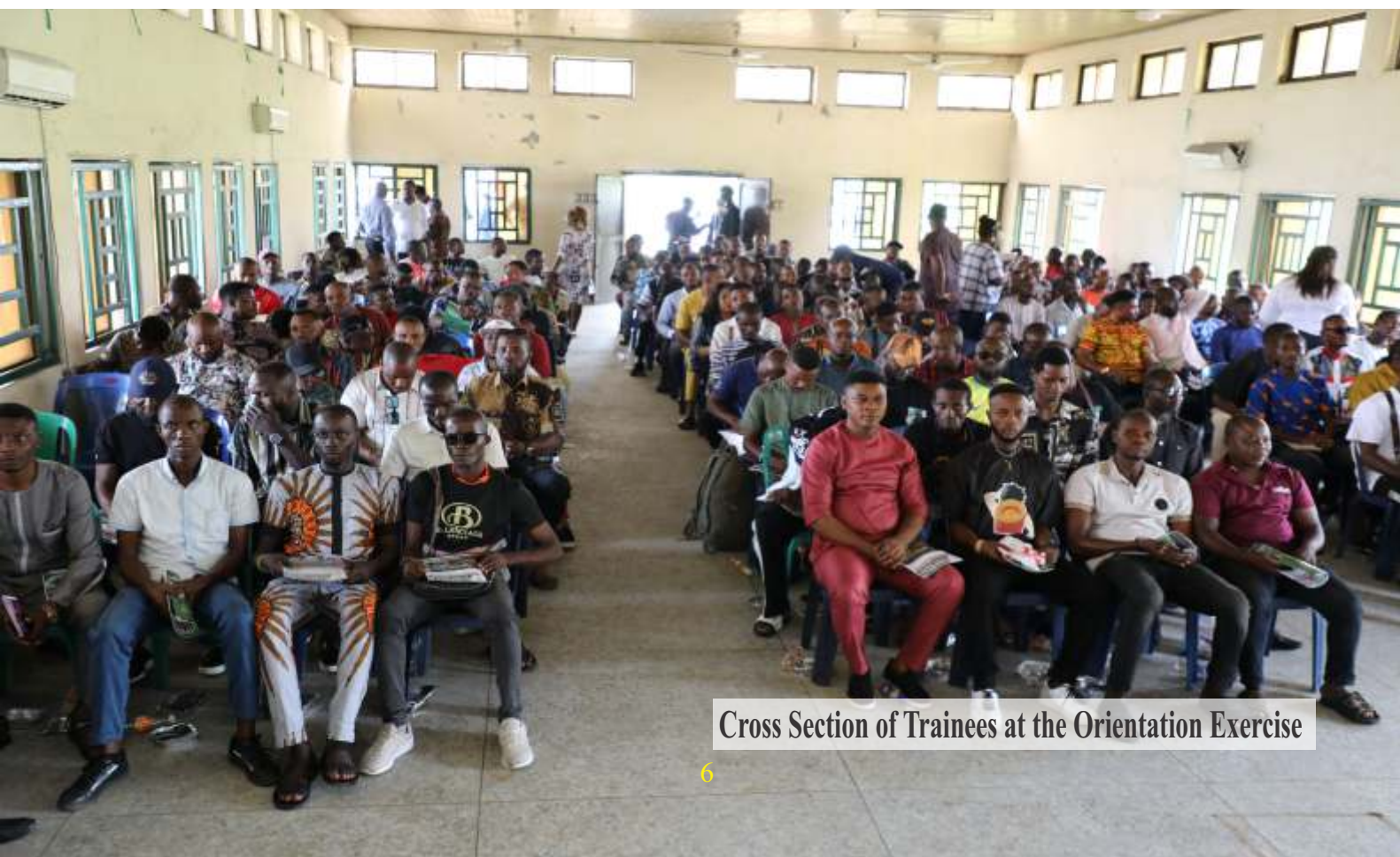
Cross Section of Trainees at the Orientation Exercise

Some areas of interest indicated by the beneficiaries are, Data Analytics, Crane Operations/Loader, Website Designing and Development, Digital Marketing and Mobile App Development, Argon Welding/Metal Fabrication, etc. The training for the five thousand Ogoni people is besides the four hundred youths being screened for training in the four skill areas of seafaring, mechatronics, aviation, and creative arts.