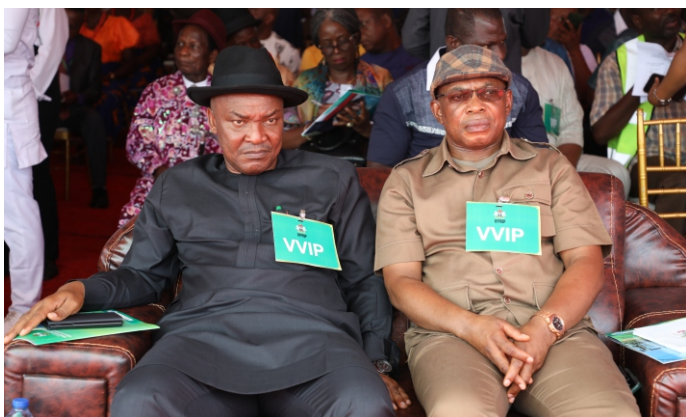
Cross Section of Dignitaries during the Groundbreaking Ceremony at Wiiyaakara