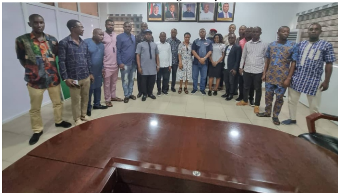
Members of NYCOP During their Visit to the Project Coordination Office