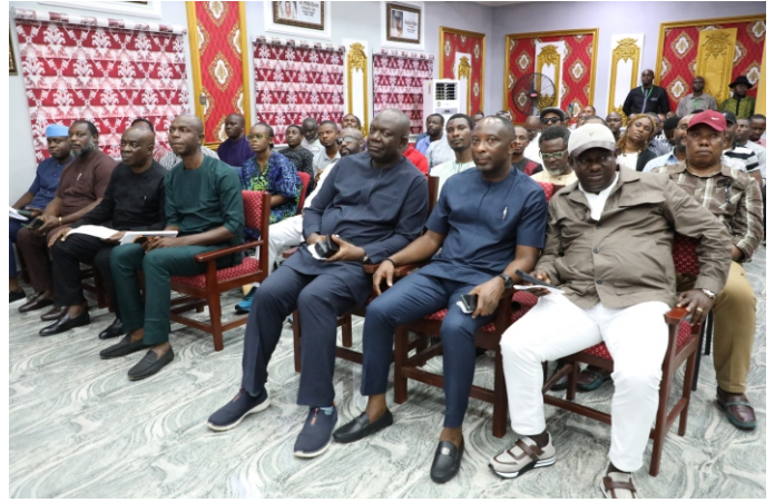
Cross Section of Contractors during the Handover of Remediation Sites