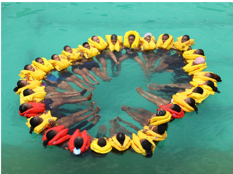
HYPREP Sponsored Cabin Crew Trainees during their Ditching Drill

The first batch of fifteen Ogoni youths left Port Harcourt on 12 th March 2023 for the Crew Training Institute, Lagos to be trained as air cabin crew members and the second batch will follow upon the completion of their training. A hundred Ogoni youths have been penciled down by HYPREP for training in aviation. The other mega skill areas are mechatronics, seafaring, and creative arts which the screening of applicants have been concluded awaiting commencement of training. A hundred Ogoni people also are to be trained in each skill area.