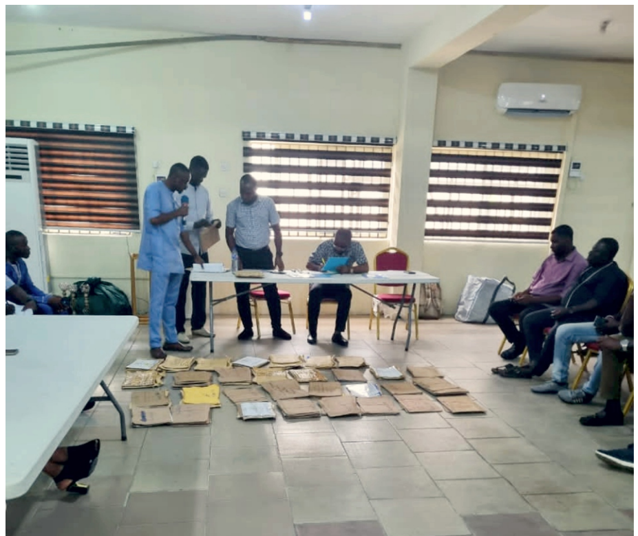
Officials of HYPREP Procurement Unit During the Financial Bid Opening for Remediation of Undocumented Sites

Shoreline remediation is carried out in an inter-tidal area characterized by high and low tides which will require the use of special technology and personal protective equipment (PPEs) and involves the removal of oily-soaked debris and stumps, raking of alga mats, flushing of sediments, recovery of waste crude to a treatment center, and most importantly the re-vegetation of mangrove after the clean-up and it is a process that requires a lot of labour.