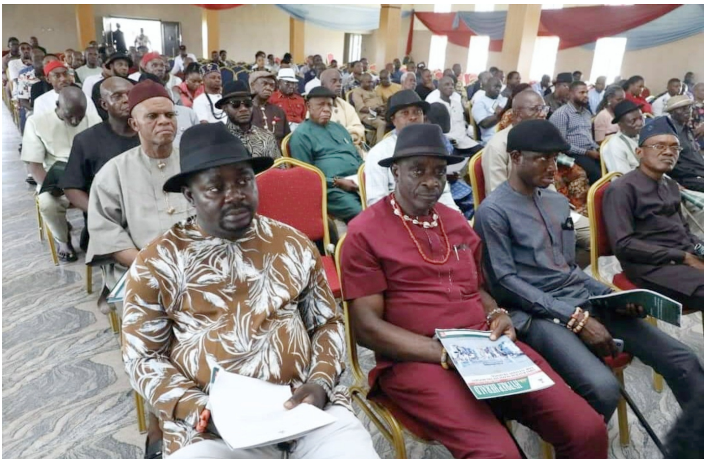
Cross Section of Participants during HYPREP Stakeholders Meeting Held at Saakpenwa

Other participants at the meeting were representatives of the Nigerian Upstream Petroleum Regulatory Commission (NUPRC), Shell Petroleum Development Company (SPDC), the Federal Ministry of Environment, Rivers State Ministry of Environment, Social Democracy Network, Society for Women and Youth Affairs (SWAYA), among others.