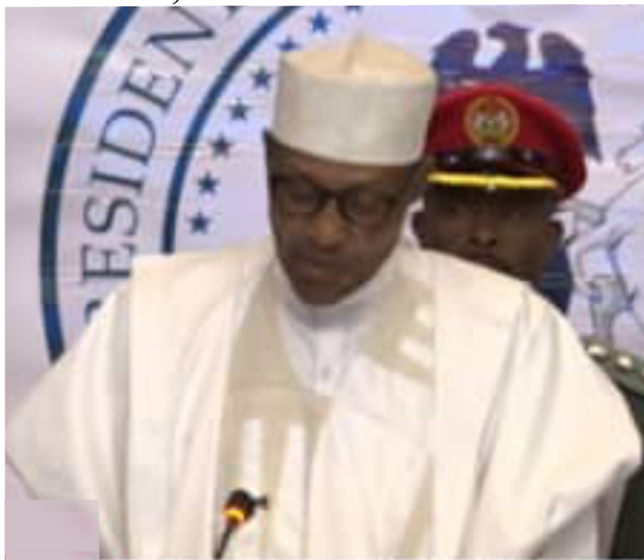
President Muhammadu Buhari

He expressed the confidence that the Power Project would boost electricity supply that will catalyze the socio-