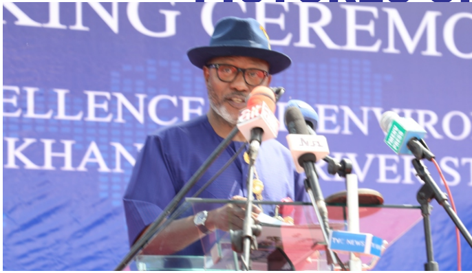
Hon. Minister of Environment Barr. Mohammed Abdullahi during the Groundbreaking Ceremony at Wiiyaakara