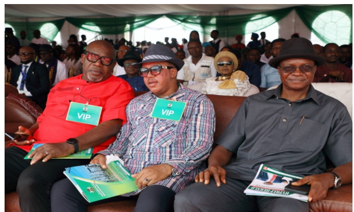
Cross Section of Dignitaries during the Groundbreaking Ceremony at Wiiyaakara