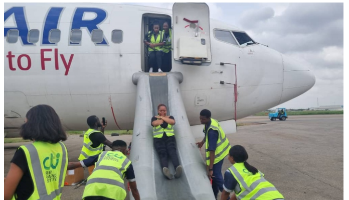
HYPREP Sponsored Crew Trainees During one of their Emergency Drills