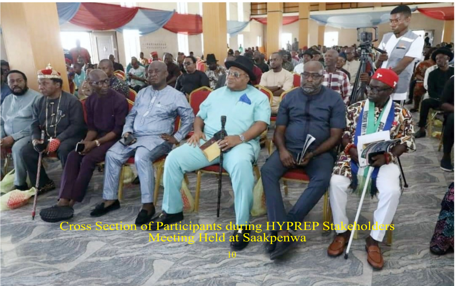
Cross Section of Participants during HYPREP Stakeholders Meeting Held at Saakpenwa

“The task at hand is centred about the restoration of oil impacted sites in Ogoni land and that the state of the environment in Ogoniland as in other