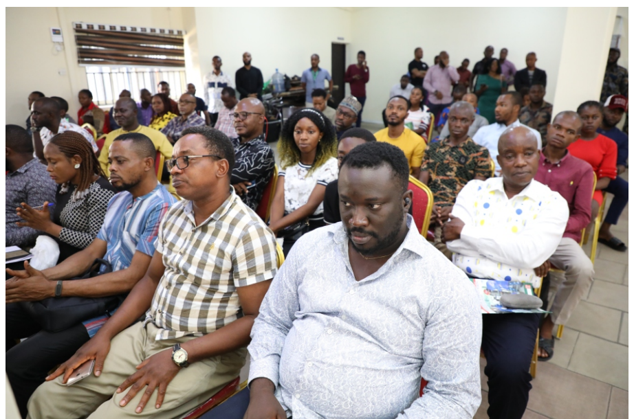
A Cross Section of Contractors in a Meeting with HYPREP

“The PC himself suggested that we should put together a WhatsApp group so that all Managing Directors are there and even suggested that about three or four of their principal staff and themselves should be members and we have already done that.” He said.