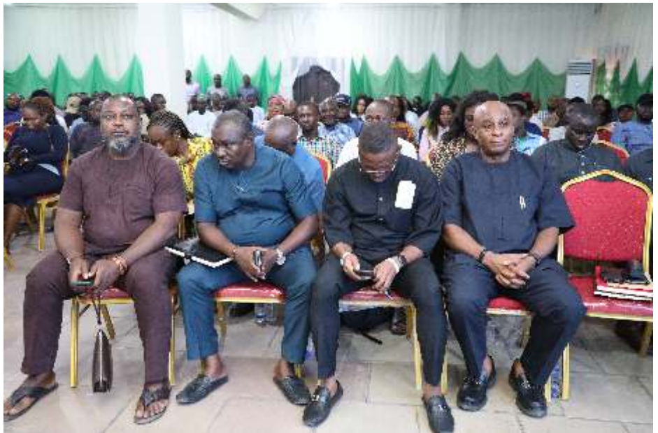
Cross Section of Contractors During the Kickoff Meeting

Having awarded contracts to the successful companies that bided for the work, the Project Coordination Office had organized a kick-off meeting with top Management of the thirty-nine (39) companies that won the contracts to brief them on the scope of work to be done and the