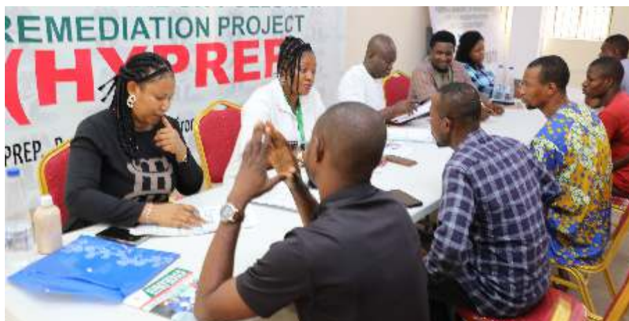
Officials of Livelihood Unit Capturing Data of Beneficiaries

The data capture for beneficiaries from Gokana Local Government Area who were the last to be attended to drew youths from the different villages that make up the area.