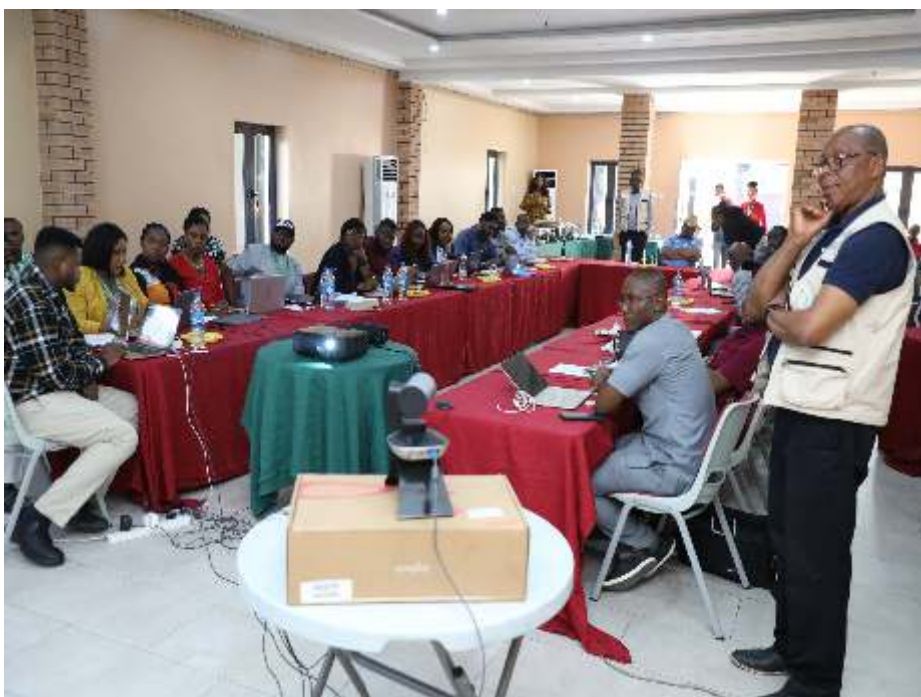
UNEP Training of HYPREP Staff in Session