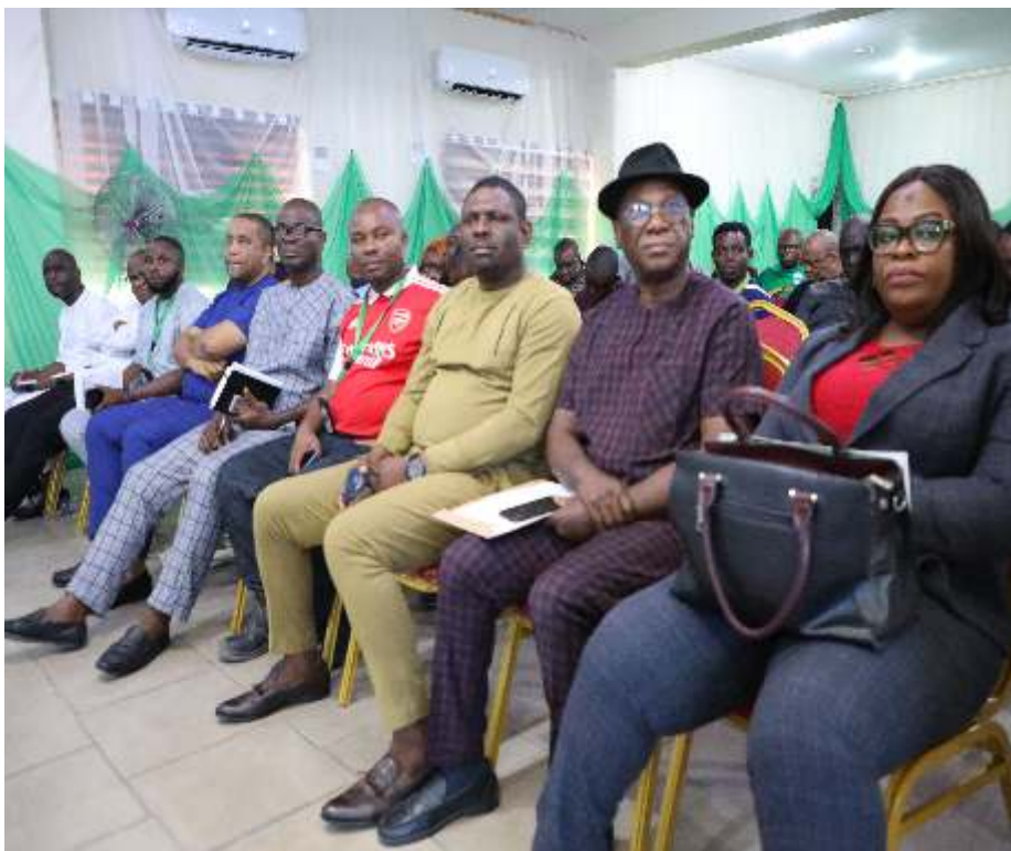
Cross Section of Participants During the Kickoff Meeting

He announced that sensitization of the communities and training of community workers will begin in the