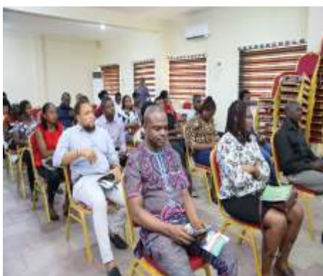
Cross Section of Contractors at the Bid Opening

He assured that in selecting laboratories for the job, care would be taken to consider technically competent contractors. "We are going to be fair to everybody because we