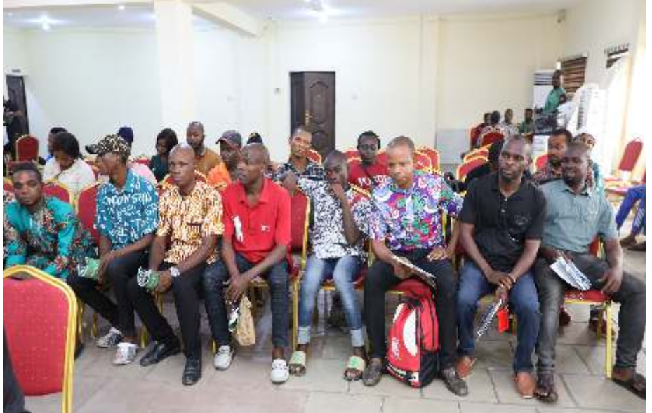
Cross Section of Beneficiaries of HYPREP Livelihood Programme During their Data Capture Exercise

Ogoniland will now be organized under their skill areas and sent to their respective training institutes and upon completion of their programmes be empowered with starter packs to practise their trades.