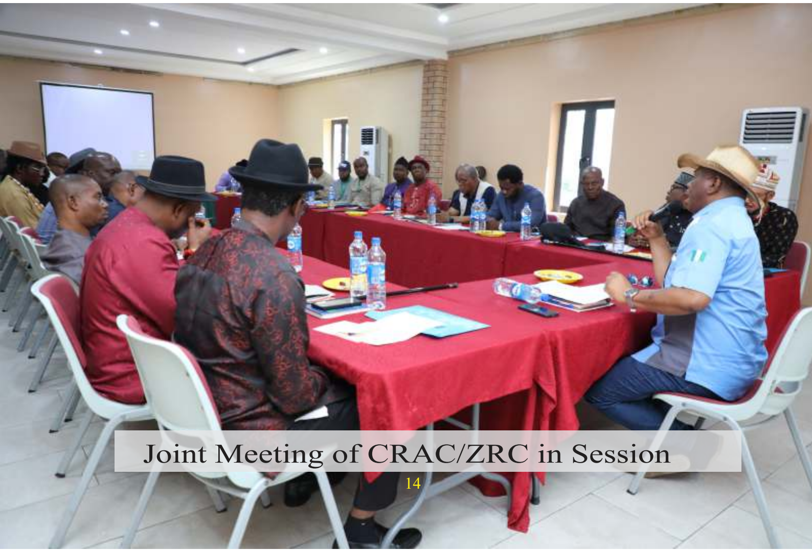
Joint Meeting of CRAC/ZRC in Session

(g) convene sub-committees as may be required and approved by the PCO.