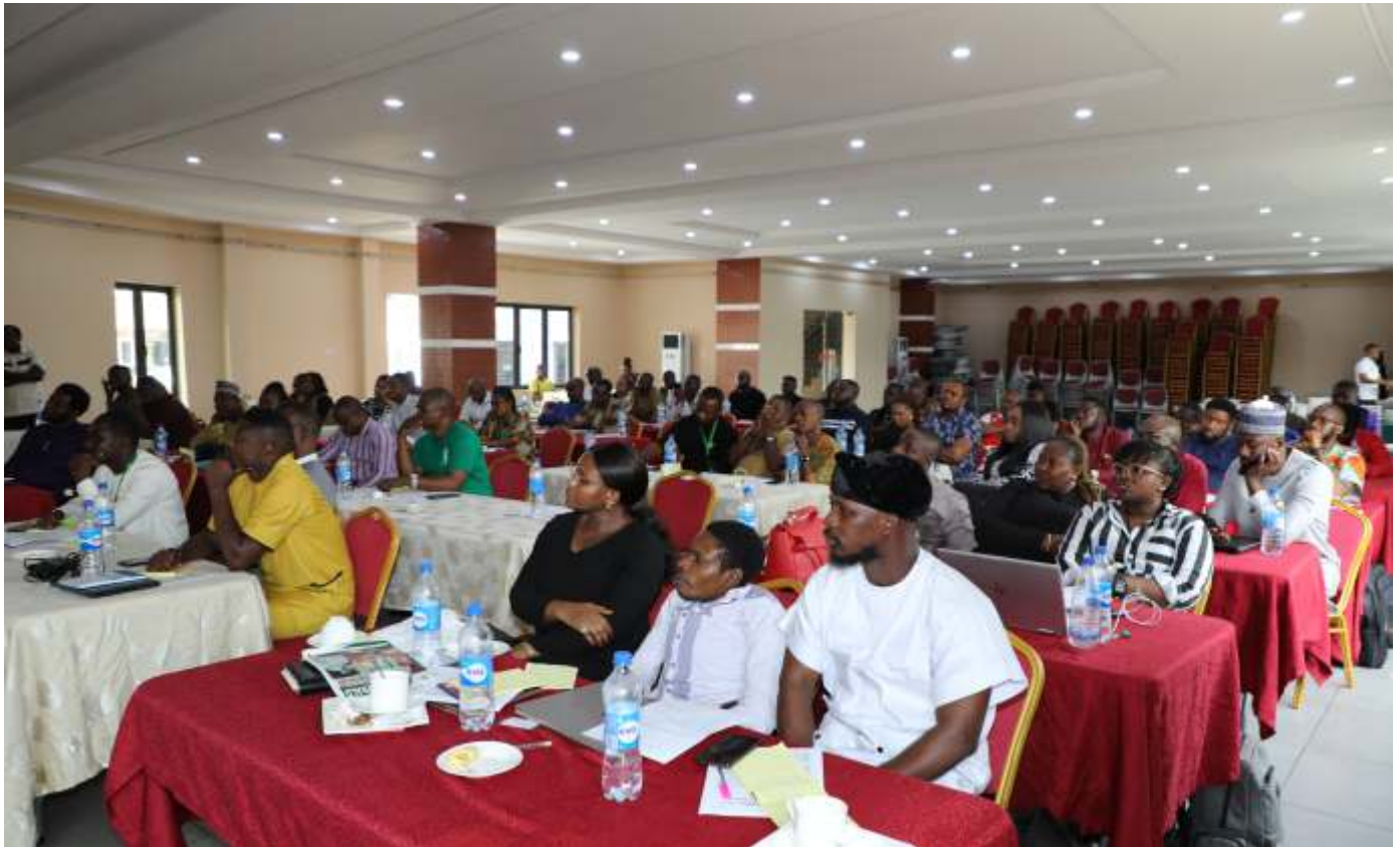
Cross Section of Participants at the Workshop for Site Supervisors