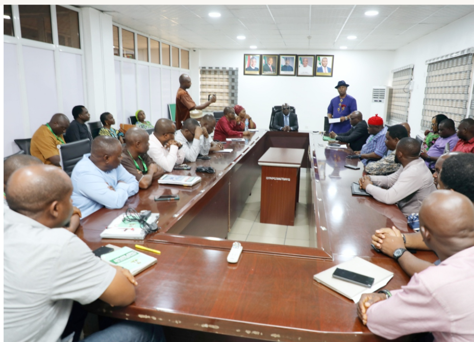
The Handover Ceremony