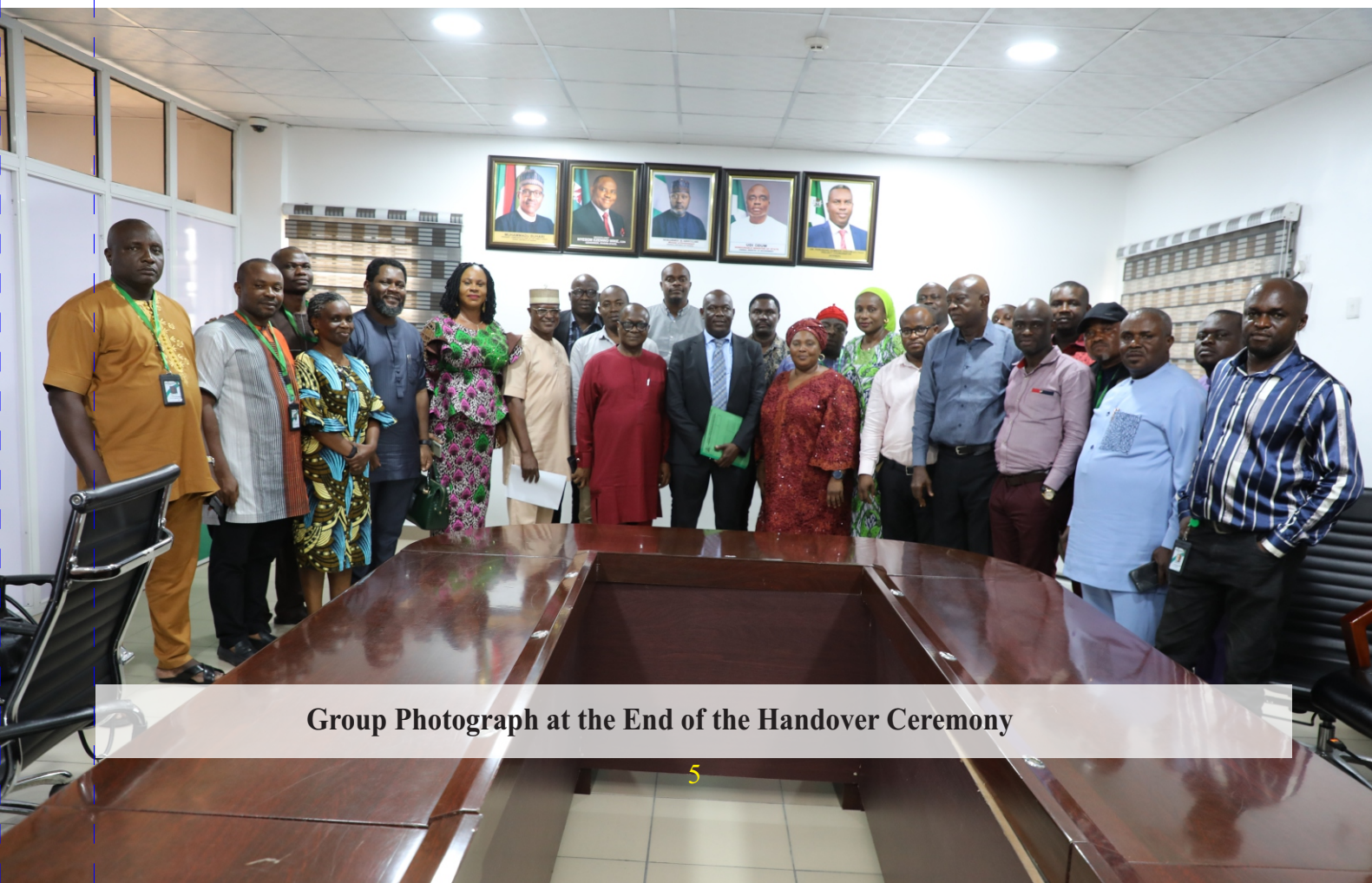
Group Photograph at the End of the Handover Ceremony