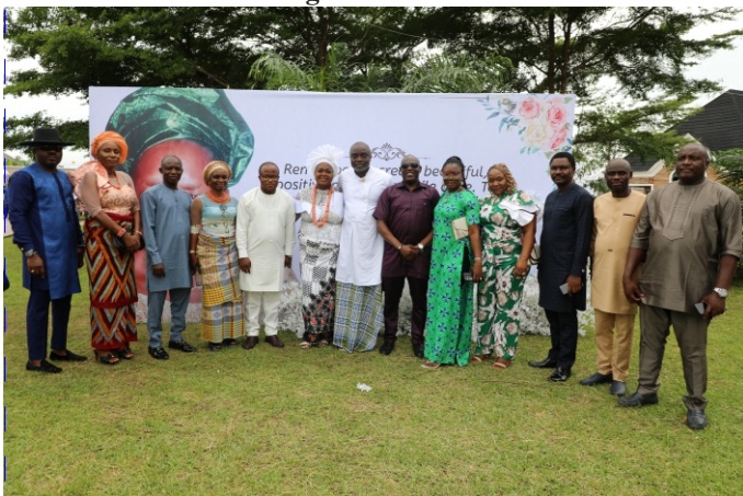
HYPREP Management Staff, Others Pose With Outgone Minister of State, Environment, Hon. Udi Odum During His Mother's Burial