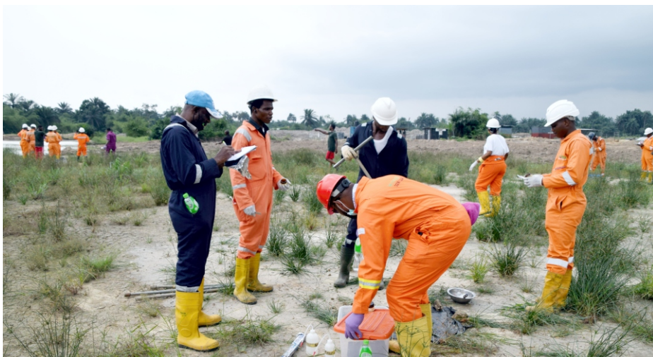
HYPREP Staff on Assessment

adjoining communities now have access to potable water supply. The other five contracts are at different stages of completion with some having done test run of the system in preparation for supply of water to residents.