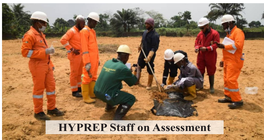
HYPREP Staff on Assessment

(16) The minutes of each meeting shall be approved by the HYPREP Governing Board of Trustees at the next meeting and copies thereof shall be furnished to all members of the HYPREP Governing Council.