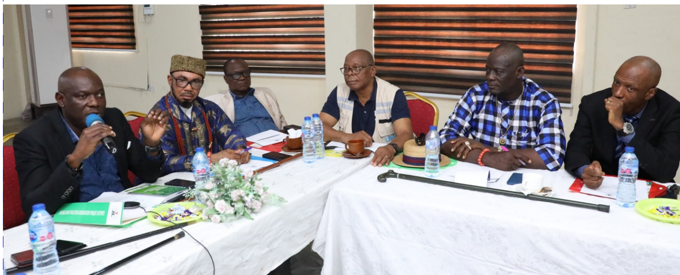
HYPREP Staff on Assessment

Present at the meeting were representatives of the United Nations Environment Programme (UNEP), the Shell Petroleum Development Company (SPDC), the Rivers State Government and Management Staff of HYPREP.