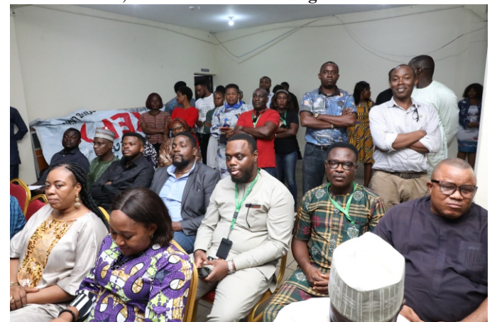
Cross Section of HYPREP Staff During Maiden Meeting With New Project Coordinator