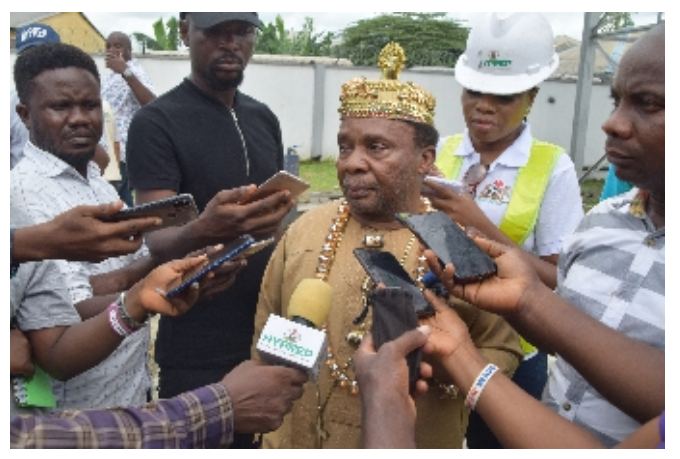
Paramount Ruler of Alesa, HRH J.D. Nkpe addressing the Press at Alesa Water Station.