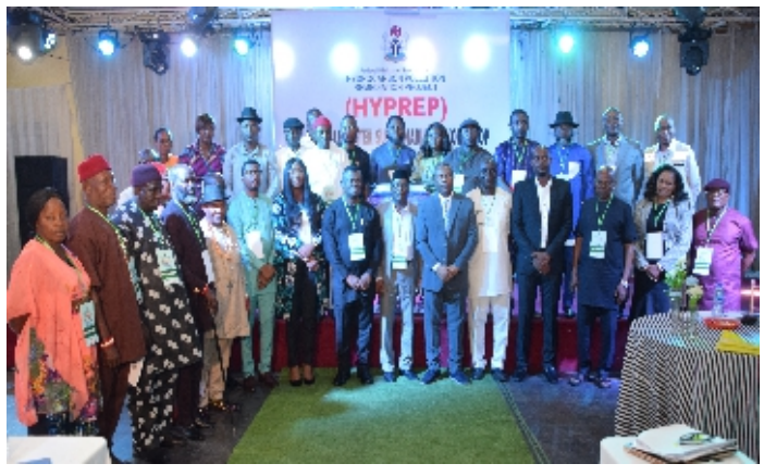
Water Strategy Framework Drafting Committee

At the end of the session for Tuesday 17<sup>th</sup> May 2022, a schedule of the field visits for Wednesday 18<sup>th</sup> May, 2022 was reeled out to participants. The participants from the host communities were asked to gather at the indicated HYPREP Water Project Sites in their respective Local Government Area to receive the workshop resource persons and dignitaries.