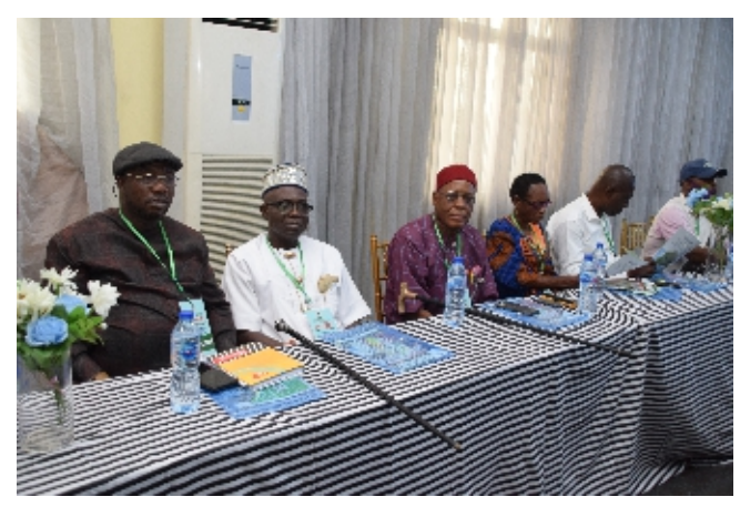
Cross Section of Community Leaders at the Potable Water Sustainability Workshop