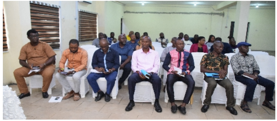
Cross Section of Remediation and Water Contractors at the Project Review Meeting

around project sites so that work can be done speedily and without hiccups as some contractors alleged that the security peculiarities of some areas affected the pace of work in those areas.