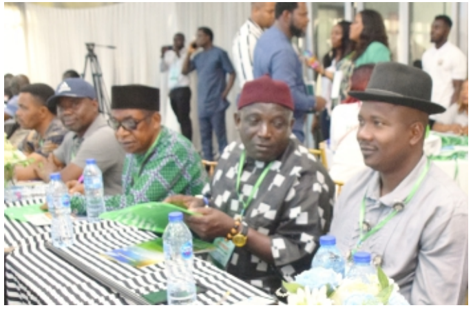
From Right 1. HRH Magnus Adumene 2. HRH Fabian Gberesuu 3. Chief Dominic Tegbo