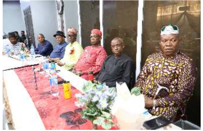
ZRC Members at the End of Year Party Organised for them by the PCO