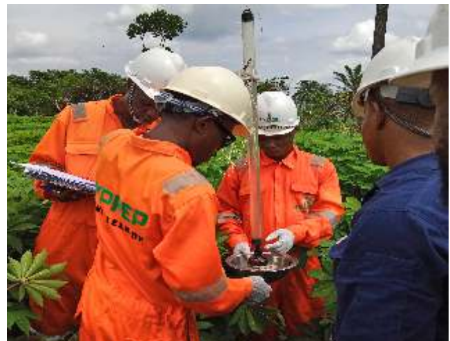
HYPREP Operation Staff Collecting Water Samples