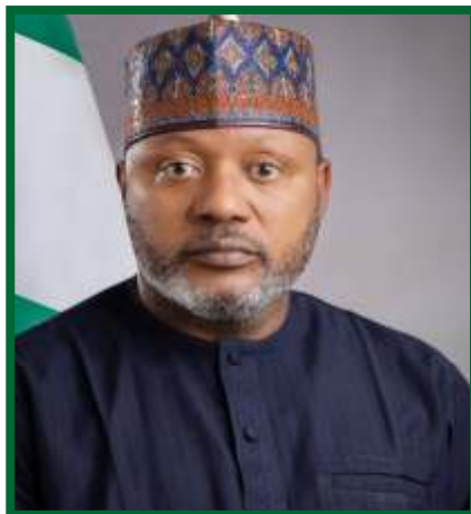
BARR. MOHAMMED H. ABDULLAHI MINISTER OF ENVIRONMENT

The contract for the remediation of medium risk sites is coming on the heels of the completion of the clean-up