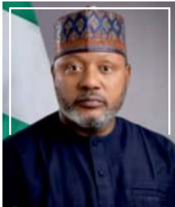
MOHAMMED H. ABDULLAHI Hon Minister of Environment

This laudable gesture, conceived at a time when Ogoni is in dire need of economic recovery, will in no small measure create new frontiers for rapid economic growth. The power project which is consistent with the dreams of Ogoni people, when completed, will ultimately promote peace in Ogoniland, enhance economic development through skilled and unskilled entrepreneurship, industrial growth and overall prosperity of Ogoniland. Undoubtedly, this project will provide sustainability to the water scheme and help facilitate the restoration of the Ogoni environment. Employment and empowerment opportunities will come along for a substantial number of our youths who will become productive and self reliant.