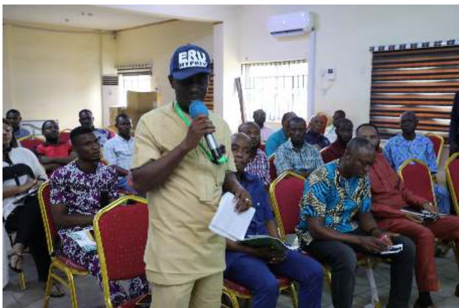
Cross Section of Contractors at the House Keeping Meeting