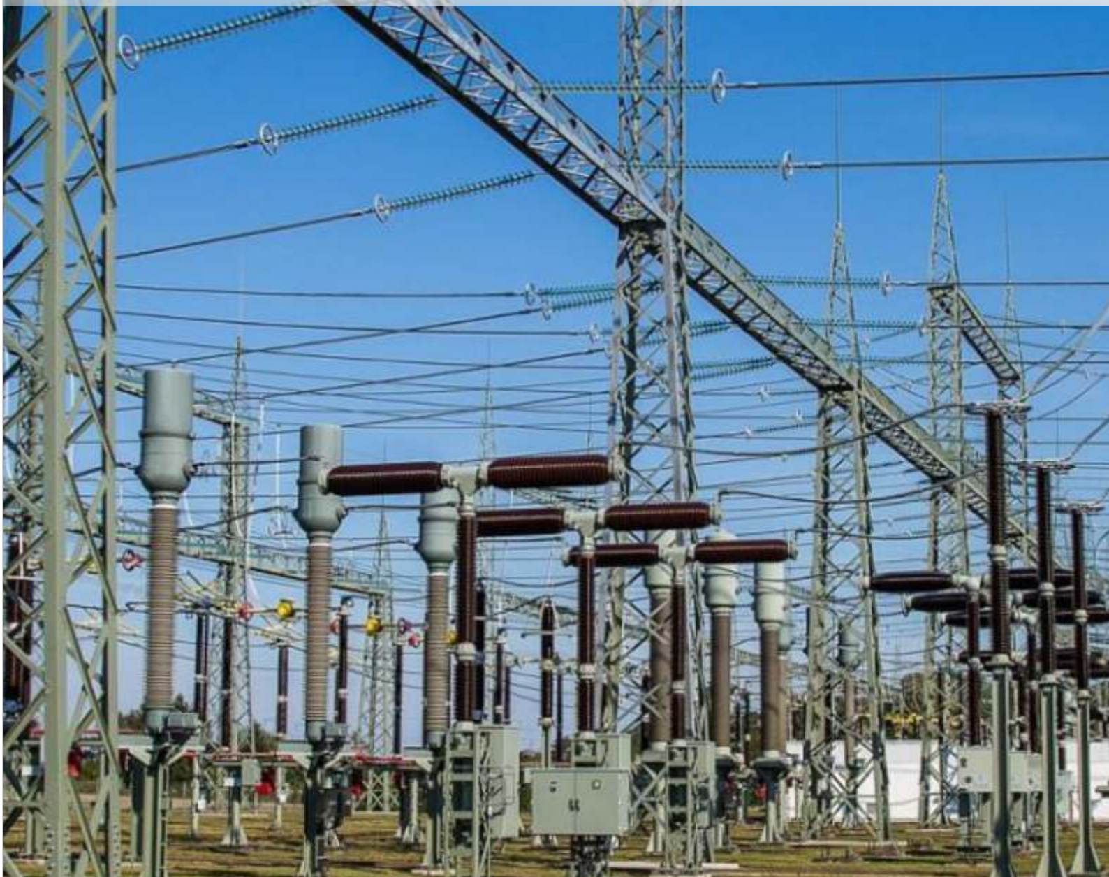
A TYPICAL POWER SUB STATION

HYPREP OPENS FINANCIAL BID FOR CONSTRUCTION OF CENTRE OF EXCELLENCE