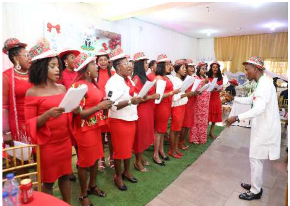
HYPREP Choir at Christmas Carol/End of Year Party

“2023 is yet another year. What I want to tell us here is that 2023 will offer us another opportunity to achieve much more than we did in 2022 and the indices are already here. We laboured, we toiled for the past six, seven months to bring to birth projects that will better the lives of Ogoni people for which HYPREP was set up. It has not been an easy journey. Within the past