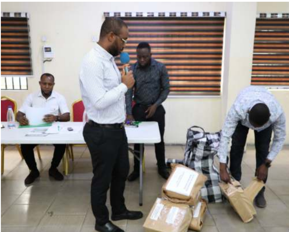
Procurement Staff Sorting Documents during the Bid Opening for Centre of Excellence