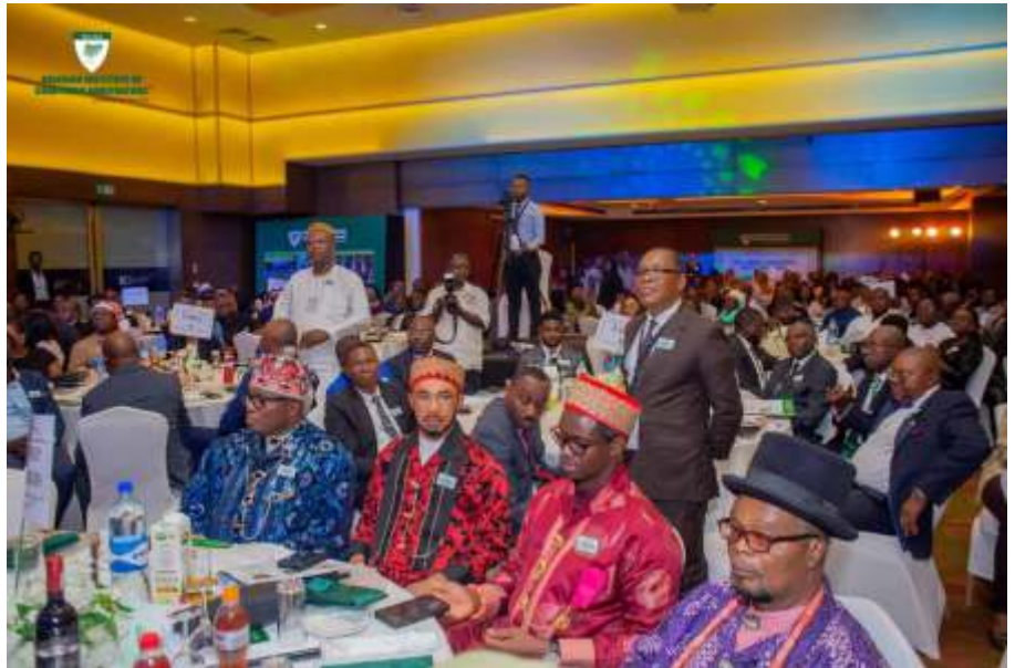
Cross Section of Participants at the Nigerian Institute of Chartered Arbitrators Induction Ceremony

The inductees were dully issued their certificates and scrolls. The 2022 Annual Investiture Ceremony had as its theme, 'The future of Arbitration/ADR in Africa: Development and Sustainability.'