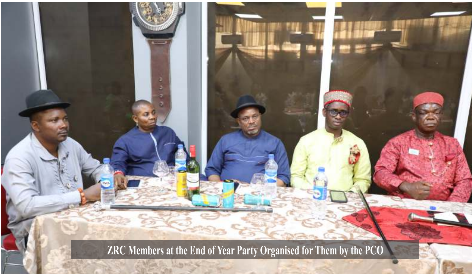
ZRC Members at the End of Year Party Organised for Them by the PCO

Ogoni technicians and electrical engineers would be engaged to work on the project. “Imagine the number of technicians that will have instant jobs from installation and maintenance of electrical fittings that the Power Project will provide,” he enthused.