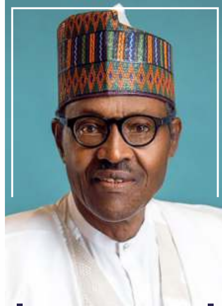
His Excellency MUHAMMADU BUHARI GCFR PRESIDENT, COMMANDER-IN-CHIEF OF THE ARMED FORCES FEDERAL REPUBLIC OF NIGERIA

8 TTC Road, Bori, Ogoniland, Rivers State, Nigeria Tel: +234 806 467 9999, 0803 660 2161; E: ogccima@gmail.com