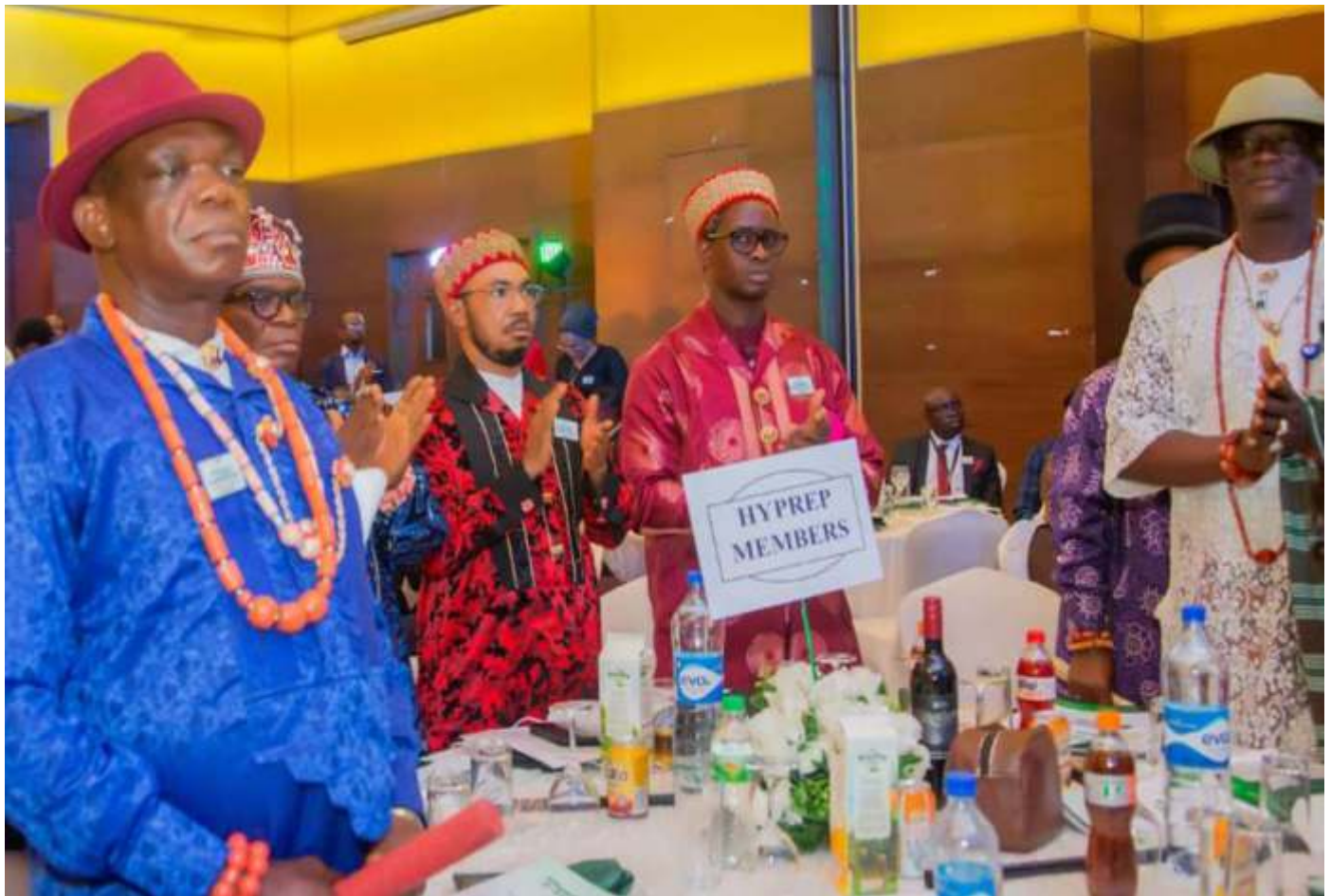
CRAC/ZRC Members at the Nigerian Institute of Chartered Arbitrators Induction Ceremony