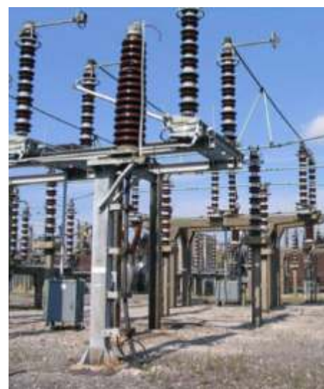
Power Sub Station

Execution of both projects will start early 2023 in keeping with President Muhammadu Buhari's commitment to the clean-up of Ogoniland.