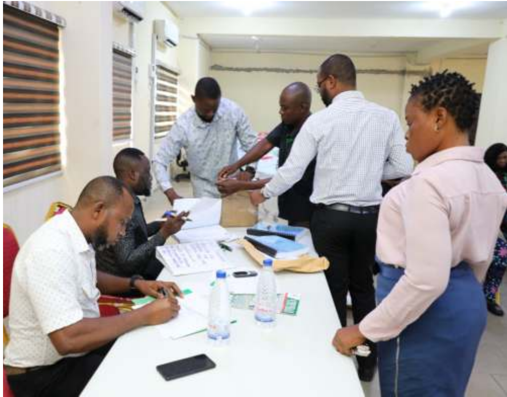
Procurement Staff Sorting Documents during the Bid Opening for Centre of Excellence

The exercise was monitored by three Non-Governmental Organizations, namely, Salvage Africa Initiative; Media Awareness and Justice Initiative; and Cornerstone Liberty and Love Foundation.