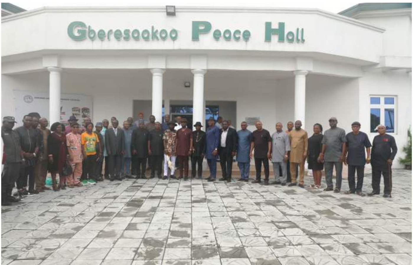
Reps of NASS, SPDC, HYPREP, Bomu, Kpor in Group Photograph at the End of Peace Meeting Held at Gokana Council

The leadership of both communities thanked the National Assembly members, representatives of SPDC and officials of HYPREP for their time and resources invested in making the dialogue a fruitful one and assured of their support and cooperation to making the clean-up of their lands a success.