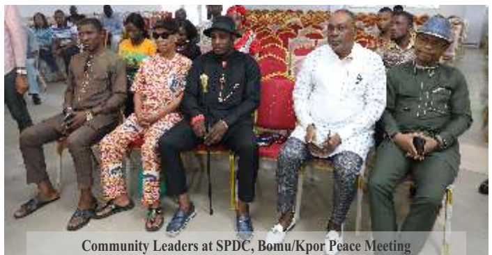
Community Leaders at SPDC, Bomu/Kpor Peace Meeting