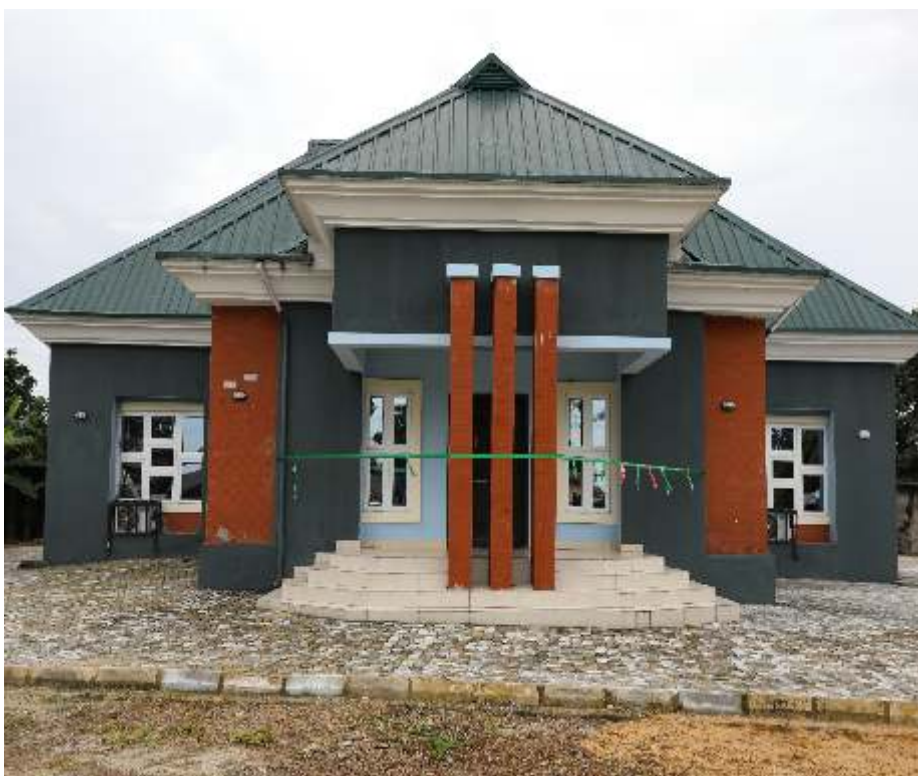
HYPREP Area Office

The event, which recorded massive turnout, was held separately at the HYPREP Area Offices in Eleme and Tai Local Government Areas. The Khana Area Office was earlier commissioned in 2021 and work on the Gokana Area Office is at advanced stage of completion.