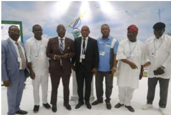
Top Officials of Nigerian Delegation to COP 27, Egypt