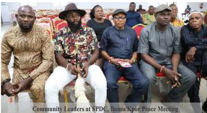
Community Leaders at SPDC, Bomu/Kpor Peace Meeting