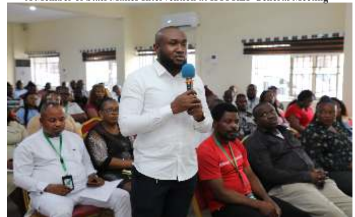
A Member of Staff Makes Intervention at HYPREP General Meeting