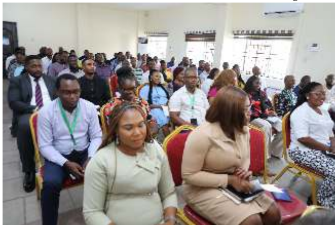
Cross Section of Staff at HYPREP General Meeting