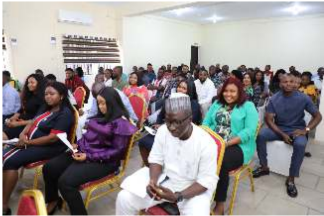
Cross Section of Staff at HYPREP General Meeting