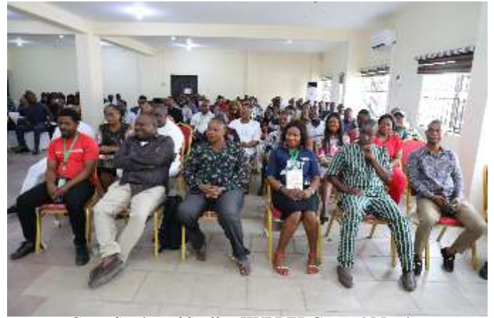
Cross Section of Staff at HYPREP General Meeting