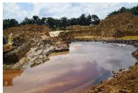
Remediation in Progress

(l) Develop and execute a communications plan in collaboration with all stakeholders.