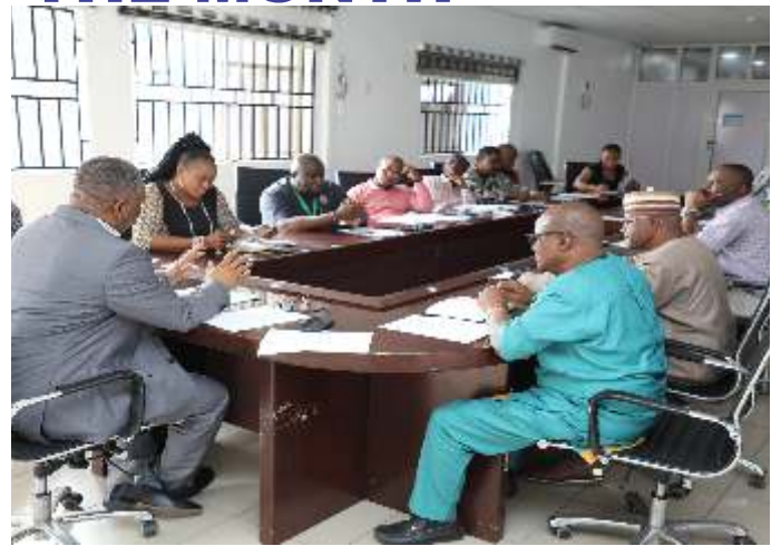
HYPREP Management Meeting in Session