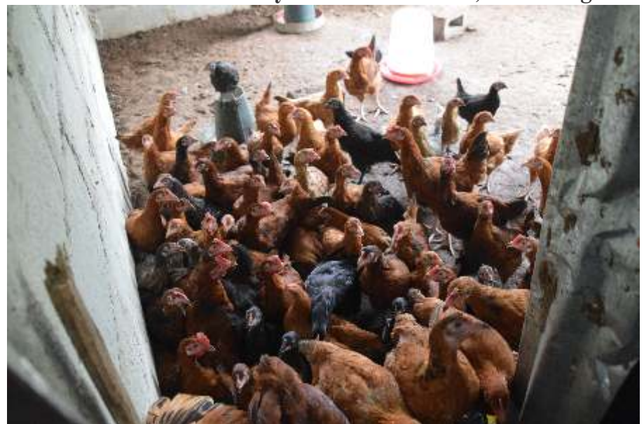
Poultry Farm run by Beneficiaries of HYPREP Livelihood Training