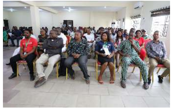
Cross Section of Staff at HYPREP General Meeting