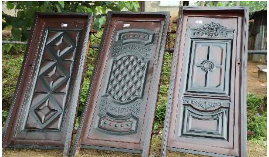
Iron Doors Fabricated by HYPREP Trainee, Baride Ngeri