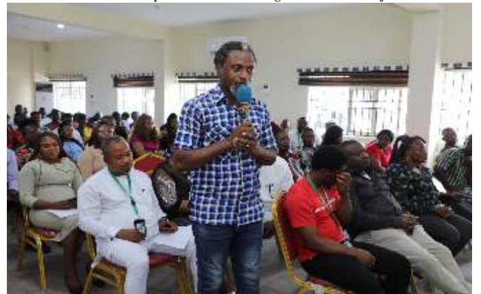
A Member of Staff Makes Intervention at HYPREP General Meeting