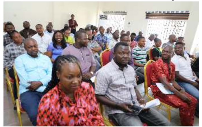
Cross Section of Staff at HYPREP General Meeting