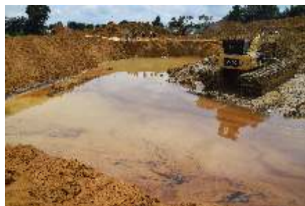
Remediation in Progress