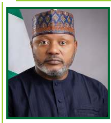
BARR. MOHAMMED H. ABDULLAHI MINISTER OF ENVIRONMENT

"Today, on behalf of the Ministry of Environment, I presented a memo to