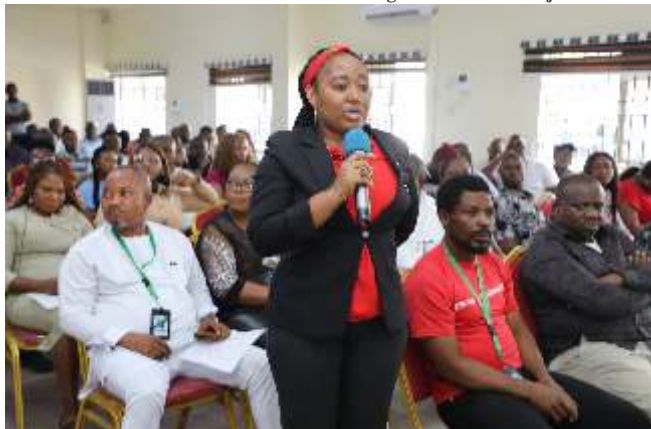
A Member of Staff Makes Intervention at HYPREP General Meeting