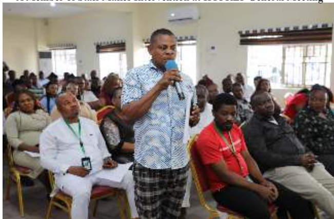
A Member of Staff Makes Intervention at HYPREP General Meeting