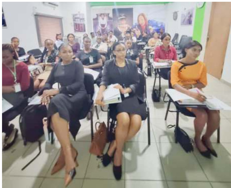
Air Cabin Crew Trainees in Class

study because it is all about what you know. So, it is very important that you concentrate and focus in class. Make sure you are doing what you are told by the instructor and ask questions where necessary and when required and most importantly, make sure you pass your exams. It is very important to us because if you pass, you have passed."