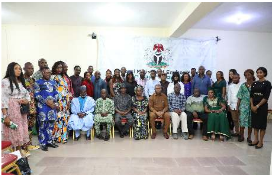
Air Cabin Crew Trainees Pose with Family and HYPREP Management during their Send Forth

His words, 'I am joyful to have the first batch of the Ogoni Cabin Crew trainees seated here. I have not met any cabin crew personnel of Ogoni origin all my life and was looking forward to a day like this. Today marks the beginning of a new life for you. It is an opportunity that will take you to a place you never dreamed of, for you and your future generation. Most of you will end up in international airlines and ply your trade all over the world.'