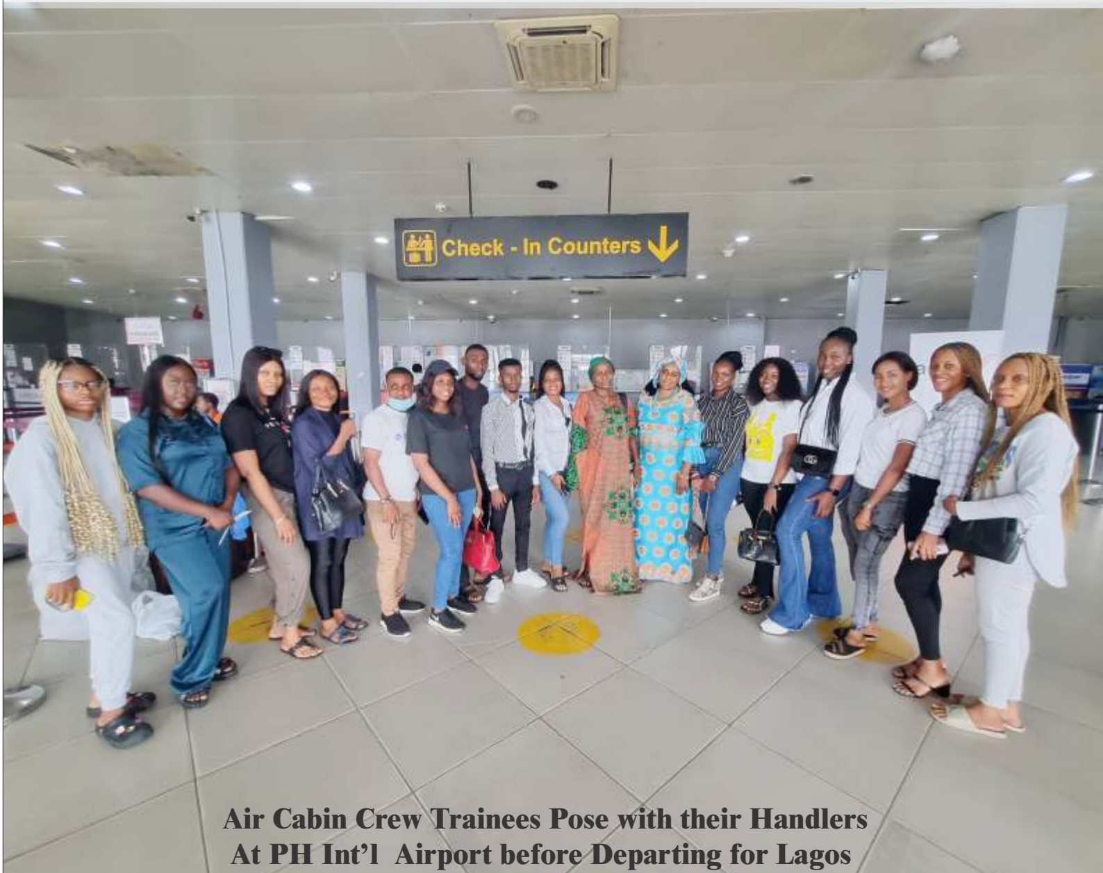
Air Cabin Crew Trainees Pose with their Handlers At PH Int'l Airport before Departing for Lagos

FG APPROVES CONTRACTS FOR OGO NI SPECIALIST HOSPITAL, CENTRE OF EXCELLENCE