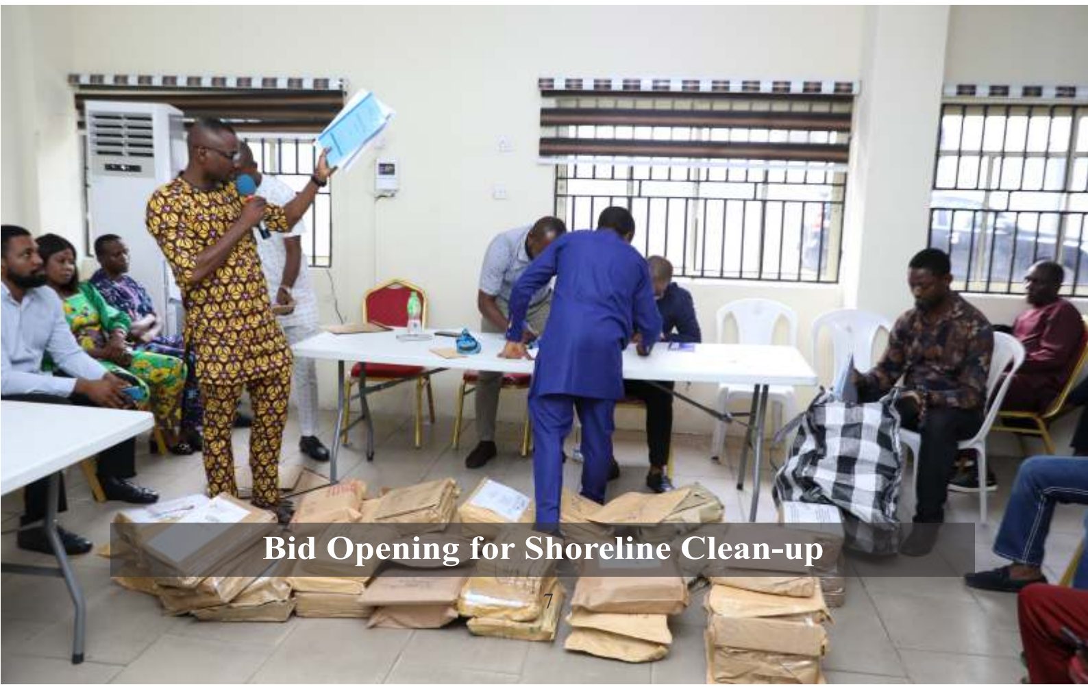
Bid Opening for Shoreline Clean-up

'The shoreline remediation is not a haphazard process; it is a methodical system that is scientific and so you must bring your best foot forward for those that will win.'