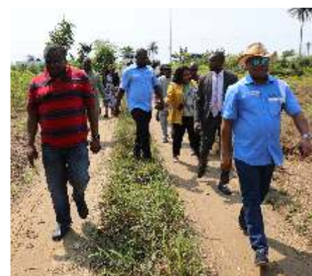
Visit to Wiiyaakara Site for Centre of Excellence

The hospital will be sited in Tai being the only Local Government Area in Ogoni that does not have a General Hospital and it is conceived to serve as a reference hospital for the entire Niger Delta region to be a fully sustainable top brand hospital to meet the medical needs of today and tomorrow.