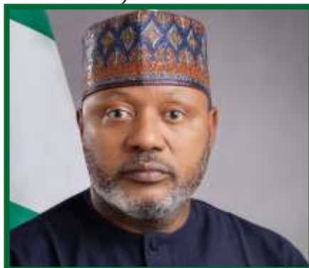
BARR. MOHAMMED H. ABDULLAHI MINISTER OF ENVIRONMENT

The construction of the National Centre of Excellence in Environmental Restoration is a recommendation of the United Nations Environment Programme (UNEP) Report being the fallout of the UN Agency's assessment of the Ogoni environment between 2009 and 2011. The Centre will be a top-notch international research institute for the oil industry and will also house an Integrated Contaminated Soil