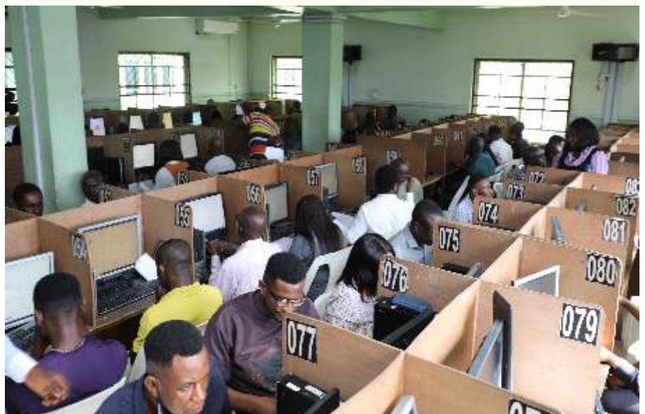
Applicants During the HYPREP Computer Based Test for Post Graduate Scholarship

Over eight hundred (800) applicants participated in the Computer Based Test which was conducted in Port Harcourt under strict and transparent condition to select only the best for the scholarship programme.