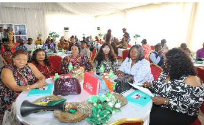
Cross Section of Participants at HYPREP Project Review Meeting