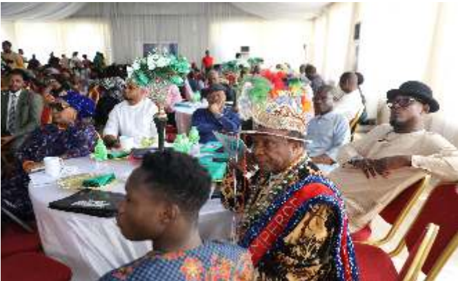
Cross Section of Participants at HYPREP Project Review Meeting