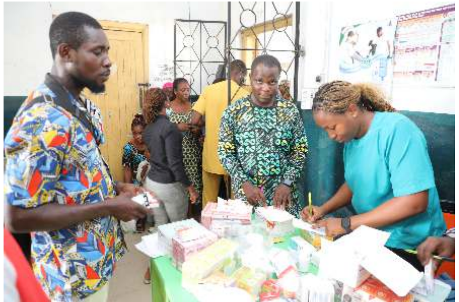
Patients Receiving Medication at the HYPREP Health Outreach

They are Ogoni sons and daughters they understand the issues and we