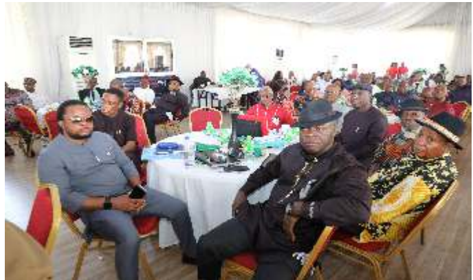
Cross Section of Participants at HYPREP Project Review Meeting