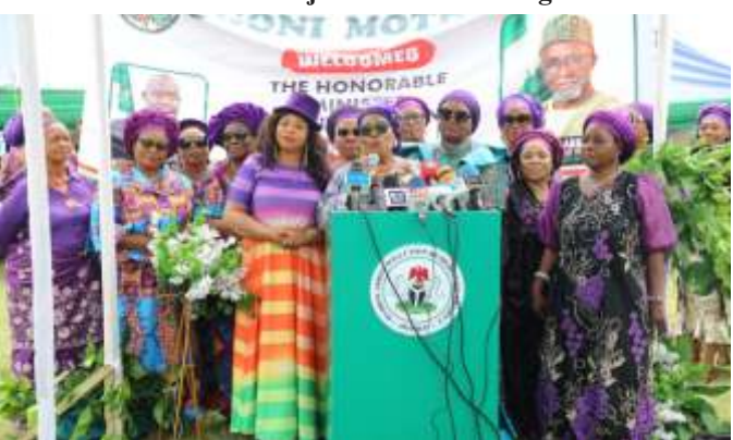
Ogoni Mothers at the Bomu Water Project Commissioning