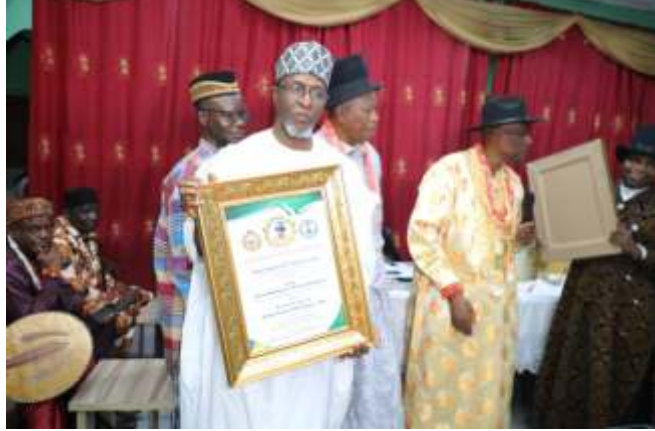
Gokana Council of Chiefs Presents an Award to Minister of Environment, Mene Balarabe Abbas Lawal