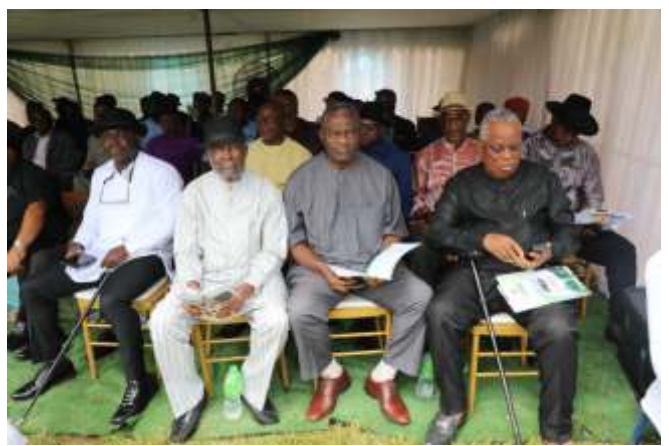
Cross Section of Ogoni Elites at the Bomu Water Project Commissioning