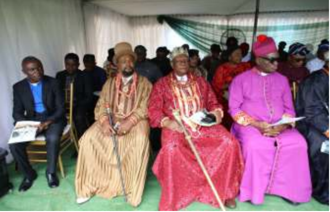
Some Traditional & Religious Leaders at the Bomu Water Project Commissioning