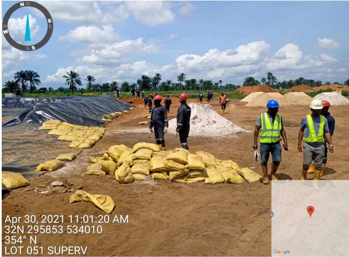
Plate 4: Engineered Biocell at advance stage of construction at Lot 051 at Okuluebu, Ogale in Eleme L.G.A. Completion activities include stabilization of the entrance, completion of the construction of the leacheate sump and the installation of the sharp sand conducting layer. (Remediation Contractor= Erotina Nig. Ltd).