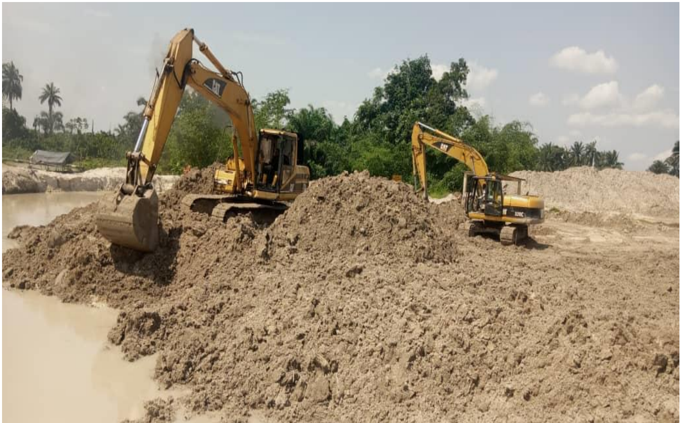
Plate 1: Backfilling of excavated pit with treated soil at Lot 009 (Saanako) in Mogho, Gokana L.G.A. (Contractor: Odun Environmental Ltd).

At Lot 009 (Saanako - Mogho, Gokana L.G.A), the Contractor has already commenced backfilling of the excavated part of the delineated impacted area upon the authority of HYPREP to do so after the requisite Monitoring {Quality Assurance / Quality Control (QAQC) processes.