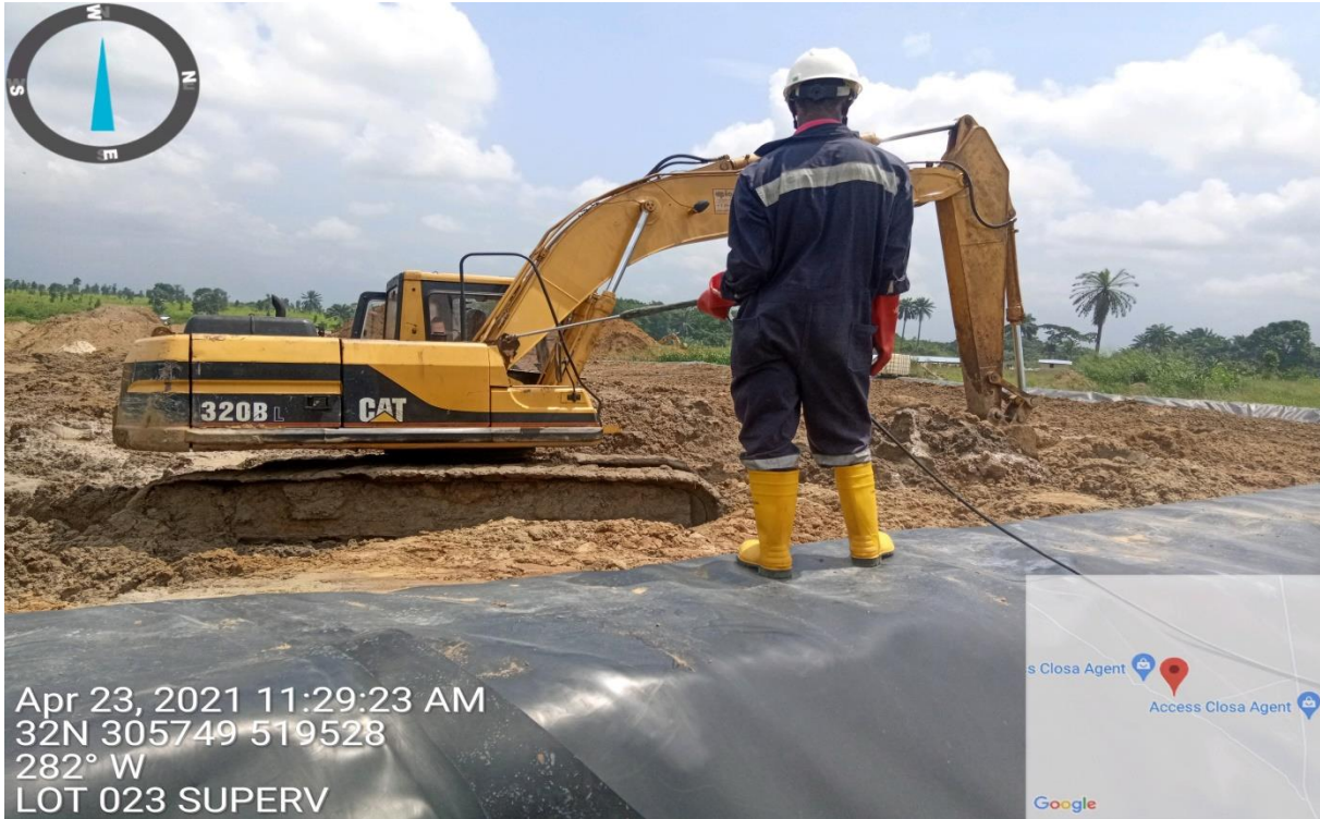
Plate 3: Completed Engineered Biocell already in use at Lot 023 (B.Dere/Gio site in Gokana/Tai L.G.A). Application of nutrient additive /remediation product with the use of pressure spraying pump and mechanical homogenization of the soil under treatment on-going. (Remediation Contractor = Cascade Engineering Systems Ltd).