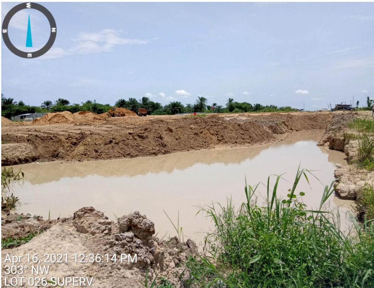
Plate 6: Backfilling of excavated pits with treated soil in progress at Lot 026 (B. Dere / Gio Site in Tai L.G.A). (Remediation Contractor= EarthQuest International Ltd).