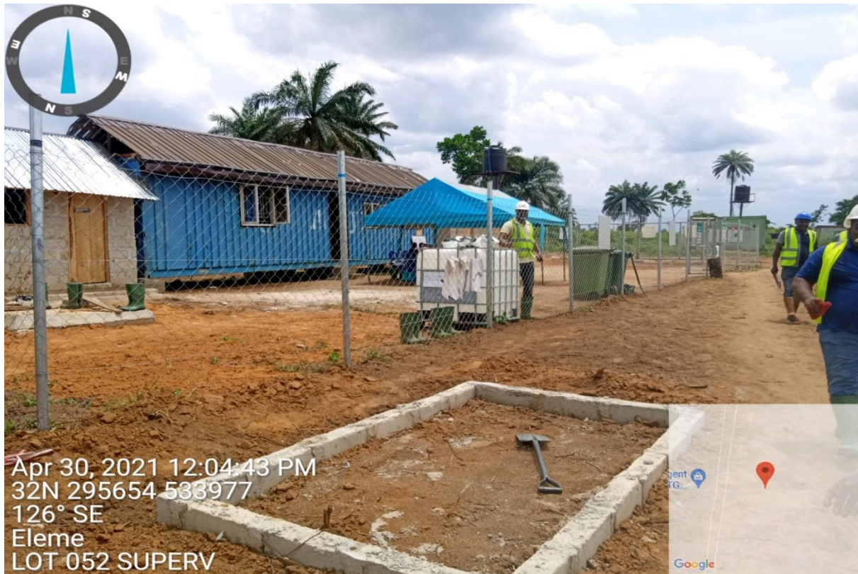
Plate 2: Setting up of Site Office at advance stage of completion at Lot 052, Okuluebu, Ogale in Eleme L.G.A. (Remediation Contractor = Montego Upstream Services Ltd).

Twenty-six (26) of the twenty-nine (29) lots in Batch 2 have either completed the construction of their engineered biocells or at about 90%. Only three Lots (Lot 027, 032 and 055) have not started the construction of biocells.