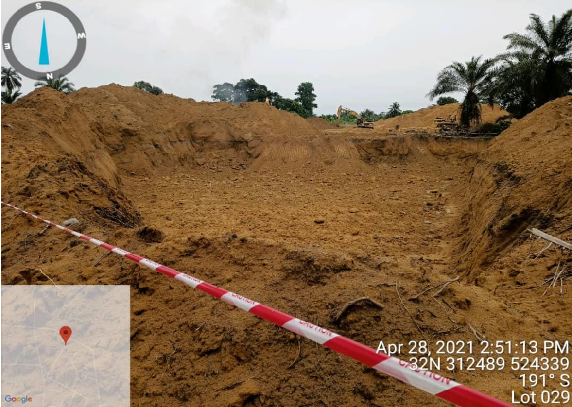
Plate 7: Commencement of excavation of impacted soil from delineated impacted area for treatment at Lot 029 (Aabue Korokoro Flow Station in Tai L.G.A). ( Remediation Contractor = Weafri Wells Services Ltd ).