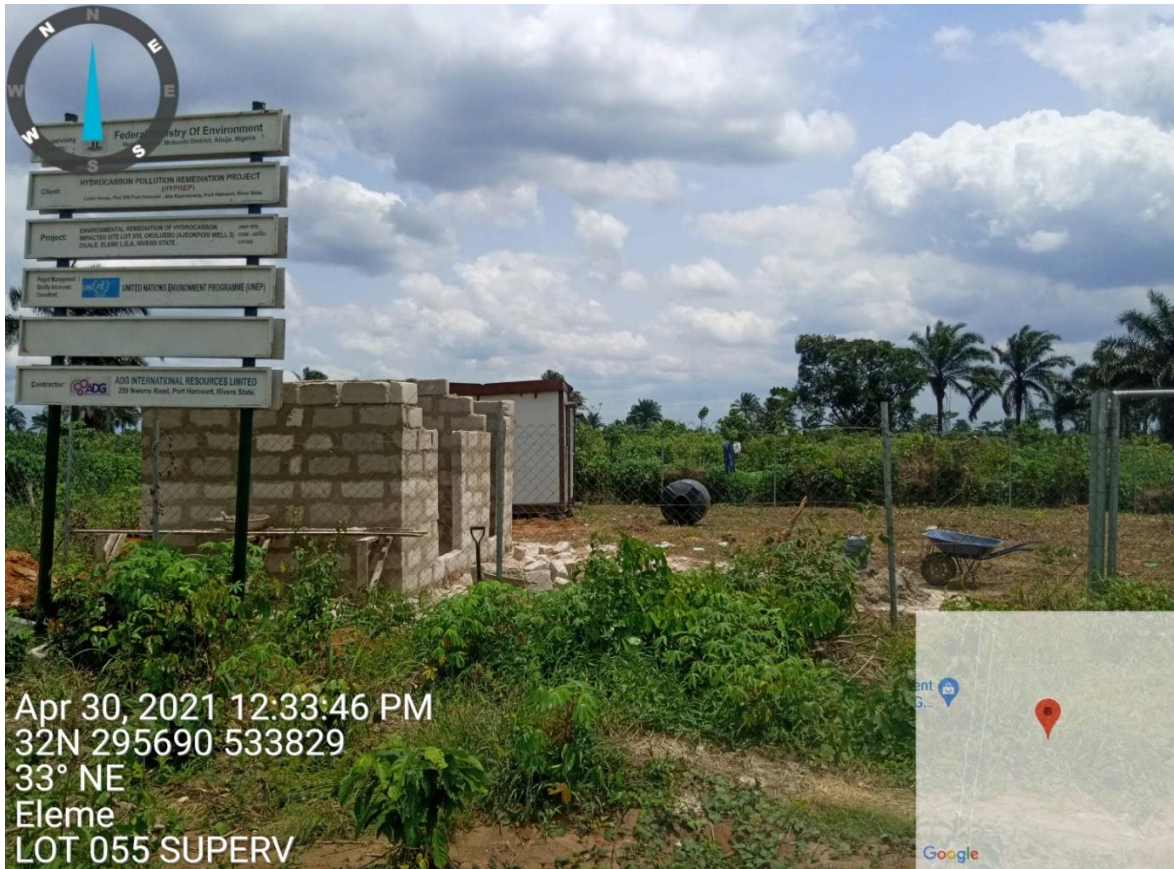
Plate 8: Excavation work is yet to commence at Lot 055 (Okuluebu, Ogale, Eleme L.G.A) as Office Set-up is still at a lower level and Biocell construction is expected to be undertaken in the following weeks. (Remediation Contractor = ADG International Resources Ltd).

Detailed information on the Status of On-going Remediation Works under Phase 1, Batch 2 is summarized in Table 3 below: