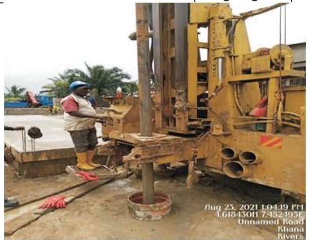
Borehole Development at Bori