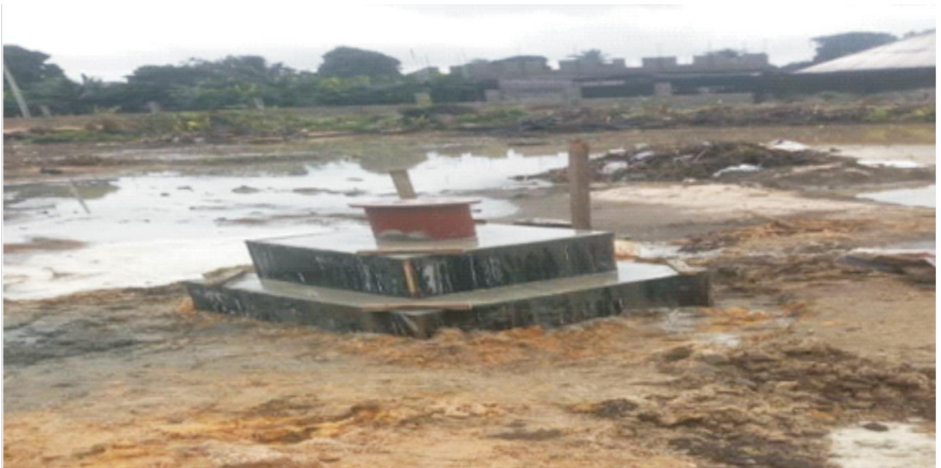
Construction of Borehole Head at Nonwa