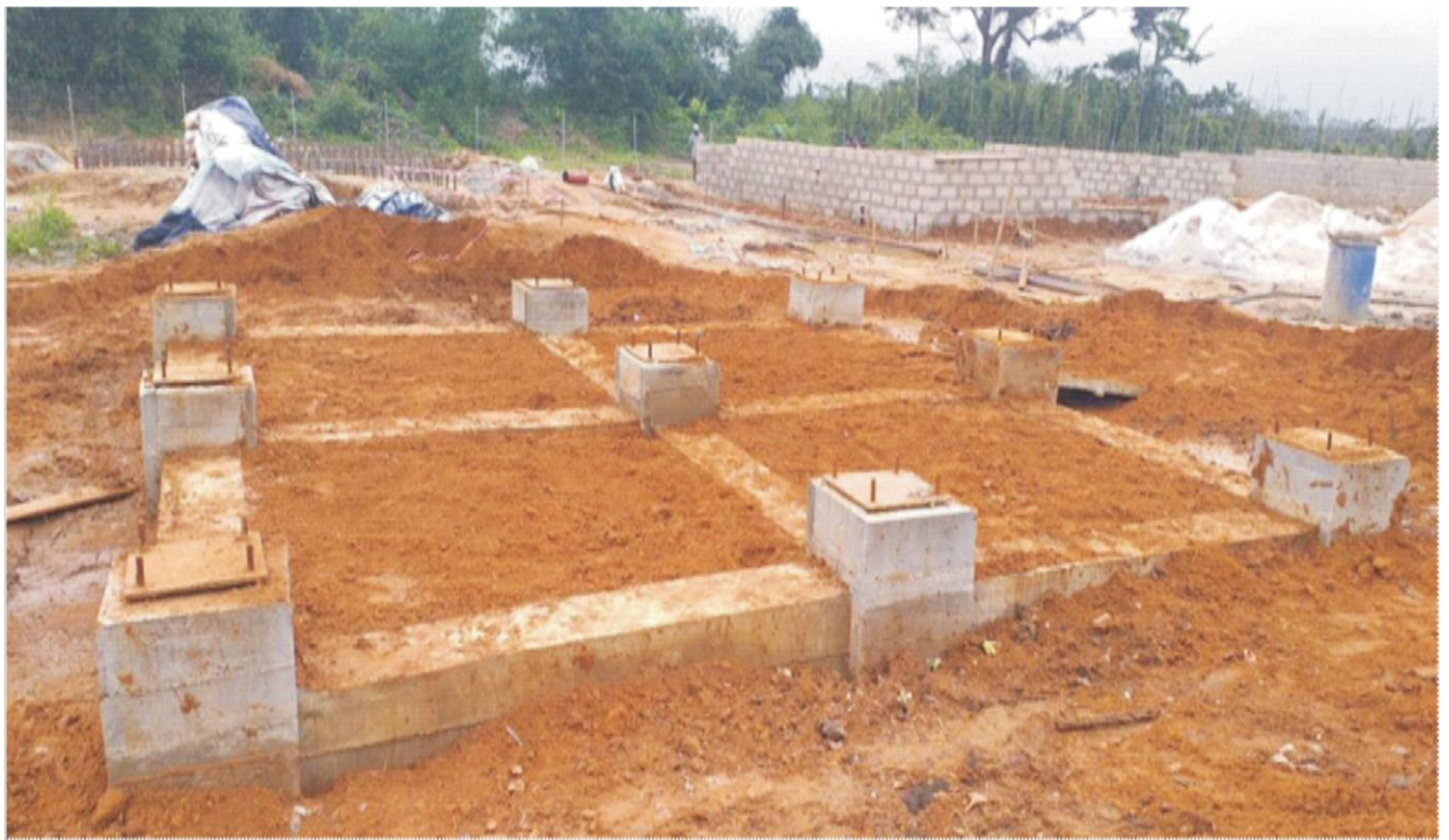
Construction of Foundation for Overhead Tank at Barako