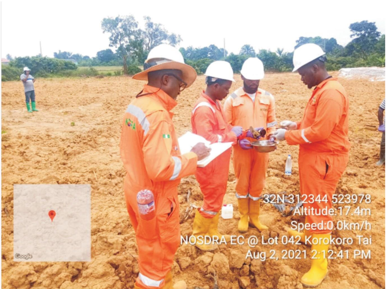
Plate 1.5: Collection of soil samples during the NOSDRA Close-out / Certification Sampling visit to Lot 042 at Korokoro Well 4, Tai L.G.A). Contractor: KANNY KOY LTD.