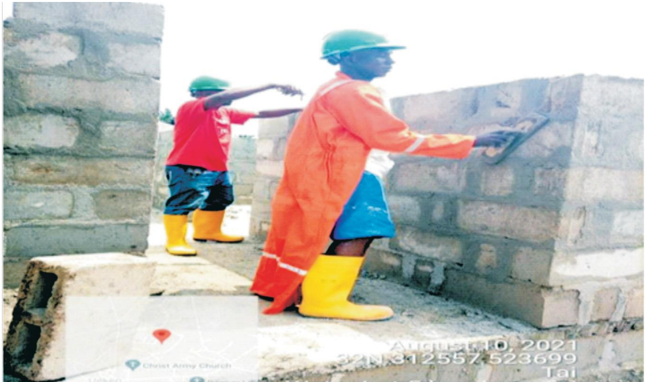
Construction of Staff Quarters at Korokoro