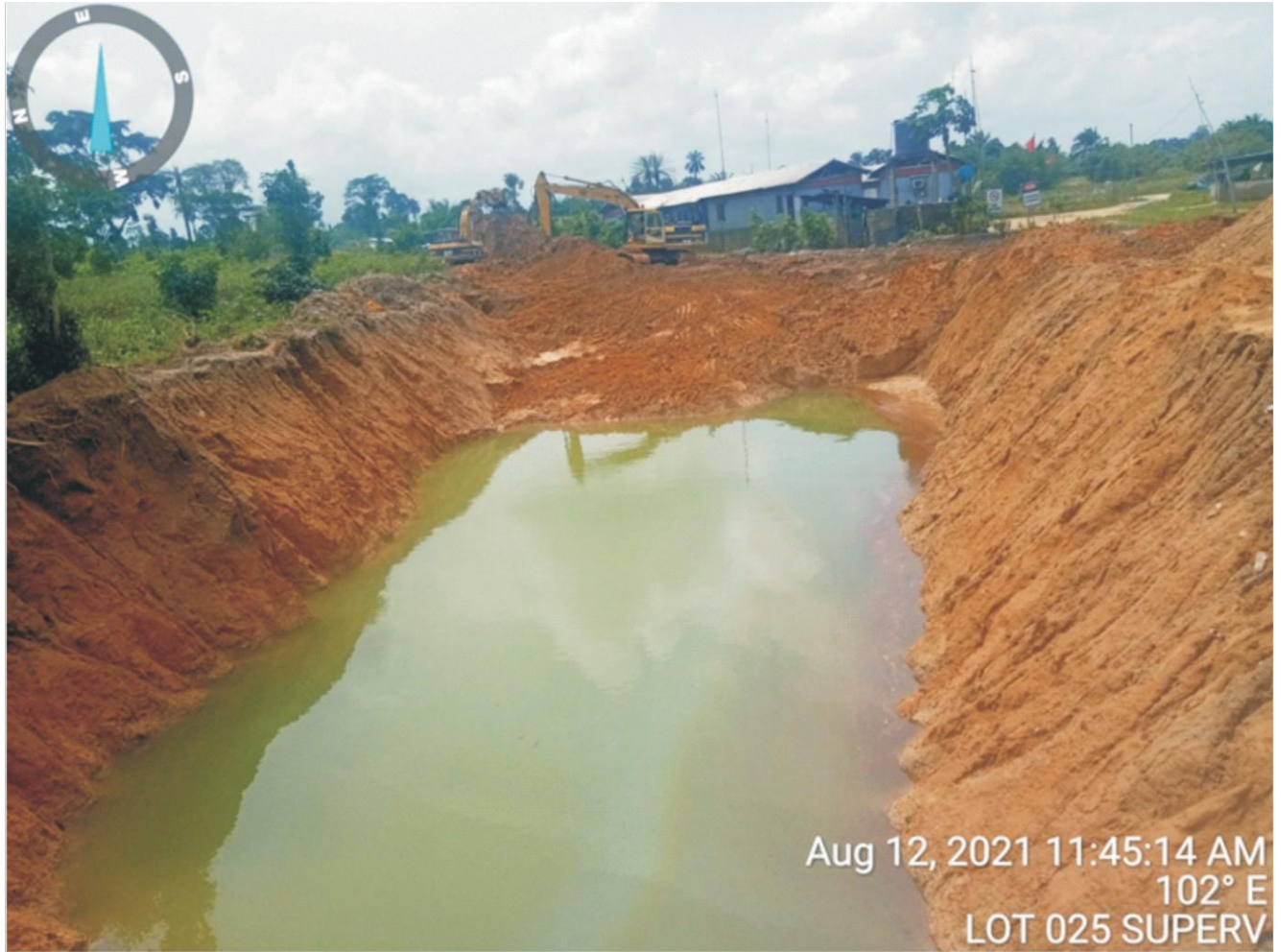
Plate 1.2: Excavation and serial transferring of impacted soil in progress at Lot 025 (B.Dere/Gio, Gokana/Tai L.G.A). (Remediation Contractor= SUBADOM GLOBAL RESOURCES LTD).

Detailed information of remediation work performance status of Phase 1 Batch 2 sites is summarized in Table 1.5 below: