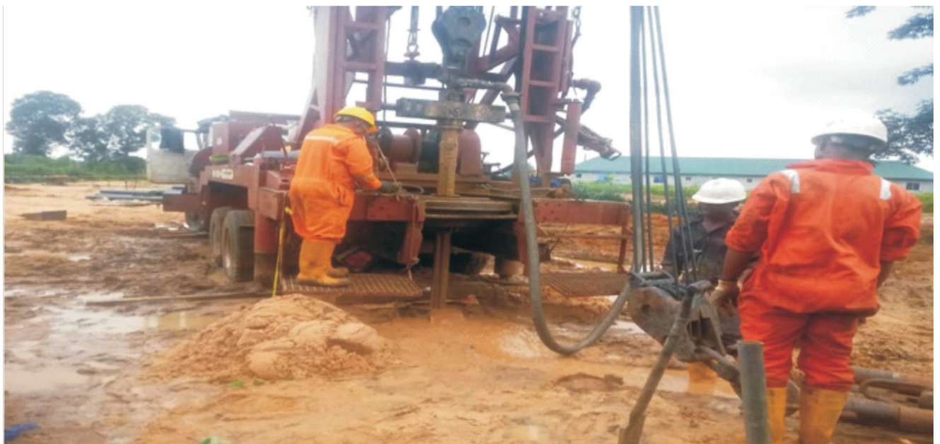
Drilling of Borehole at B-Dere