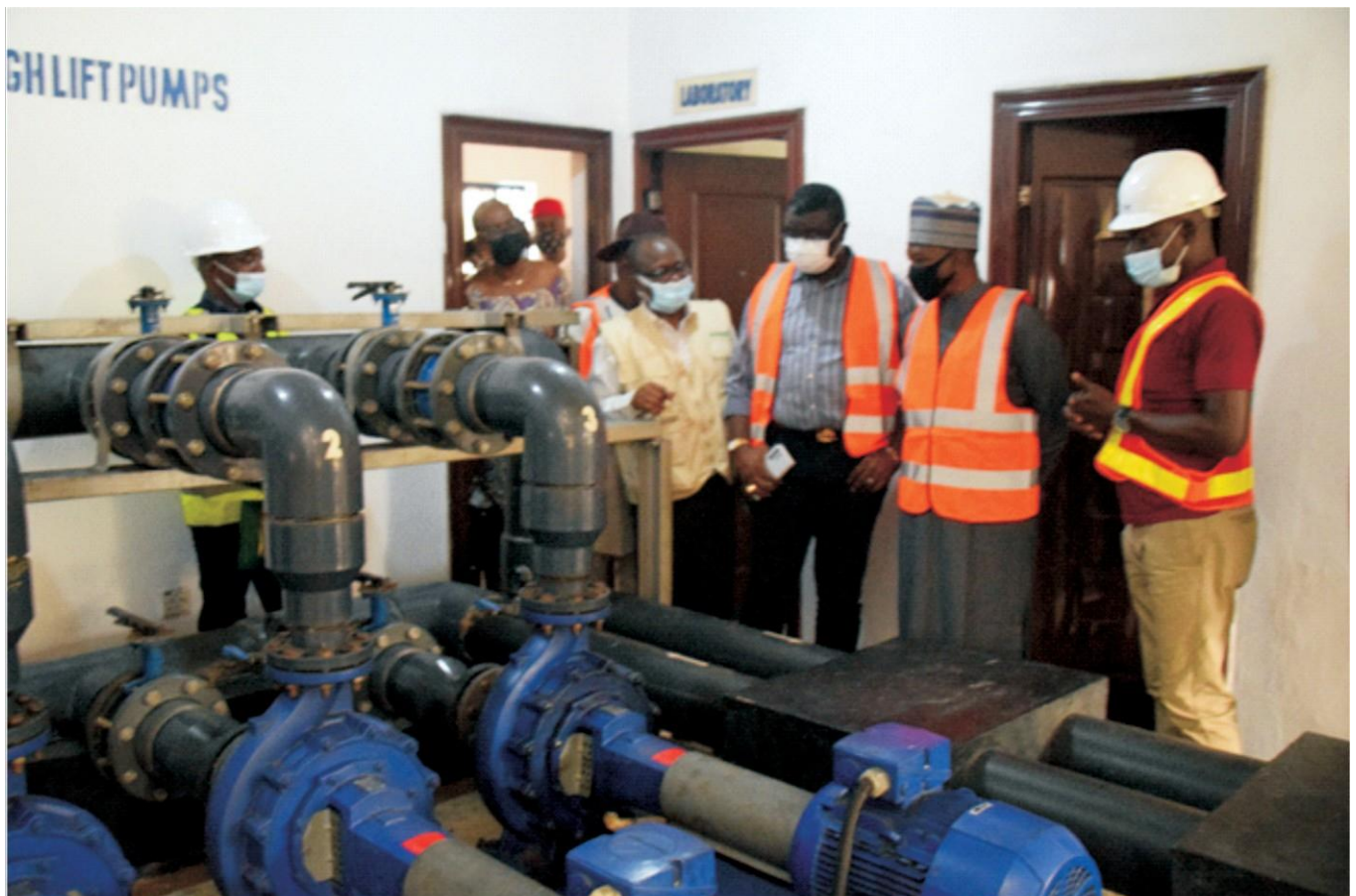
The Hon. Minister of Environment at Alesa Water Station

The Hon. Minister of Environment, Dr. Mohammad Mahmood Abubakar during his official visit to Ogoni in the month of August 2021, carried out inspection of the ongoing water project in Eleme LGA. The Hon. Minister was accompanied by members of GC, BoT, CRAC, the Officer Overseeing the Project Coordination Office, Development partners and other Stakeholders.