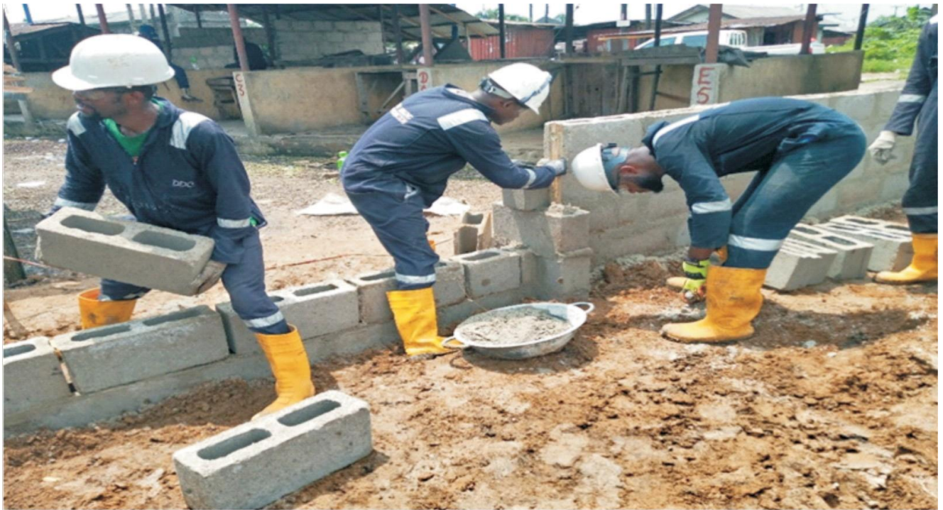
Plate LT02.1: Mixing of mortar for block fencing