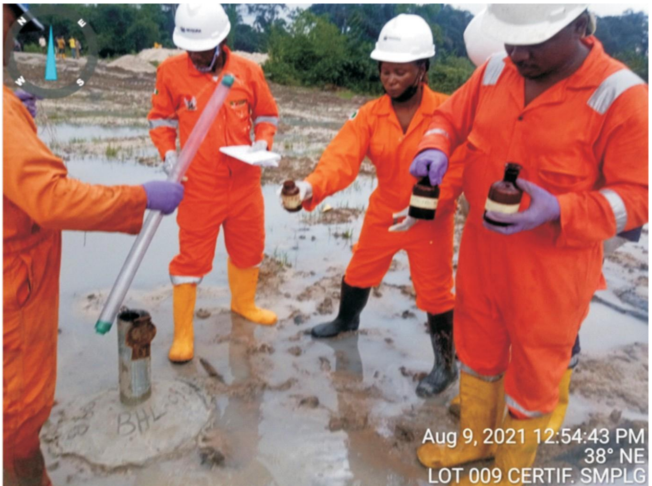
Plate 1.4: Collection of groundwater samples from installed remediation monitoring boreholes during the NOSDRA Close-out / Certification Sampling visit to Lot 009 at Saanako, Mogho, Gokana L.G.A). (Contractor: ODUN ENVIRONMENTAL LTD).

The exercise involved joint participation of personnel from the National Oil Spill Detection and Response Agency (NOSDRA), Hydrocarbon Pollution Remediation Project (HYPREP), Rivers State Ministry of Environment and Natural Resources (RMENR) and the Stakeholders Democracy Network (SDN).