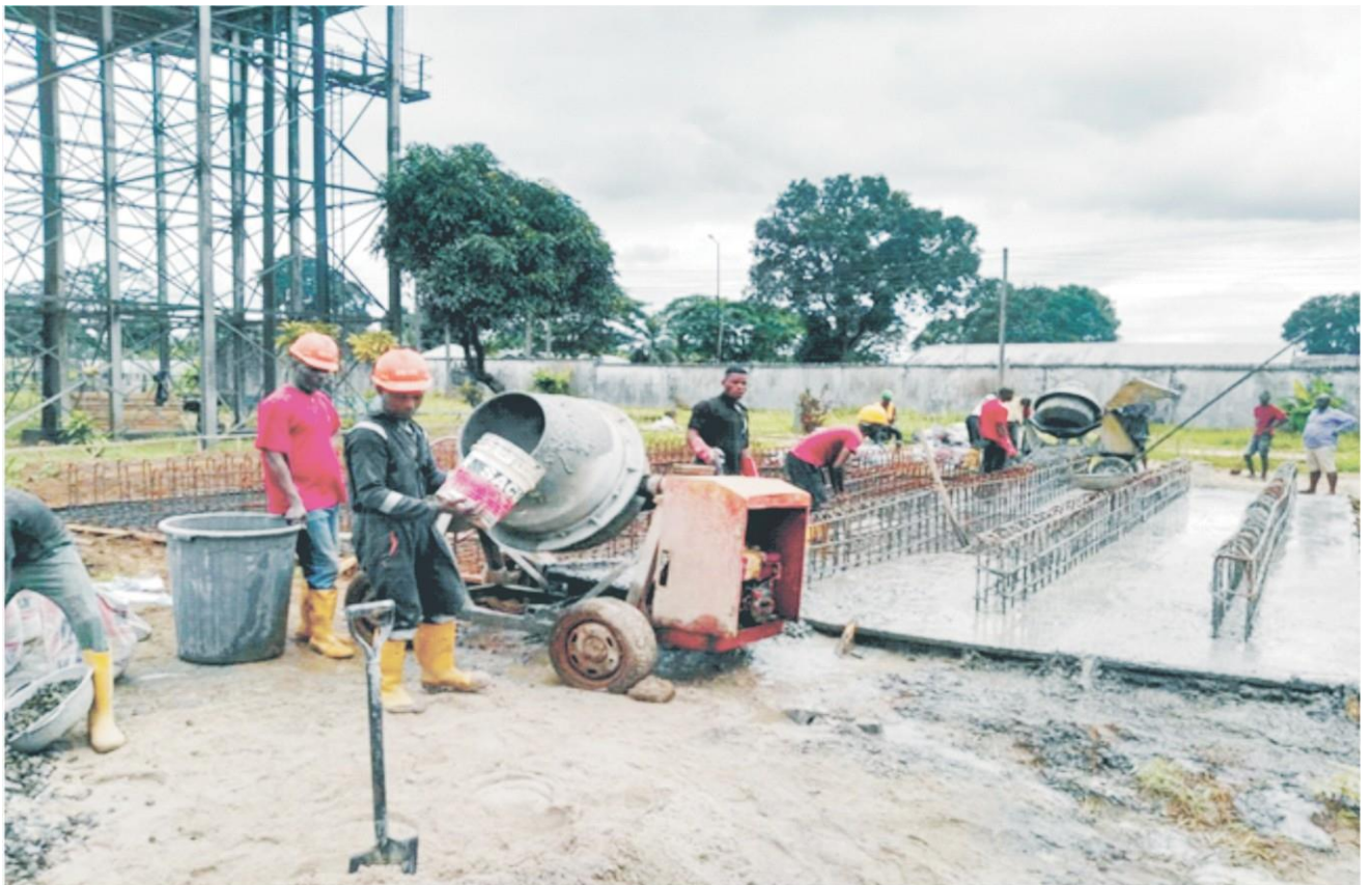
Construction of Foundation for Ground Tank at Terrabo