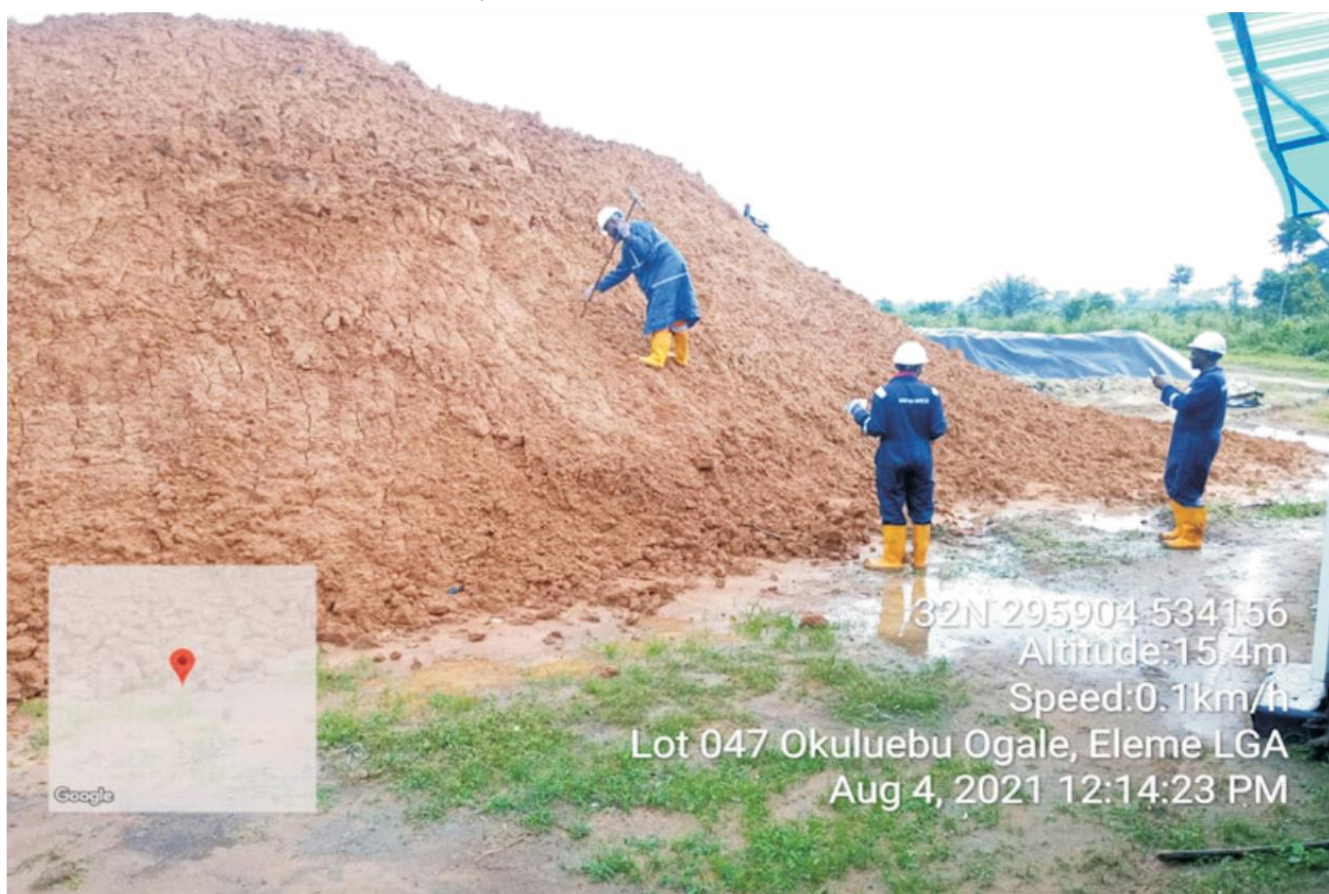
Plate 1.3: Quality Assurance / Quality Control (QA/QC) and Remediation Execution Officers from the Operations Unit of HYPREP collecting QAQC Monitoring Samples from treated soil volumes with the Contractor representatives at Lot 047 Okuluebu, Eleme L.G.A). Remediation Contractor = LAPIDEO MULTISERVICES LTD.

Series of Quality Assurance / Quality Control (QAQC) monitoring sampling and analyses were undertaken at Lots due for such by the HYPREP Operations Unit QAQC and Remediation Execution Teams in August 2021. Plate 1.3 below show the activity carried out at Lot 047 while Table 1.5 that follows shows undated overview of the activity across Phase 1 Batch 2 Lots.