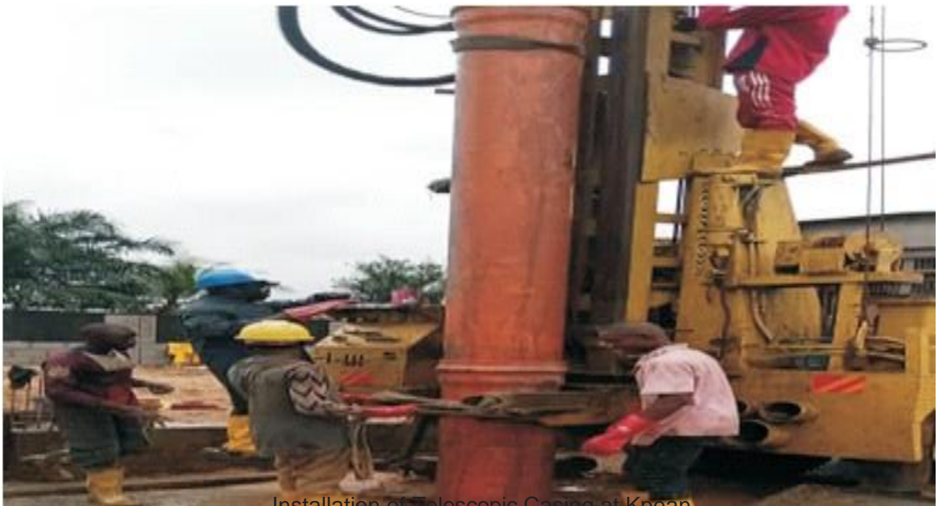
Installation of Telescopic Casing at Kpean