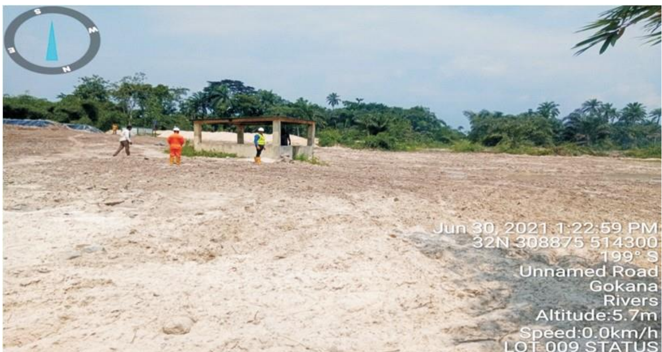
Plate 1.1: Lot 009 (Saanaiko) in Mogho, Gokana L.G.A after backfilling of excavated pits and general site levelling. (Contractor: ODUN ENVIRONMENTAL LTD).

At Lot 016 (Buemene Korokoro Well 5, Tai L.G.A), the Contractor has started preparing the site to continue backfilling of ready segment of excavated pit as well as the excavation and treatment of other unattended parts of the delineated impacted area.