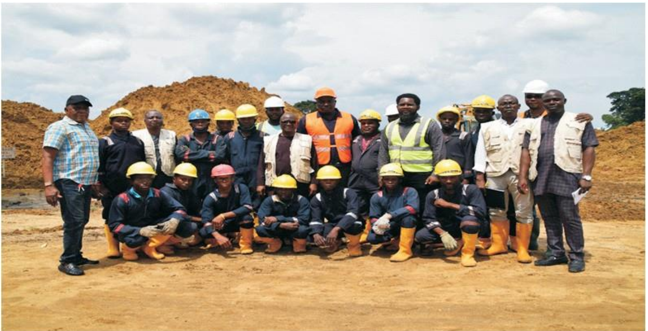
Plate 2.4: Group Photograph by HYPREP Inspection Team led by OOPCO with the Community. Workers and Site Manager at Lot 29 Korokoro, Tai LGA.