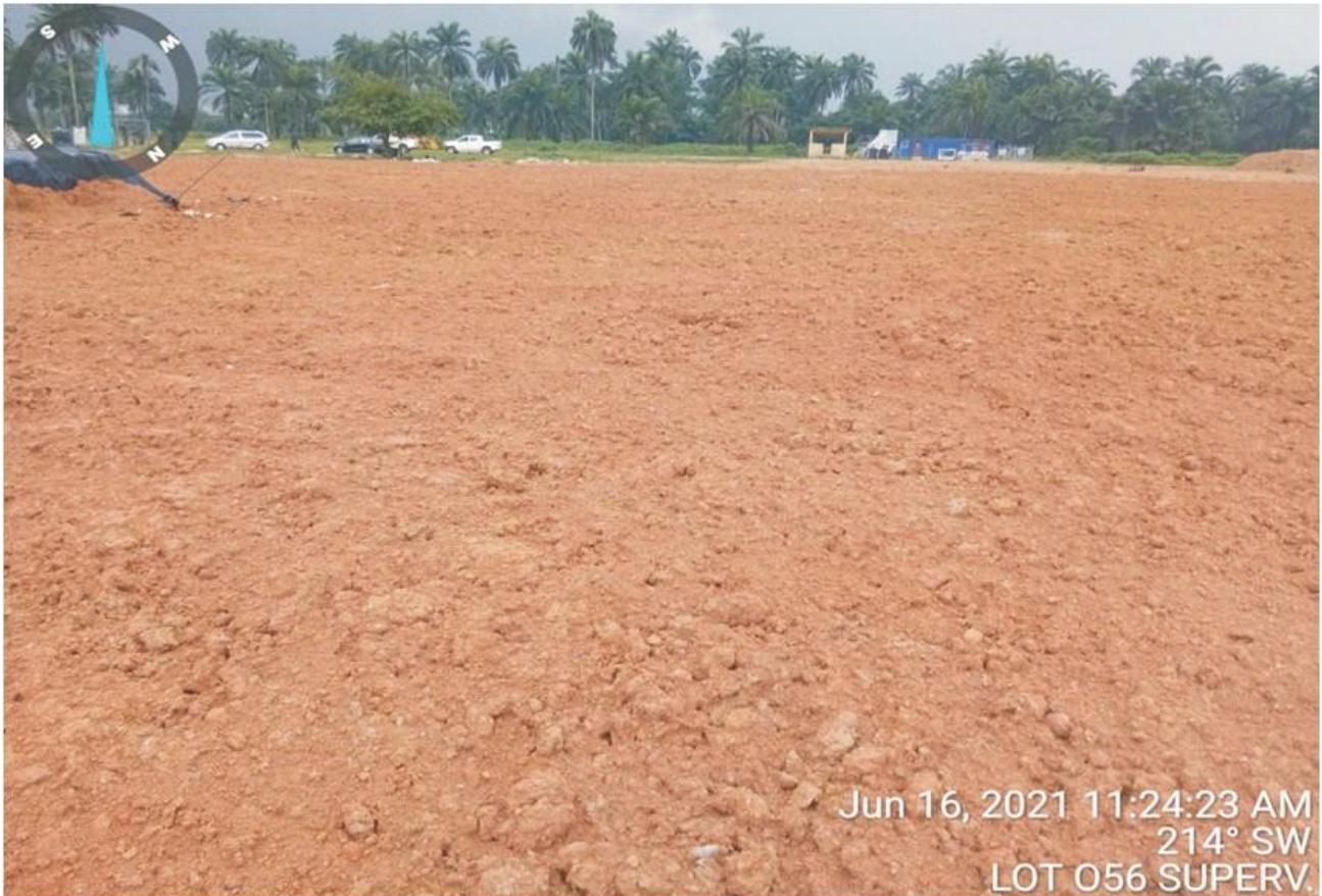
Plate 1.3: A panoramic view of the remediated area after backfilling and general site leveling at Lot 056 (New Elemenwa Manifold, Akpajo, Eleme L.G.A). (Remediation Contractor= AWA ENGINEERING COY LTD).