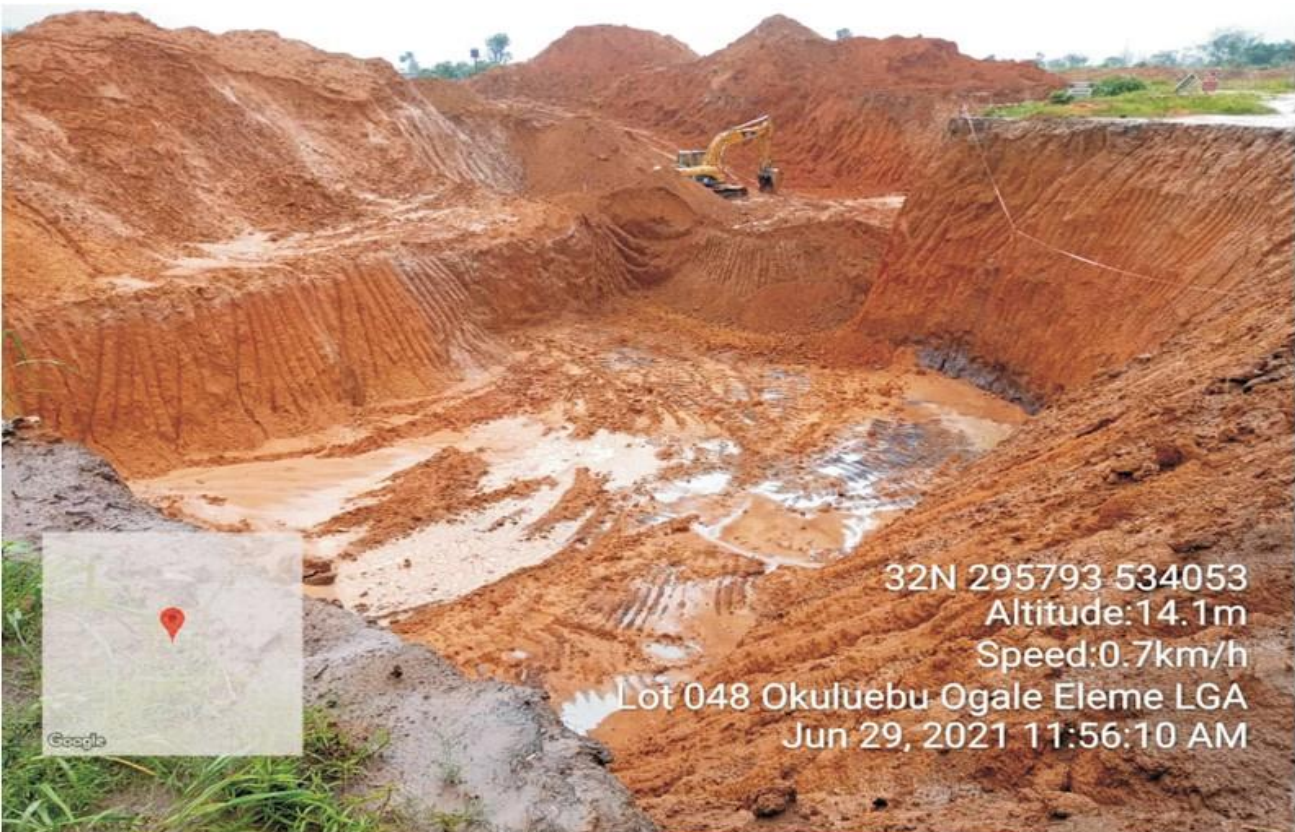
Plate 1.4: Ongoing excavation of impacted soil from delineated area for treatment at Lot 048 (Okuluebu, Ogale in Eleme L.G.A). (Remediation Contractor= SLOT ENGINEERING NIG. LTD).