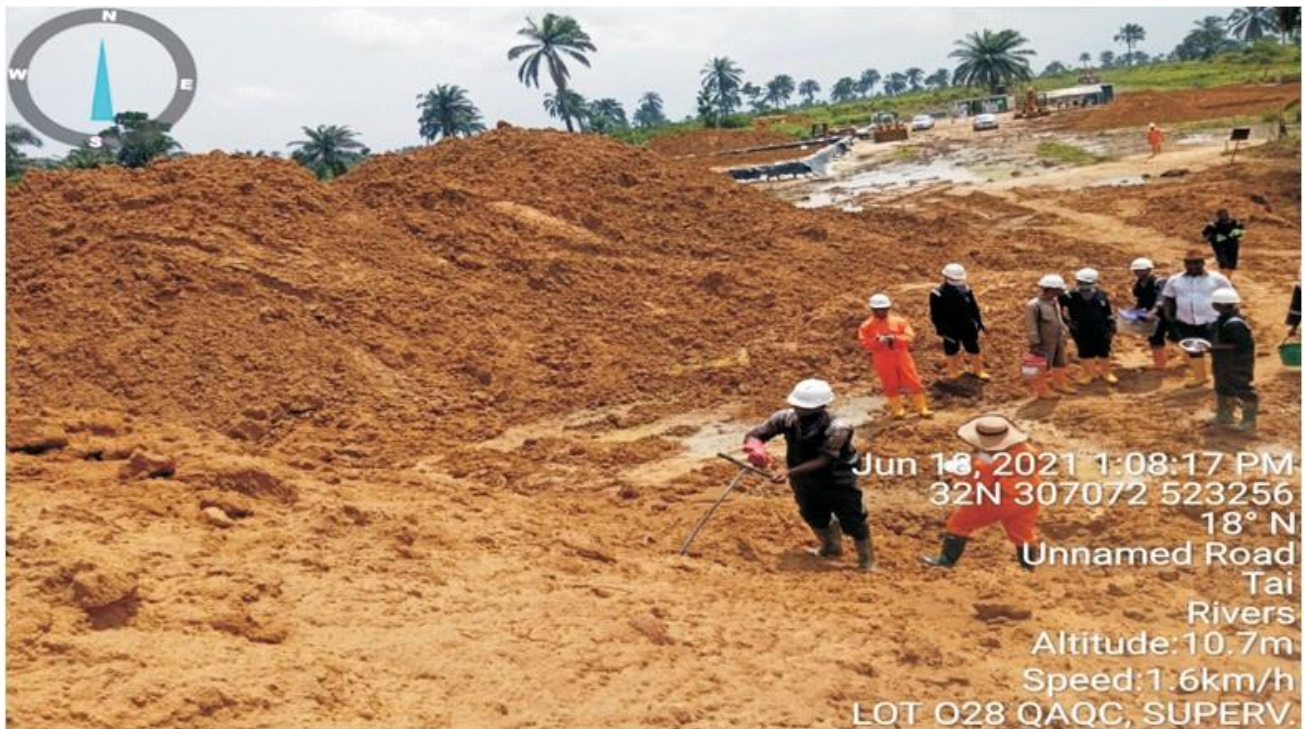
Plate 1.5: Quality Assurance / Quality Control (QA/QC) and Remediation Execution Officers from the Operations Unit of HYPREP collecting QAQC Monitoring Samples from treated soil volumes with the Contractor representatives at Lot 028 (Bara Alue, Tai L.G.A). (Remediation Contractor = EMAMEDNIG. LTD).

Detailed information of remediation work performance status of Phase 1 Batch 2 sites is summarized in Table 1.5 below: