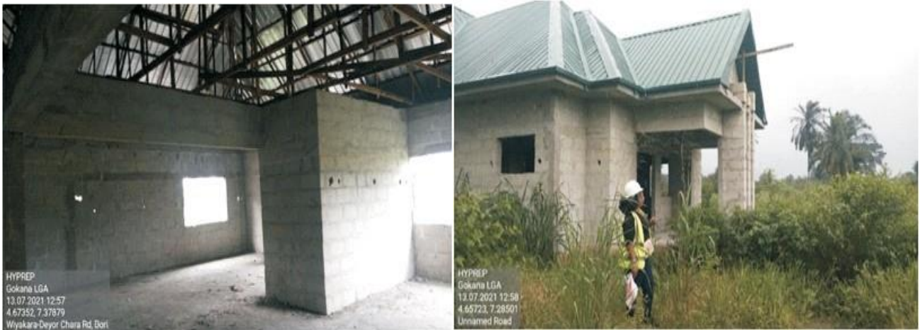
Internal and External Works

(c) Gokana LGA: The Contractor has also completed the erection of the super structure and installation of the roof covers and structure of the office building. Looking ahead to finishing works including plastering, installation of plumbing, electrical fitting and the office doors and windows.