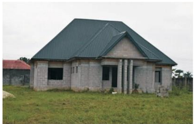
Internal and External Works

(b) Khana LGA: The Contractor has completed the execution of the Super structures, roofing, fittings of doors, windows, electrical piping and plastering. Currently, work is in progress with the installation of POP ceilings. Looking ahead are plumbing, tiling and electrical fitting works.