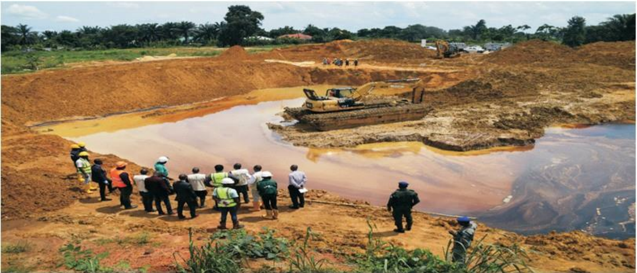
Plate 2.1: Head, Operations & Officer Overseeing HYPREP PCO at Lot 030 in Korokoro, Tai L.G.A during the HYPREP Management Monitoring Visit. (Contractor: ELZAX BLEET NIG. LTD).