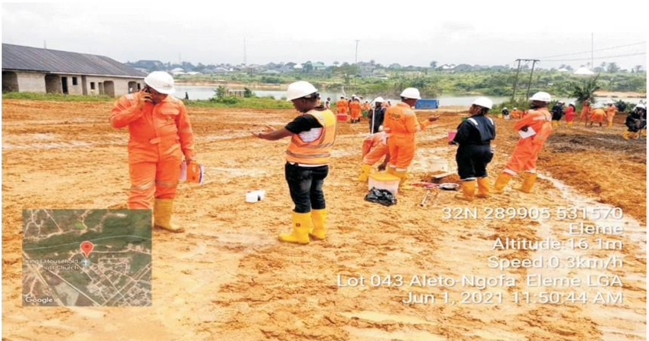
Plate 1.7: Collection of soil samples by manual slim hole augering during NOSDRA Close-out/Certification sampling at Lot 043, Aleto (Ngofa), Eleme L.G.A). Contractor: OTAOLIF SERVICES NIG. LTD.