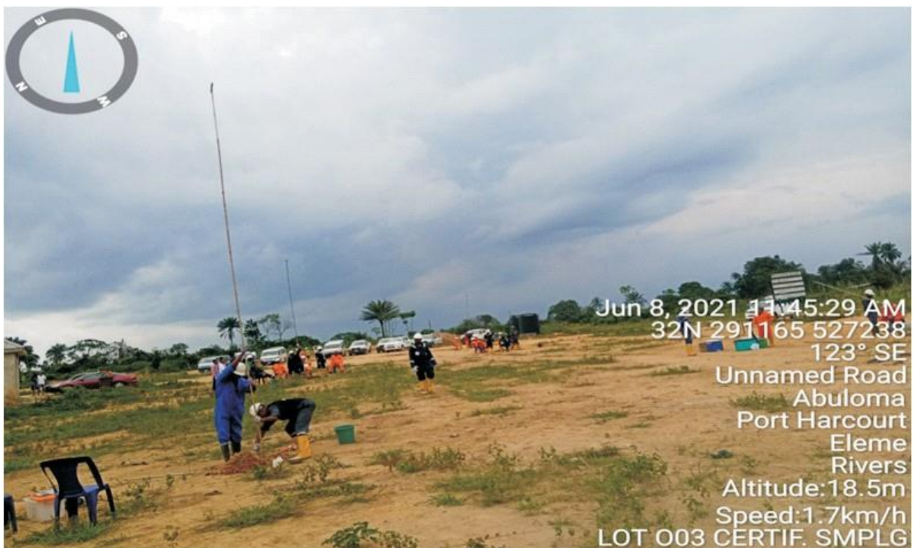
Plate 1.6: Collection of soil samples by manual slim hole augering during NOSDRA Close-out/Certification sampling at Lot 003 (Nkeleoken –Alode, Eleme L.G.A). Contractor: PACRIM ENGINEERING NIG. LTD.