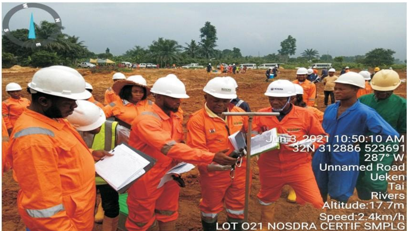
Plate 1.8: Fixing of pre-determined sampling points by GIS experts during NOSDRA Close-out/Certification sampling at Lot 021 (Aabue-Ueken, Tai L.G.A).