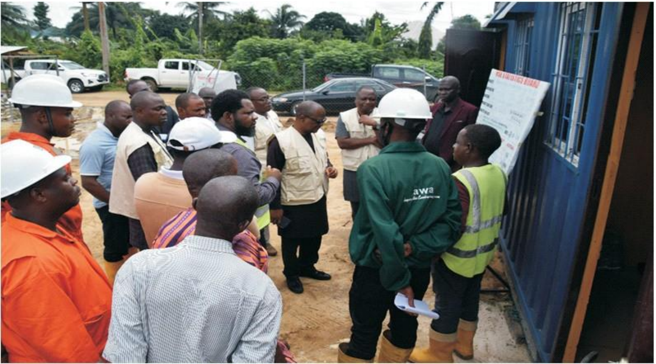
Plate 2.3: Head, Operations & Officer Overseeing HYPREP PCO examining Contractor's Health, Security, Safety and Environment (HSSE) Statistics at Lot 042 in Korokoro, Tai L.G.A