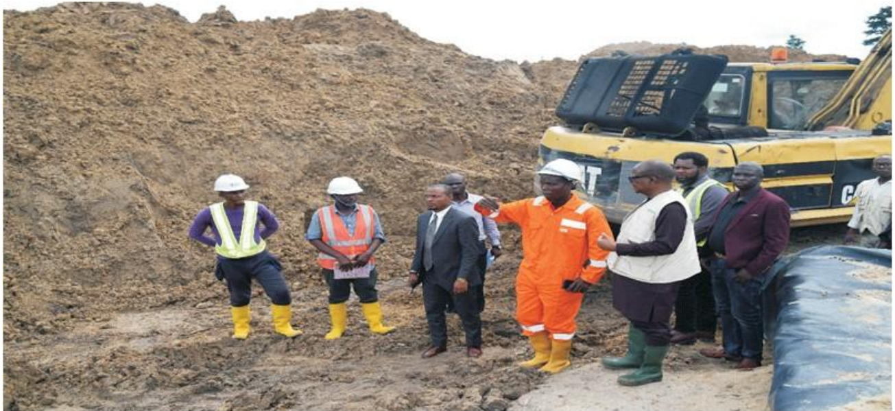
Plate 2.2: Head, Operations & Officer Overseeing HYPREP PCO at Lot 025 at B.Dere/Gio Site in Gokana/Tai L.G.A during the HYPREP Management Monitoring Visit