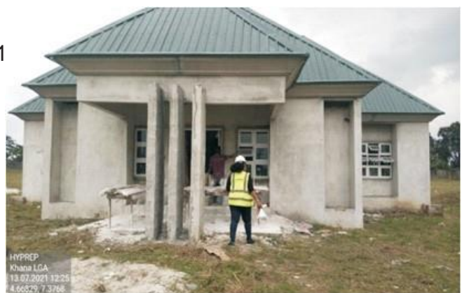
Fabrication of the POP ceiling and the External Works