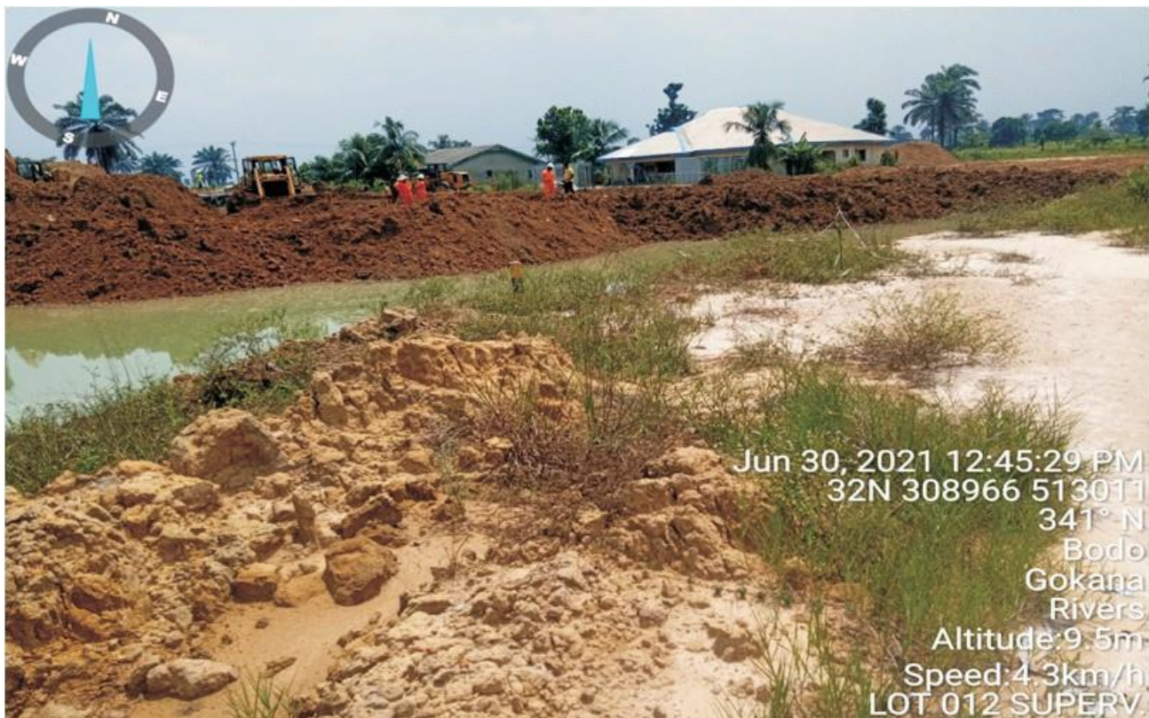
Plate 1.2: Concluding phase of the final backfilling of the excavated pits at Lot 012 Debon, Bodo/Mogho, Gokana L.G.A (Contractor: SHAMSA RESOURCES& SERVICES LTD).

Detailed information of remediation work performance status of the remaining five (5) Lots in Batch 1 is summarized in Table 1.1 below: